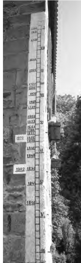
Figure 1: Wertheim.

The memorial in the harbor in Tönning on the German North Sea Coast recalls three severe storm tides in the nineteenth and twentieth centuries. Like the memorials for the victims of the world wars, storm tide memorials in the public sphere, such as these, are conceived as lieux de mémoire (Pierre Nora), except that in this case the memory concerns the victims of natural disasters rather than soldiers who died for the fatherland. The Tönning memorial is exceptional because it explicitly communicates a warning for the future: “Watch out for the next flood.” 43