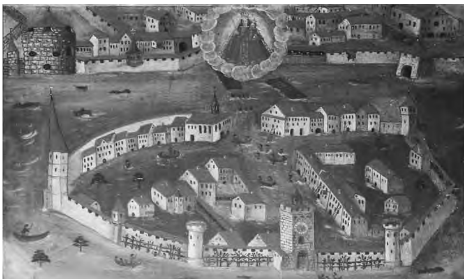
Figure 2: Painting of the Flood of Solothurn 1651. On display in the Spitalkirche zum Heiligen Geist, Solothurn, Switzerland.