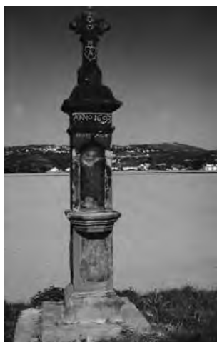
Figure 4: The “hail memorial” in the urban district of Kripp (in Rema- gen, Rhineland- Palatinate, Germany).