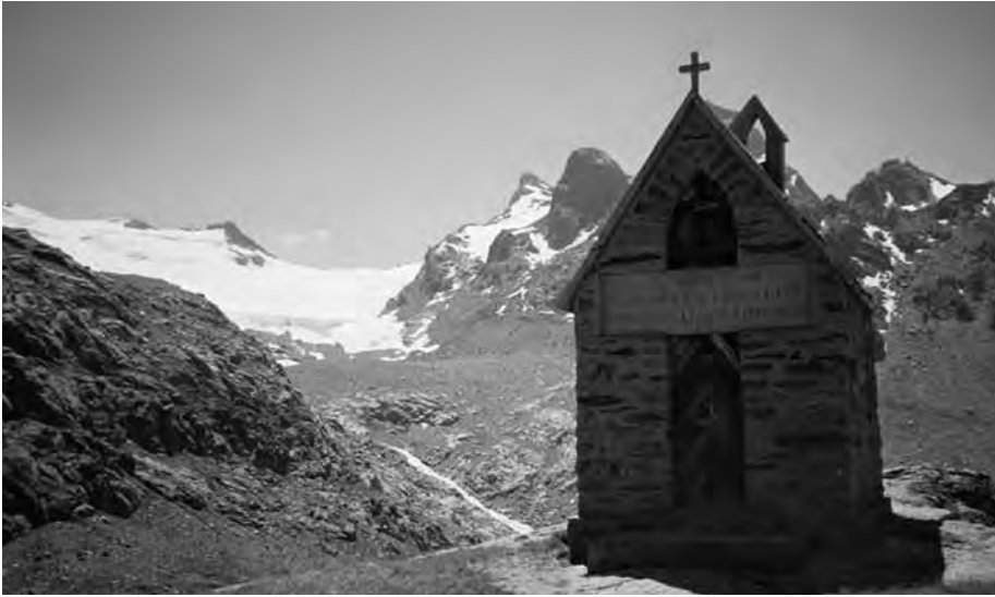
Figure 3: Chapel Lake Rutor, built 1606.