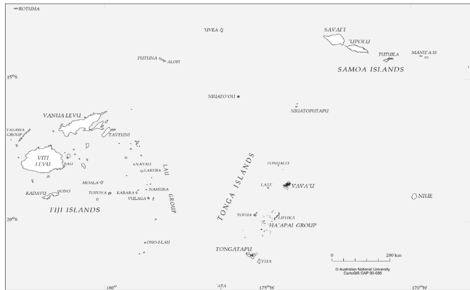
Figure 2: Map showing Fiji, Tonga, and neighboring islands. CartoGIS Services, College of Asia and the Pacific, The Australian National University.

Today Fiji is home to nearly 900,000 people. More than half are Indigenous Fijians or Taukei. The next biggest group is Indo-Fijian, its members mostly descended from labourers indentured under colonialism. Britain ruled Fiji from 1874 to 1970, but the importation of laborers from India effectively ceased in 1916.