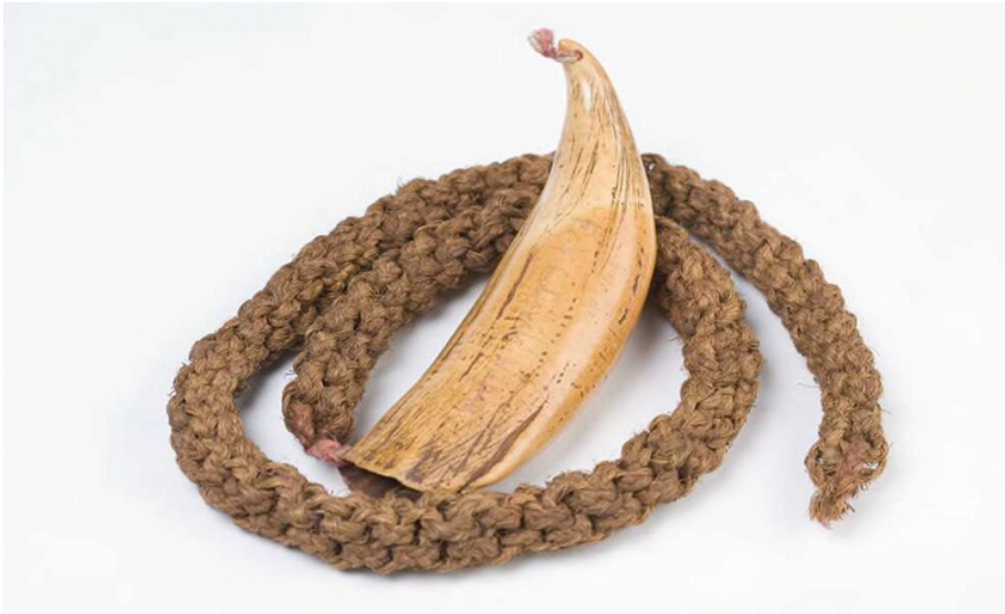
Figure 1: Tabua. Whale tooth presented in 1967 by the government and people of Fiji to the governor general of Australia, Lord Casey, on the disappearance of the Australian prime minister, Harold Holt. Ceremonial whale teeth have changed little in appearance since early nineteenth-century Fiji. “Whale Tooth with a Rope Attached to it,” National Library of Australia.

Cokanauto (ca. 1810–1851), also known as Mr. Phillips, was a high chief of the Fijian polity of Rewa. 1 He received the paramount Rewan title Roko Tui Dreketi in 1845. Although no integrated treatment of his life is available, the widely read colonial historian of Fiji, R. A. Derrick, described him as a “whaler.” 2 As will be seen, commercial whaling in Fiji and Cokanauto’s involvement in the industry warrant a description that is more precise. Yet this paper argues only that whaling could be a chiefly pursuit—giving Cokanauto access to the highest chiefly valuable: tabua, or whale teeth (Figure 1). During his lifetime, the supply of tabua increased due to commercial whaling, and many changes in Fijian politics, including war, can be attributed to tabua. One might be reminded of Judy Bennett’s thoughts on the Second World War: that the human dimension of nonhuman worlds interests environmental historians. 3 Although whales and their teeth are the