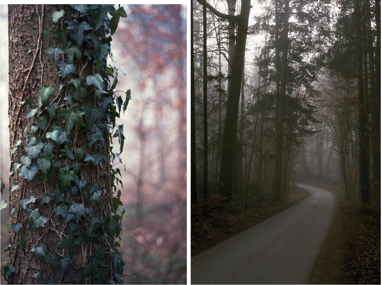
© 2022 Flora Mary Bartlett. All rights reserved.

Jared had spent the last few years visiting field sites in South America where collectors come to admire, or often poach, rare cacti and succulents. Plant-spotting trains the attention, urging you to look down and focus on details that are otherwise lost in a blur of brown and sage green. We had no idea what most of the plants were called, but we stopped to look closer, without any desire to disturb their roots and yank them from the ground.