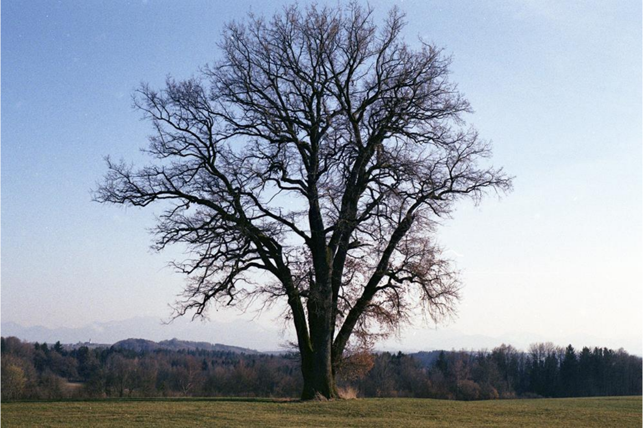
© 2022 Flora Mary Bartlett. All rights reserved.

game. I came here to write about what life will look like after oil, and this elevated, distanced perspective allowed me to toggle through post-fossil-fuel scenarios as a kind of play. What would the land look like if oil was drained from the farm machinery, if the roads were erased, or made safe enough for us to cycle from the local station on our busted bikes, rather than relying on lifts in our rag-tag collection of borrowed and busted cars? Society-building games, like SimCity, weren't designed to address the climate crisis, but new additions to the genre focused on "reverse" building, degrowth, and rewilding might give players space to imagine different future scenarios for familiar terrain.