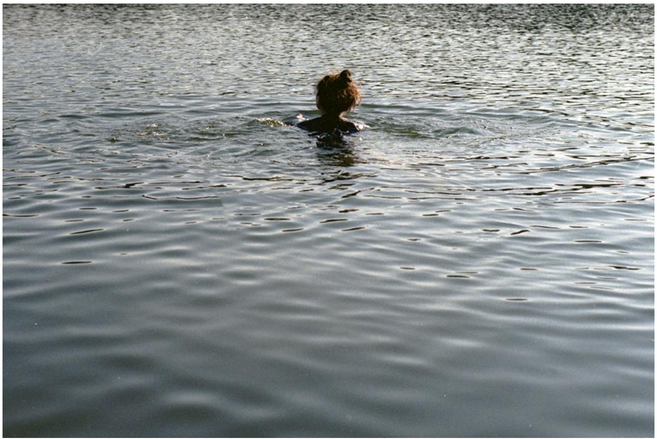
© 2022 Flora Mary Bartlett. All rights reserved.

The white-out of the horizon in our last weeks at the Landhaus is too easy a metaphor for an unknown future. But the staggering shift in temperature, the early melting snow, the sudden heat, and the return of the damp and cold that make it feel like autumn has arrived in March-these are the weird weather conditions farmers are working with now. It is a bleak and frightening time for growers, particularly those living in poverty and in flood- or drought-prone areas in the Global South. Though, in this context, the Landhaus Fellowship may seem like a small thing, it is immensely hopeful that it may feed into changes taking place on one German farm, and that by being there and bringing new ideas and perspectives, the spirit of the Rachel Carson Center and the environmental humanities has a role to play here, as well as in the many different places and communities our research takes us.