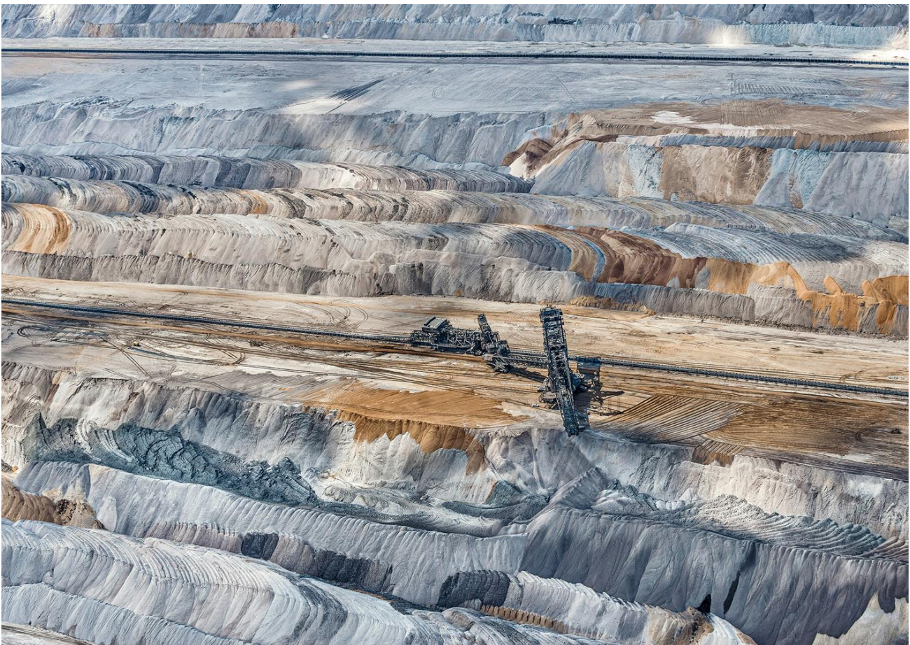
Open-pit coal mine, Hambach, Germany.