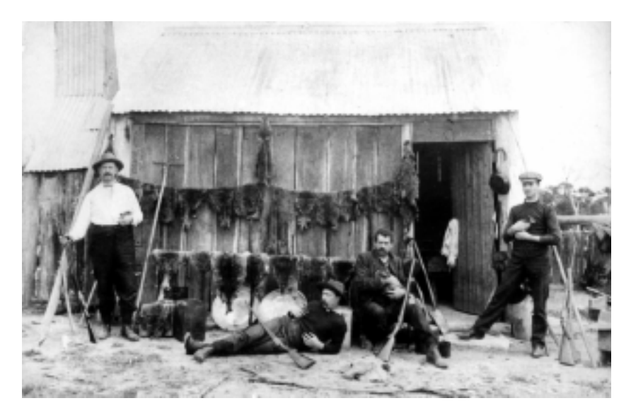
FIGURE 3. Pademelon pelts, Bullio, Mittagong, NSW, 1907.

which he was able to assist the Society to expose the clandestine export trade in marsupial skins) as well as a genuine interest in fauna preservation.<sup>67</sup>