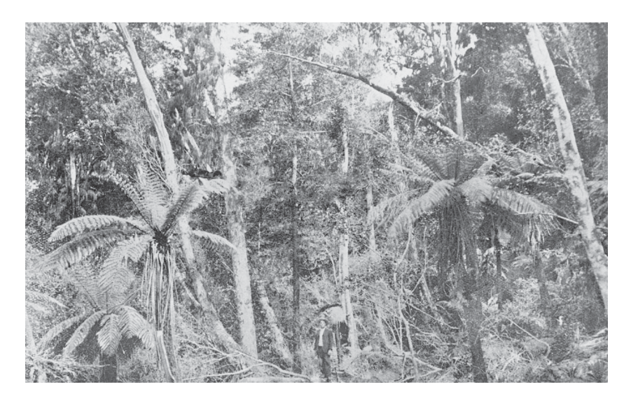
FIGURE 2. With time, some settlers descried 'more sacred treasures than its goldmines or its wool' in New Zealand's unmodified landscapes.

tion became part and parcel of New Zealanders' identity. There is a degree of speculation in these last remarks, which relate to changes beyond my prescribed period of research. But they do indicate the importance of analysis of attitudes a century or more ago to the understanding of present environmental attitudes in New Zealand.