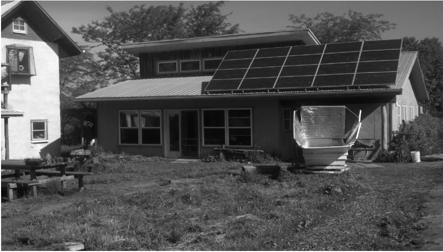
Figure 0.3. Dancing Rabbit Ecovillage (northeastern Missouri) community building.

tainability goals and projects, educational and outreach programs, and future aspirations that guide each ecovillage and their resident members. This information will be used in a longer-term project of developing and implementing a set of methods, tools, and indicators aimed at assessing and comparing each community's progress toward their goals of sustainable living and effective educational outreach. Neither community has been satisfied with existing sustainability measurement tools, such as ecological footprinting, which is geared toward individuals who live more mainstream modern lives. Dancing Rabbit has been measuring their fossil fuel and other energy use since the founding of the community, but otherwise lacks the ability to effectively communicate (outside of on-site living demonstrations) to the outside world how their lifestyle compares with mainstream Americans. Our project will help them better evaluate the effectiveness of their environmental lifestyles in comparative contexts.