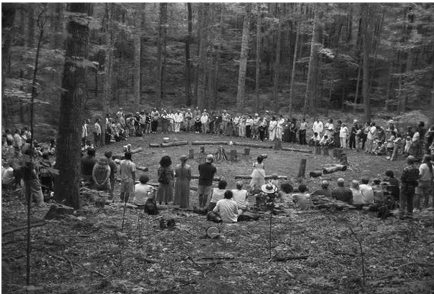
Figure 0.1. Ninth Continental Bioregional Congress, Earthaven Ecovillage, Katawbioregion, summer 2005.

Here is perhaps the most delicious turn that comes out of thinking about politics from the standpoint of place: anyone of any race, any religion, or origin is welcome, as long as they live well on the land ... [This] sort of future culture is available to whoever makes the choice, regardless of background. It need not require that a person drop his or her Buddhist, Jewish, Christian, animist, atheist, or Muslim beliefs but simply add to that faith or philosophy a sincere nod in the direction of the deep value of the natural world and the subjecthood of nonhuman beings. A culture of place will be created that will include the “United States,” and go beyond that to an affirmation of the continent itself, the land itself, Turtle Island. (Snyder 1995: 234)