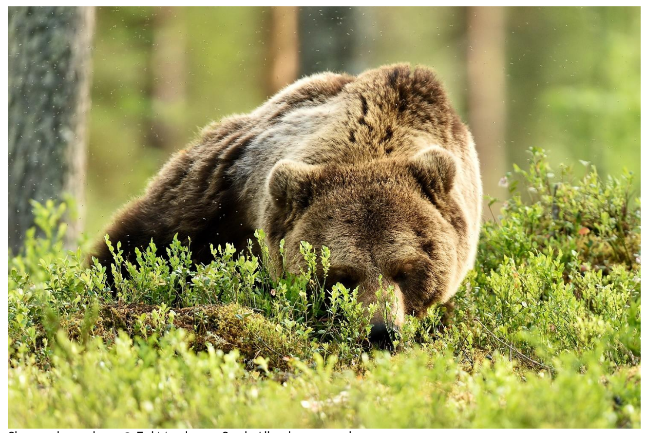
Sleeping brown bear.

I can't quite remember when I first pulled a camping mat and sleeping bag under my covered back deck and hunkered down for the night. That makeshift arrangement has evolved into a full-size bed, down duvets, and a secure sleeping space. But I do know why I sleep outside. I do it because I am nature: Because I am less than whole when separated from the wind, the rain, the scent of earth, the rising crescendo of geese calling as they migrate through the night. I sleep outside because I am less alive within the sterile confines of monochromatic walls and temperature-controlled interiors, no matter how much I admire and appreciate their aesthetic design and beauty. I sleep outside because I cannot stand to miss even a single morning of spring birdsong, the chill of winter on my nose, or the moment when dusk turns to night. I sleep outside because I like the shock of leaving my cozy bed to hurry to the bathroom across a frozen, moonlit night, and the joy of returning to the warmth of my outdoor nest.