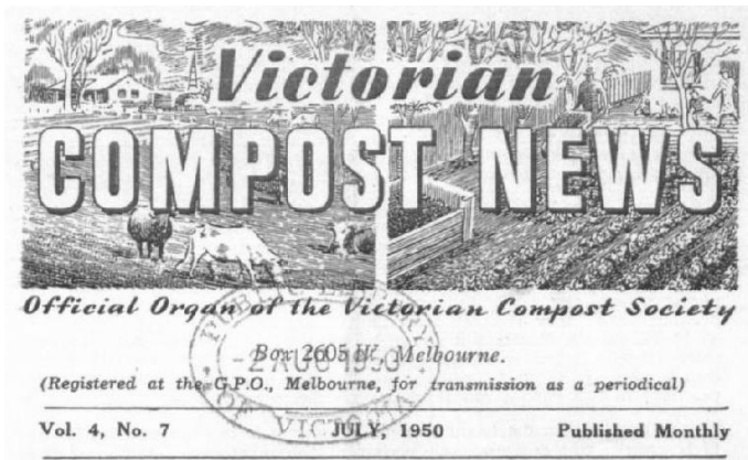
FIGURE 1. Masthead of the Victorian Compost News 1950.

The methods Australian organic farmers and gardeners initially adopted to foster humus rich, biologically active soil were the use of compost and manure, methods promoted by their British role models. As the name of the Victorian society suggests, the promotion of compost was the reason this group was founded and members of the Victorian society identified themselves, and other organic growers, as 'composters'. 6 The Australian societies published 'how to' composting pamphlets and presented lectures and demonstrations on compost making. Manure was praised both as an ingredient of compost and also for its ability to add organic matter to the soil. 7