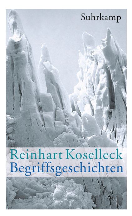
FIGURE 4. Cover of Reinhart Koselleck, Begriffsgeschichten: Studien zur Semantik und Pragmatik der politischen und sozialen Sprache (Frankfurt: Suhrkamp, 2006). Used with permission.

depth and layering had long appeared in Koselleck's work,<sup>54</sup> this 2000 volume brings these ideas to the foreground, and even onto the book's cover, at the same time that it makes explicit the metaphor's geological origins. It is less clear how the towering alpine ice shapes depicted in Edmaier's photo of the Perito Moreno Glacier in the Argentine Patagonia relate to the contents of Begriffsgeschichten (2006) (Figure 4). Rather than illustrating the book's title, this image might suggest an interpretation: concepts and their histories are not fleeting, "pointillistic" moments, as speech act theory (adapted to historiography by Quentin Skinner and others) would have it,<sup>55</sup> but are instead stable, lasting structures that tower above the people who use and pass through them.