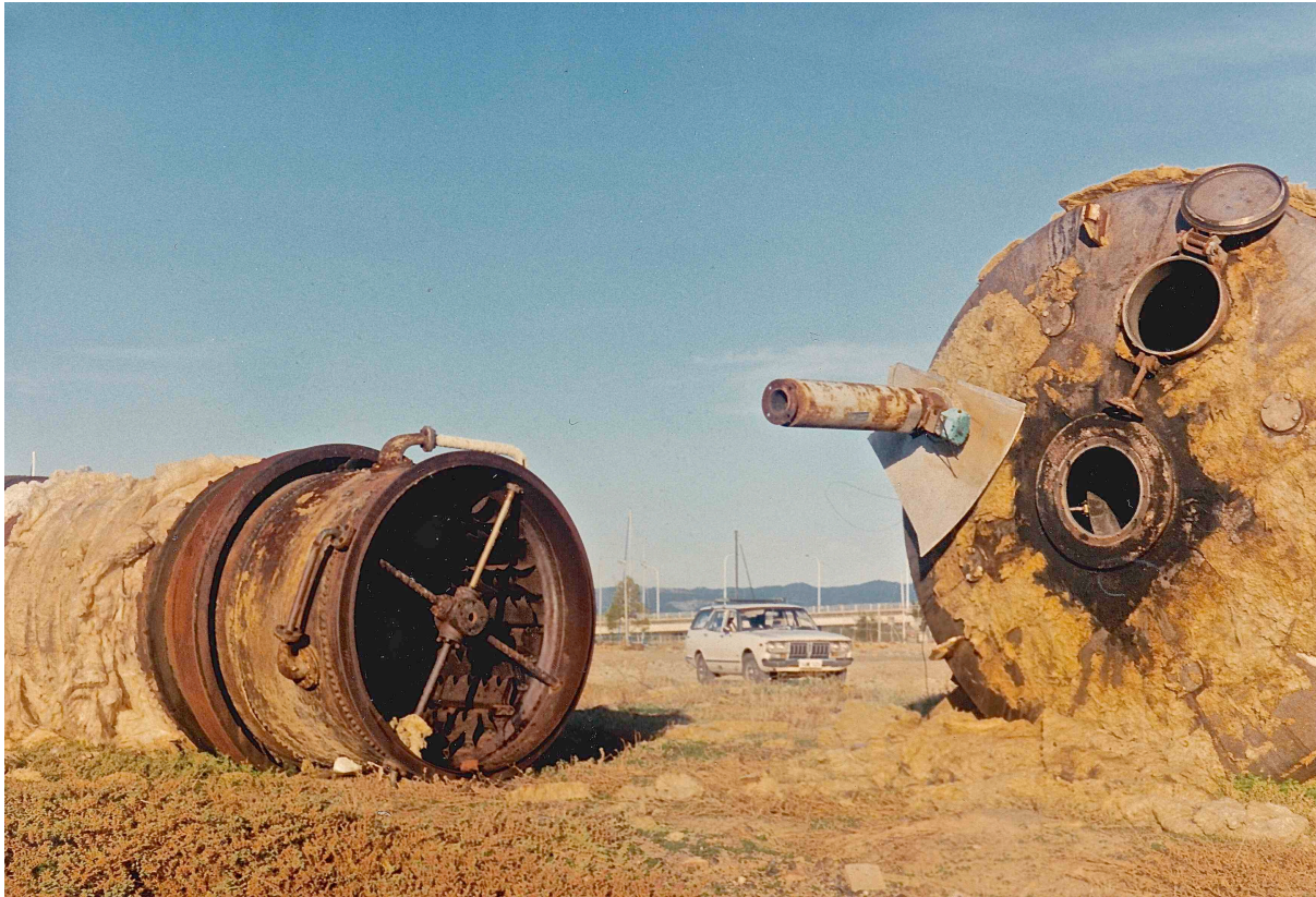
Figure 3 Rusty hoppers left on Lartelare's site after the demolition of the CSR Refinery. Schultz made recordings in and around the hoppers. CD booklet image, courtesy Chester Schultz.

The following track, "Ground Water, Sea Water," depicts the swirling fluvial debris of a century of construction and deconstruction. One is riveted to sit still and listen.