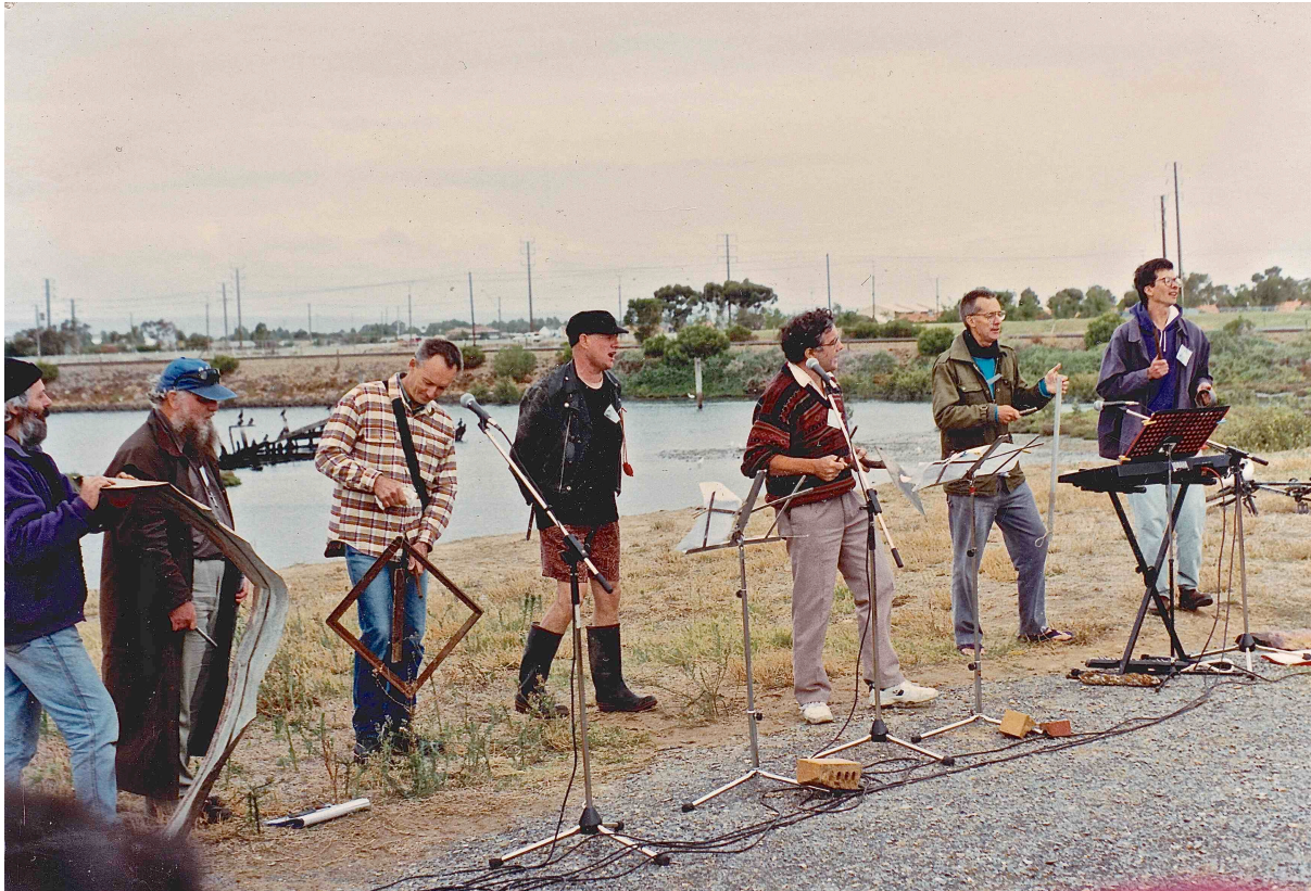
Figure 6 The Junk Naturals perform “Junk: A Natural Part of Life” at Ethelton, 13 April 1996.