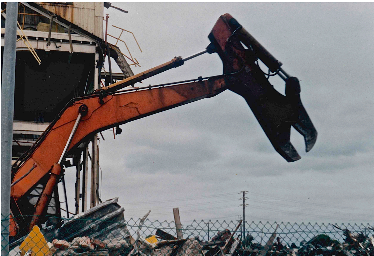
Figure 2 One of the huge machines of demolition at the CSR Sugar Refinery at Glanville, January 1993. CD booklet image, courtesy Chester Schultz.

"Islands of Quietness," to revisit my epigram—are "rarely included in the equations of urban developers." "The Beasts of Babylon" (Track 11) references the "ruined City," a spiritual metaphor from The Revelation of John: "Babylon the Great is fallen." 76 This recurring motif in Schultz's work is generally inclusive of people who live on a city's margins. However Within Our Reach extends the metaphor to the natural environment on the margins including the arboreal habitats of sparrows and pigeons destroyed in the ensuing acoustic disaster. Schultz was quick to photograph and record the overbearingly loud, clanking cranes and other hard-shelled industrial machines (Figures 2 and 3) that demolished the Sugar Refinery in January 1993, following on from its closure in 1991. Track 11 graphically depicts one "beaked monster" grabbing huge scraps of metal while a sewage pipe pisses 37 million litres of effluent (daily) into the river at the Causeway where the Reach was "beheaded."