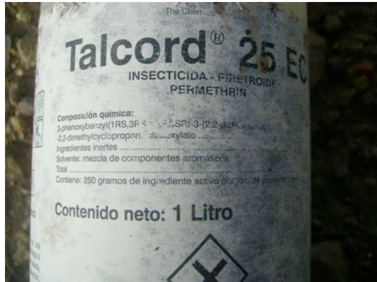
Figure 12