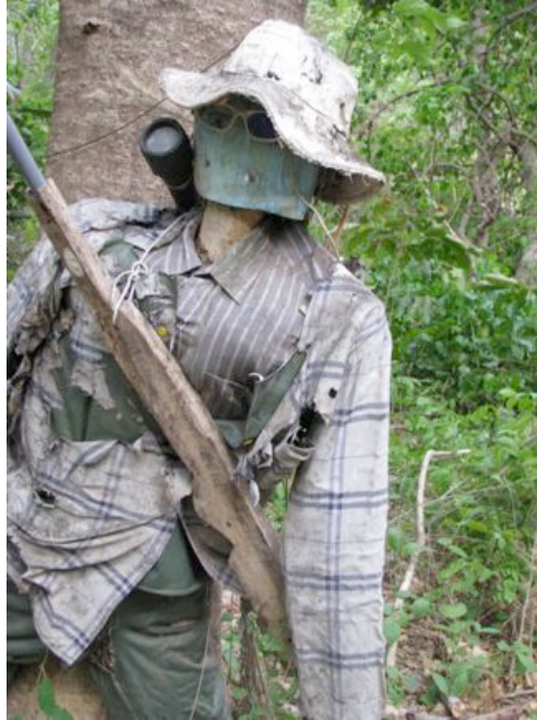
Figure10 Duck hunting, the world making game of powerful foreigners, is illegal in Costa Rica. Some farmers of Bagatzí have become poachers, intruding onto the government nature preserve in Palo Verde managed by conservation biologists. This mannequin with a wooden ‘gun’ was installed by park guards on one of the dirt roads crisscrossing the national park. Guards made mimetic copies of themselves, aiming to startle intruders with uncanny specters