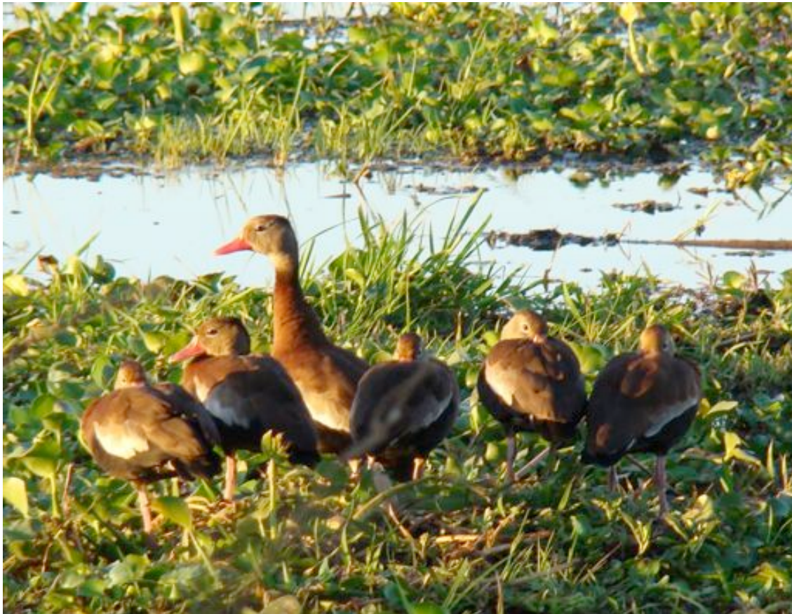
Figure 9 Black Bellied Whistling Ducks, or Piches , resting on a floating island of water hyacinth in Palo Verde National Park.

Costa Rican slang. A playful interaction with a Costa Rican biologist helped me understand subtle linguistic associations with this word. One day, as I was finishing lunch in the dining hall of Palo Verde Biological Station alongside other researchers and dozens of undergraduate students, she called out: “ Como se llama las hembras de los Piches? ” [What do you call the female Piches?] As I stood there looking dumbfounded, she continued: “ Como se llama las hembras de los gatos [cats]?” “ Gatas ” “ Como se llama las hembras de los perros [dogs]?” “ Perras. ” “ Entonces, como se llama las hembras de los Piches? ” Pichas! [Costa Rican slang for “Penises!”] The room exploded into laughter as I trundled into the wetlands in a pair of rubber boots while hefting a borrowed pair of binoculars to watch ducks.