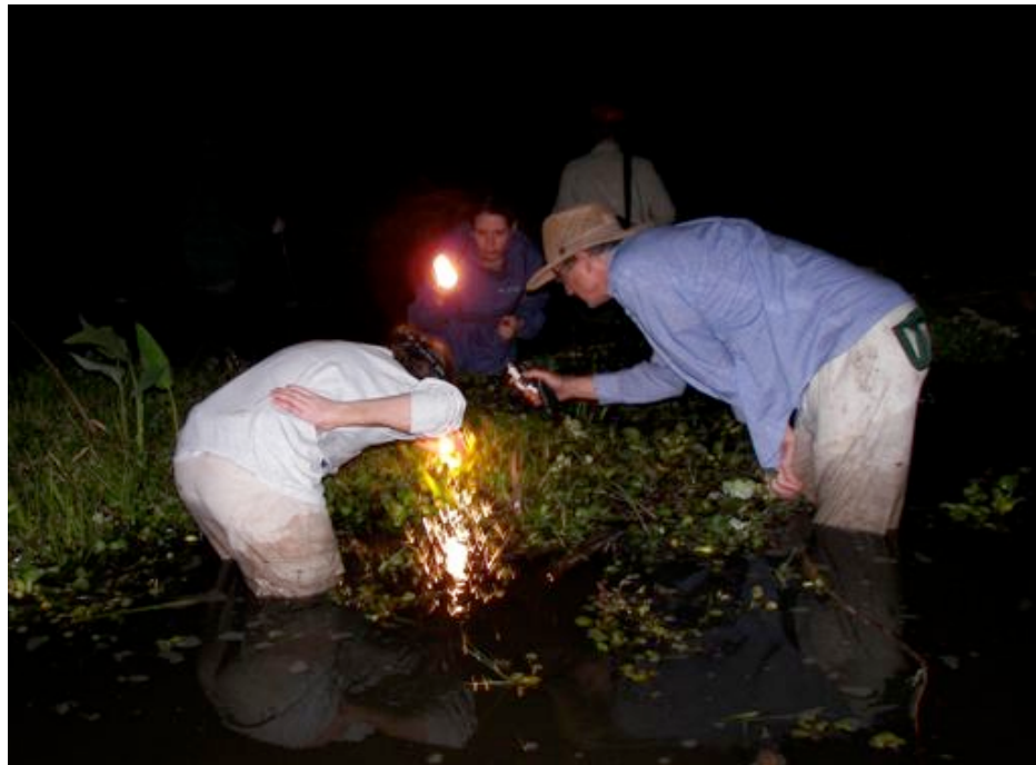
Figure 2 Test trials with foam frogs in the wetlands of Palo Verde National Park

After recording the frog calls with their shotgun microphone, and manufacturing a CD with digitally-altered, low-pitched calls, the graduate students think through semiotic theories as they trudge around the swamp with their boom box. Will foam frogs bluff by lowering their voice in response to simulated frog intruders? Mud sucks at their rubber boots and sneakers. They wade in water that reaches up over their knees. Water scorpions sting them. Leeches struggle to find a gap in their clothes. A distant pair of large glowing orbs, ‘eye shine,’ reflects the light from the students’ headlamps and follows their movement around in the water. “ This is frog one-oh-one, ” he says into the mic. “ Frog one-oh-one. Recording frog one-oh-one. Day two of our test trials. ” She notes the temperature of the water and then plays a blast of digitally altered frog calls on the boom box. He stands still in the warm, dark, water with the shotgun mic pointed at frog 101.