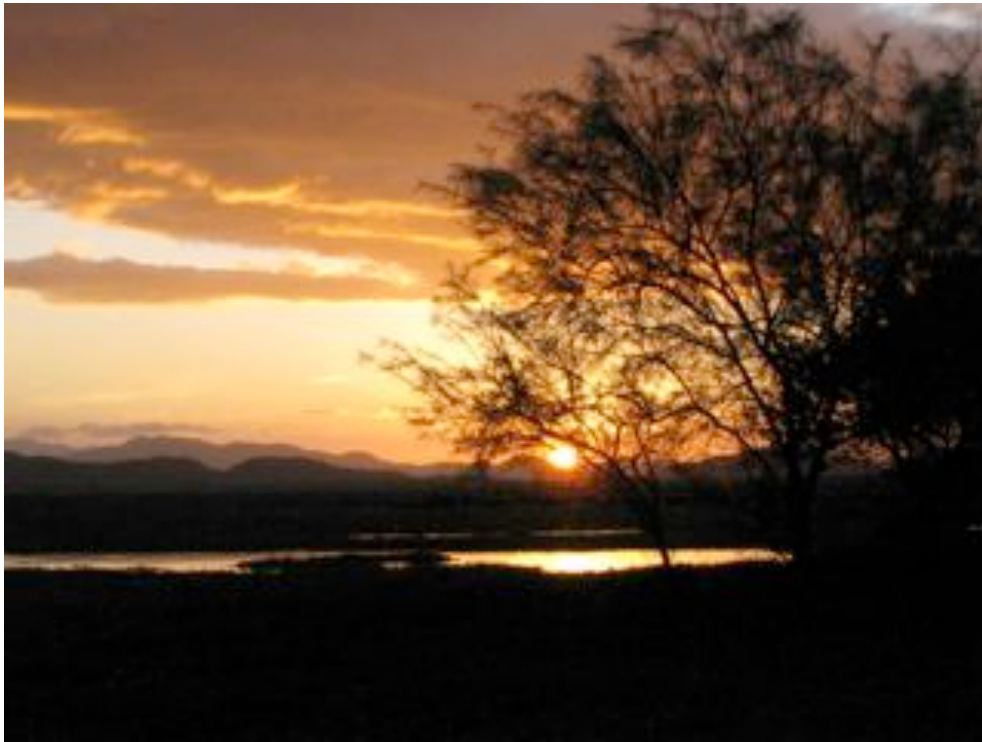
Figure 3 Palo Verde National Park pictured at sunset