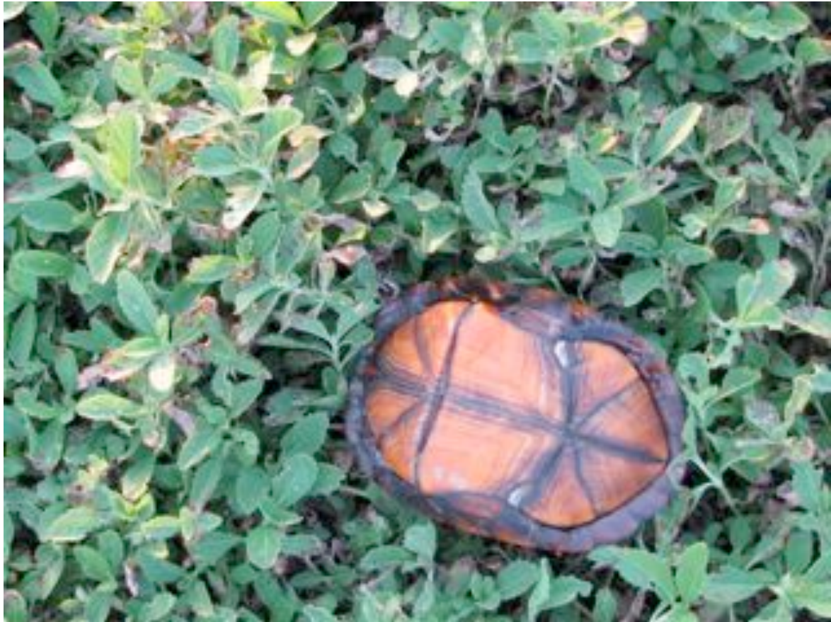
Figure 15 A turtle hiding in its shell near a fanguero tractor rolling through the wetlands of Palo Verde National Park

The speech prosthetics of these graduate students were fragile. They only sampled six sites in open water, and five sites in cattail stands. Senior scientists in residence at Palo Verde Biological Station never conducted a follow up study with larger sample sizes to track the populations of these organisms through time. Instead of trying to create a democratic assembly, a unified Parliament of Things where all creatures of the wetlands might one day be represented, the park officials were being moved by oblique powers. Amidst competing visions of conservation and agricultural production, shifts in these oblique powers were determining who lived and died. “The perspective of the Parliament of Things belongs to a utopia,” in the words of Isabelle Stengers. “It is nothing more than an empty dream if it does not function as a diagnostic vector for what makes it a mere utopia, as a learning ground for resisting what today opportunistically frames our world.” 86