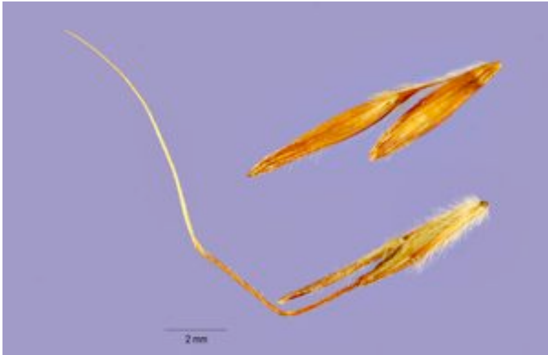
Figure 4 Seeds of Jaragua grass

humans helped Jaragua regenerate in their fields and facilitated its spread, like a rhizome, into the surrounding forest.