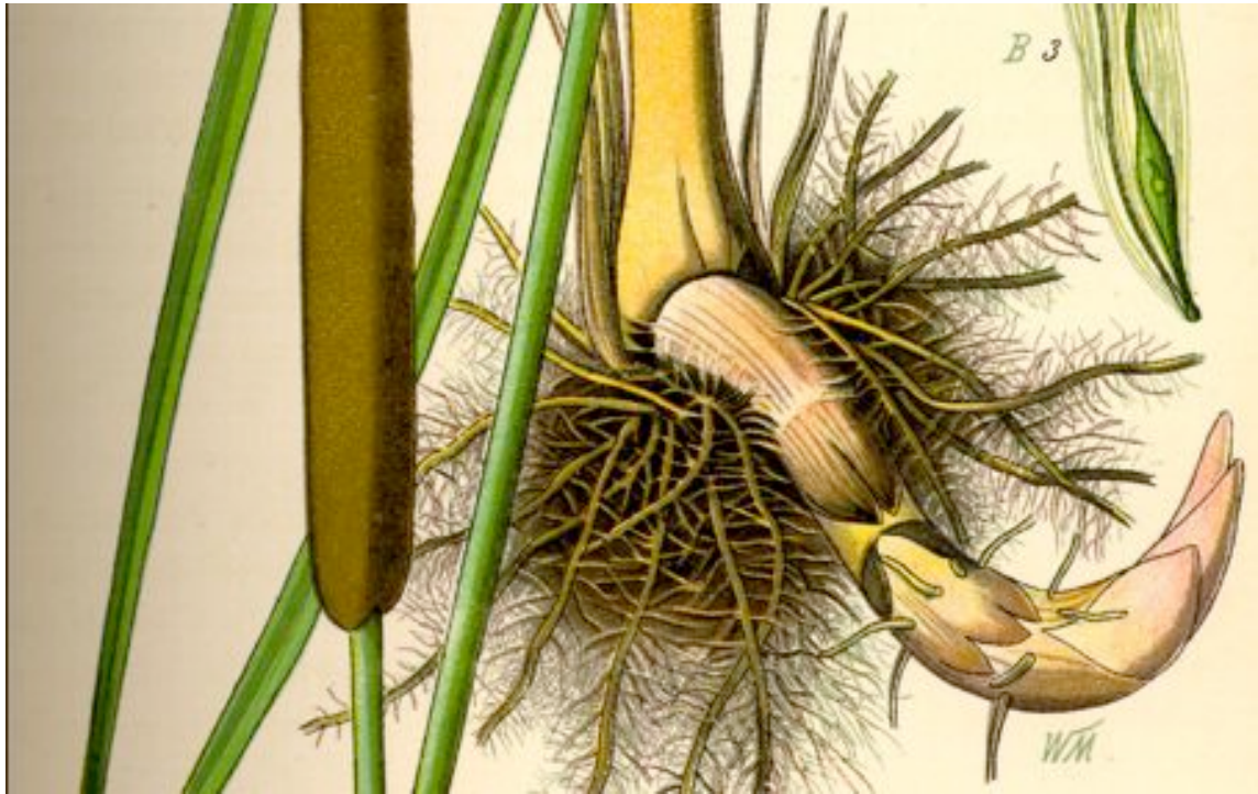
Figure 5 The rhizome of the cattail 51

preferred to graze in dry grasslands where the conservationists were trying to regrow a forest. These cattle proved ineffective in killing the cattails. 50