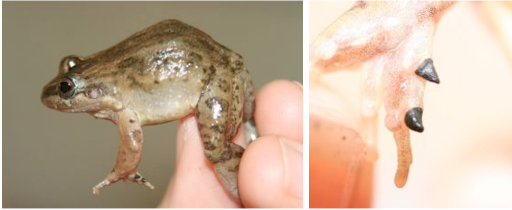
Figure 1 A fringe-toed foam frog ( Leptodactylus melanonotus ), with a close-up picture of the ‘fringes’ on its front foot

After recording the frog calls with their shotgun microphone, and manufacturing a CD with digitally-altered, low-pitched calls, the graduate students think through semiotic theories as they trudge around the swamp with their boom box. Will foam frogs bluff by lowering their voice in response to simulated frog intruders? Mud sucks at their rubber boots and sneakers. They wade in water that reaches up over their knees. Water scorpions sting them. Leeches struggle to find a gap in their clothes. A distant pair of large glowing orbs, ‘eye shine,’ reflects the light from the students’ headlamps and follows their movement around in the water. “ This is frog one-oh-one, ” he says into the mic. “ Frog one-oh-one. Recording frog one-oh-one. Day two of our test trials. ” She notes the temperature of the water and then plays a blast of digitally altered frog calls on the boom box. He stands still in the warm, dark, water with the shotgun mic pointed at frog 101.