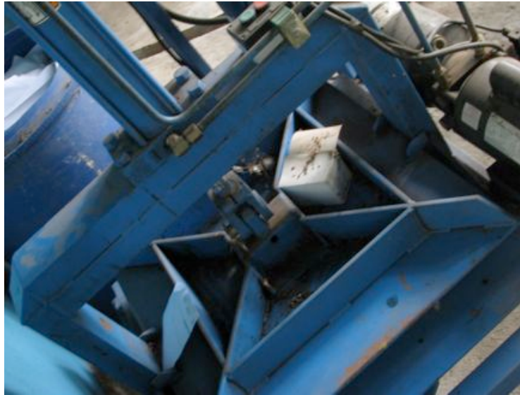
Figure 8 A machine in Tifa Tours that broke down while printing diplomas for University of Costa Rica graduates. The cooperative became inactive after the machines stopped functioning. Spectral promises made to the women of Bagatzí—fictions and fabulations about modernity—evaporated as the fickle spirit of capital danced away

Cattails proved resistant to capture by capitalism and remained as persistent parasites—interrupting human dreams. This rhizomorphic plant broke the motorised machines of this modest paper-making project just as the operation was starting to get off the ground. 69 Visions of turning Bagatzí into a picturesque ecotourist destination, by establishing bunk beds for visitors who might want to tour marshes full of Typha dominguensis , also failed. I lived alone in Tifa Tours surrounded by hulking machines that had been abandoned by the ghostly specter of capital. “Our equipment is worth a lot of money,” Ana Janzen told me, “but none of us have the technical skills to fix it. The machines are very heavy, and it would cost a lot to bring them somewhere for repairs.”