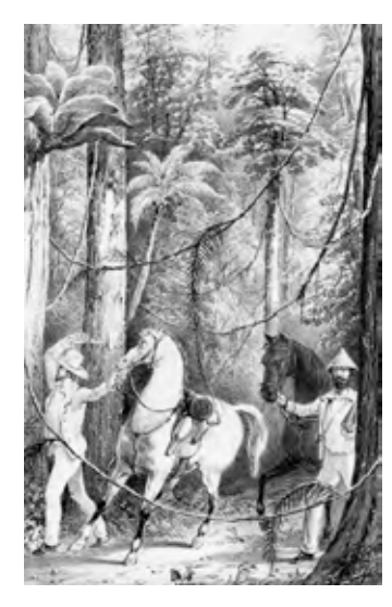
Exploring Australian rainforest, 1840s