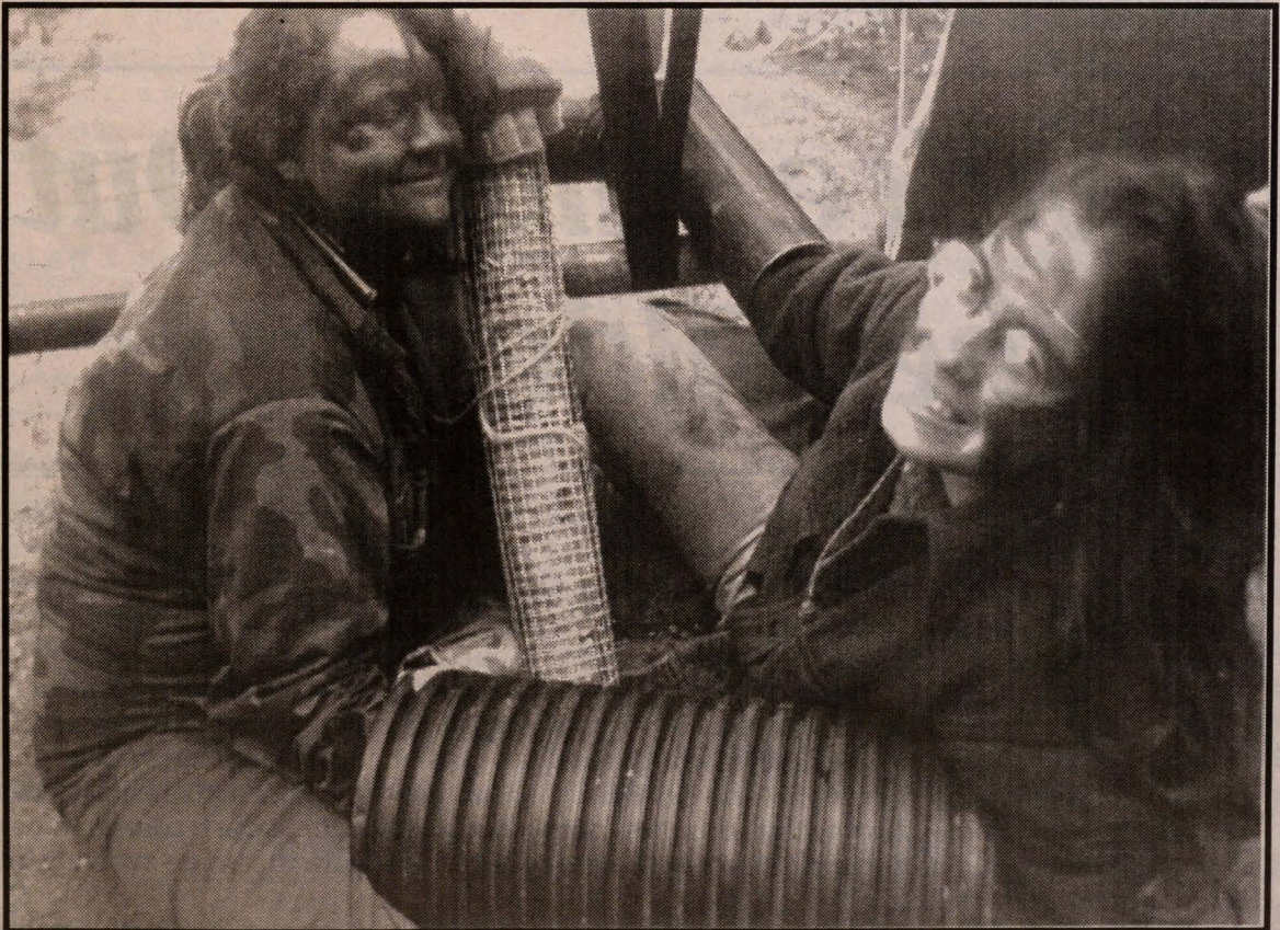
On the northern frontier of Headwaters Forest

local issues, lists of local events or demonstrations, more leeway to fit poetry in, etc. These can be statewide newsletters, bioregional (portions of more than one state), or specific to your community. They can be copied and stapled, and sent out without wasteful envelopes. Production, writing, and mailing should be done as a group, to get the maximum number of voices represented, and keep all the work from falling on just a few.