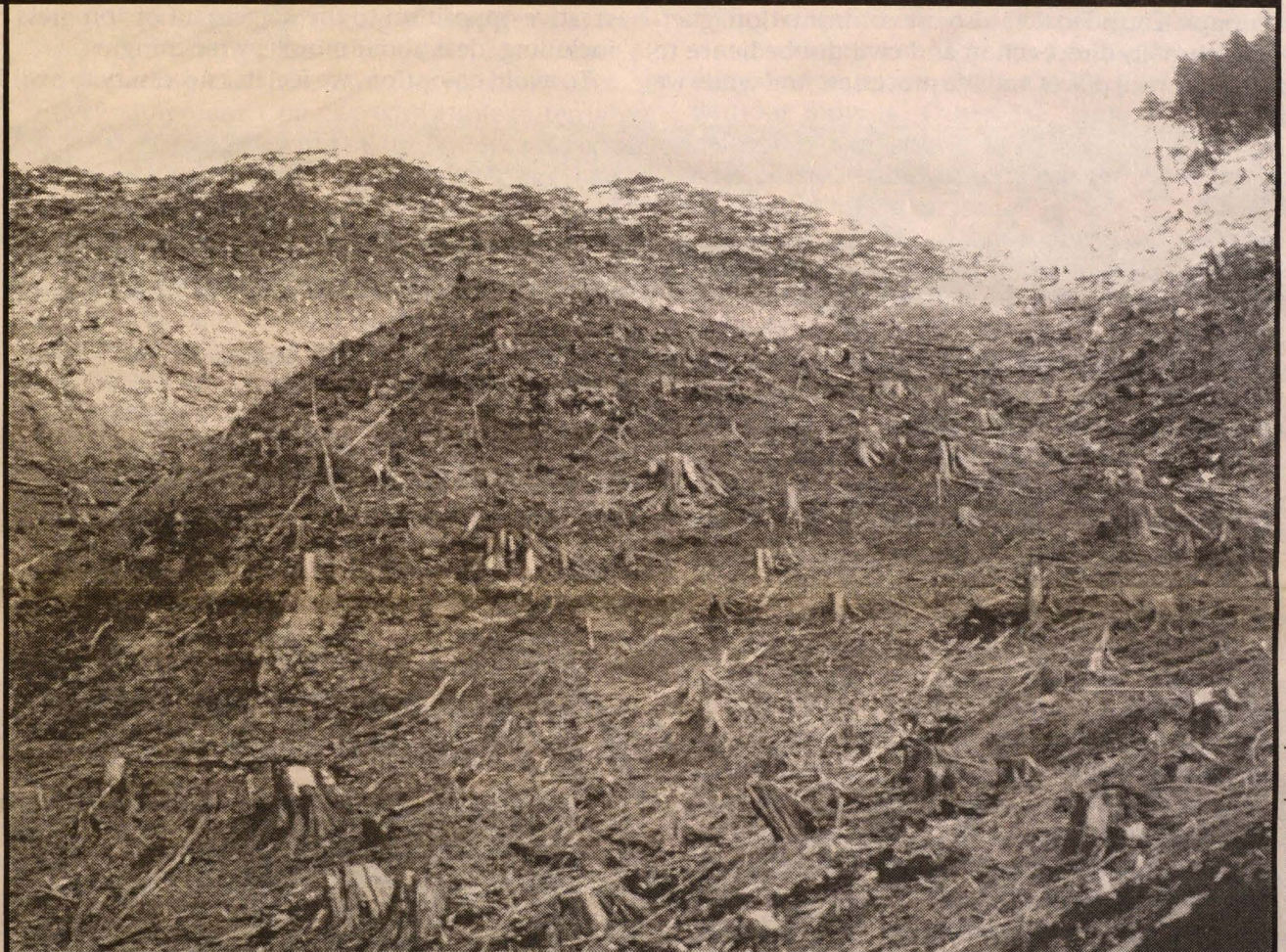
US Forest Service land management in the Olympic National Forest in Washington State

We—this generation of humans—are at our most important juncture since we came out of the trees six million years ago. It is our decision, ours today, whether Earth continues to be a marvelously living, diverse oasis in the blackness of space, or whether the charismatic megafauna of the future will consist of Norway rats and cockroaches.