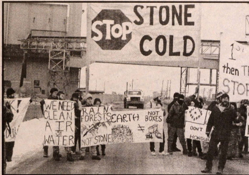
Demonstration against Stone Container, Missoula, MT, 1992

So make plans to attend the rendezvous every year!