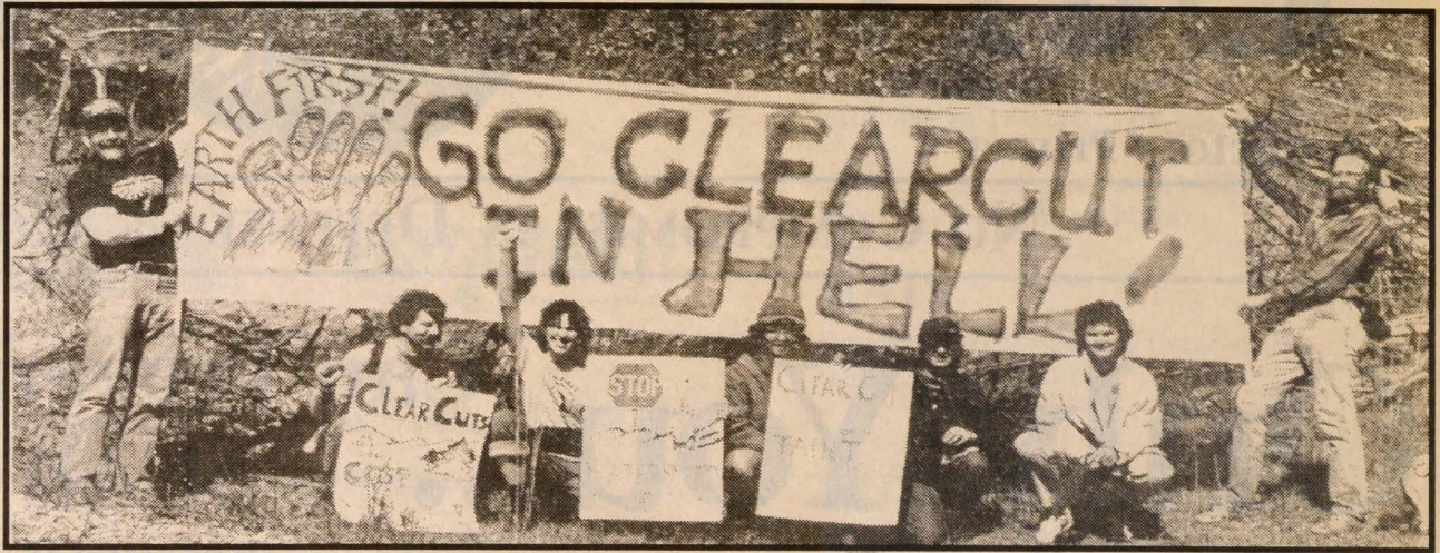
"Do not pass Go; do not collect $200." Activists speaking their mind in Asheville, NC.

Lobbying, lawsuits, letter writing and research papers are important and necessary. But they are not enough. Earth First!ers also use confrontation, guerilla theater, direct action and civil disobedience to fight for wild places and life processes. And while we