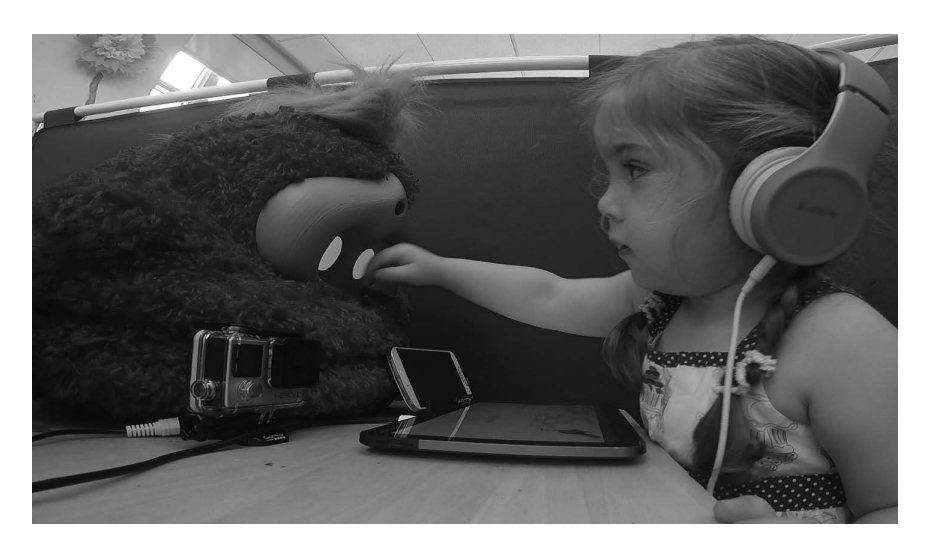
Figure 13.1b A girl reaches out to touch the Tega robot's face during interaction. Personal Robots Group.