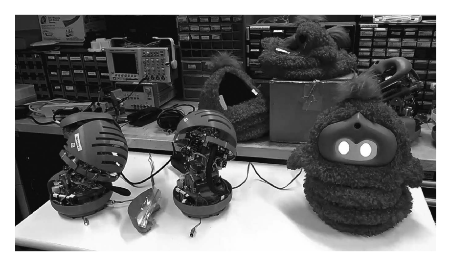
Figure 13.1c Tega robots, showing the electromechanical body on the left and covered in a fabric skin on the right. Personal Robots Group.