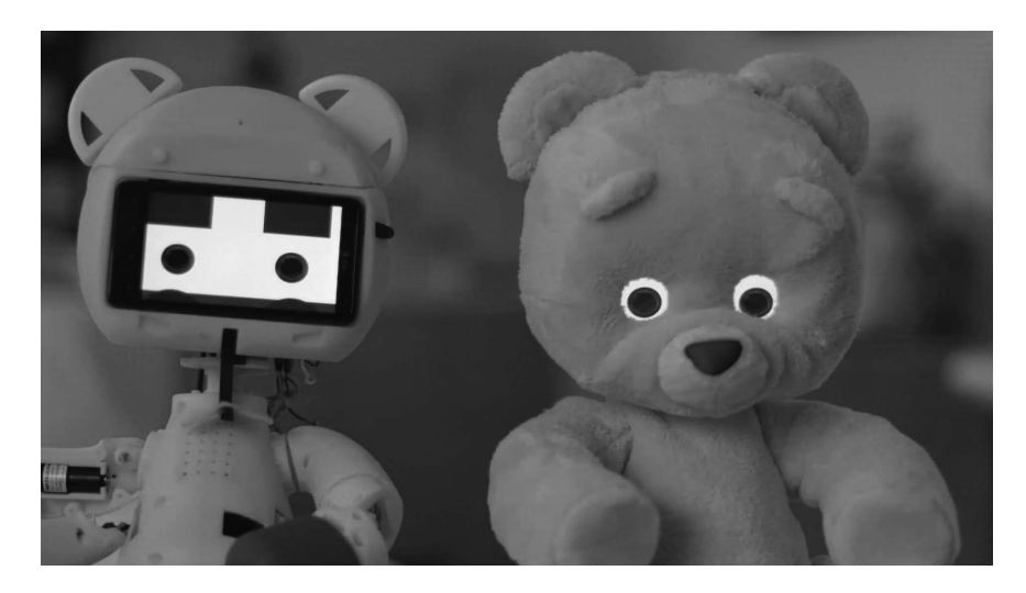
Figure 13.1a The Huggable robot, designed for interaction with children in medical settings, with and without its fabric skin. Personal Robots Group.