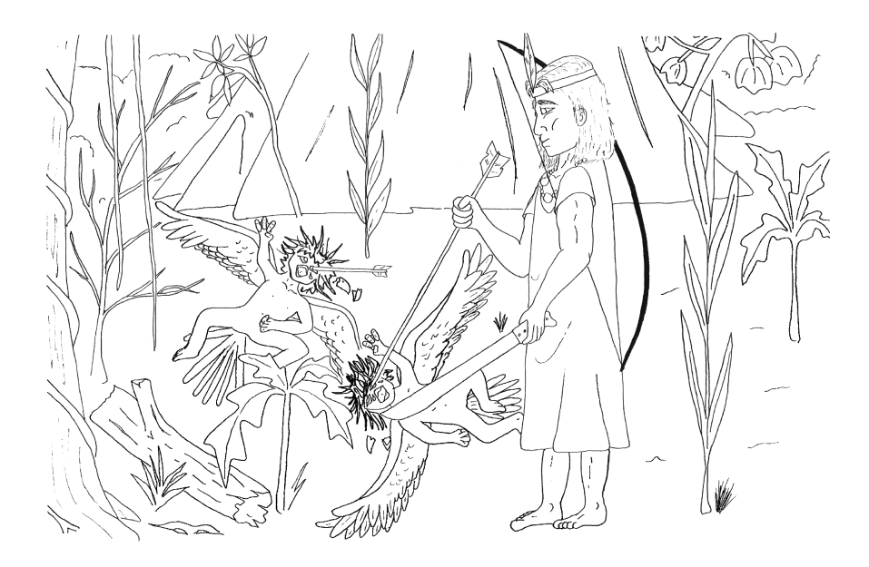
Figure 12.1 Times of human-animal undifferentiation: Edósikiana kills two harpy eagles with arrows.