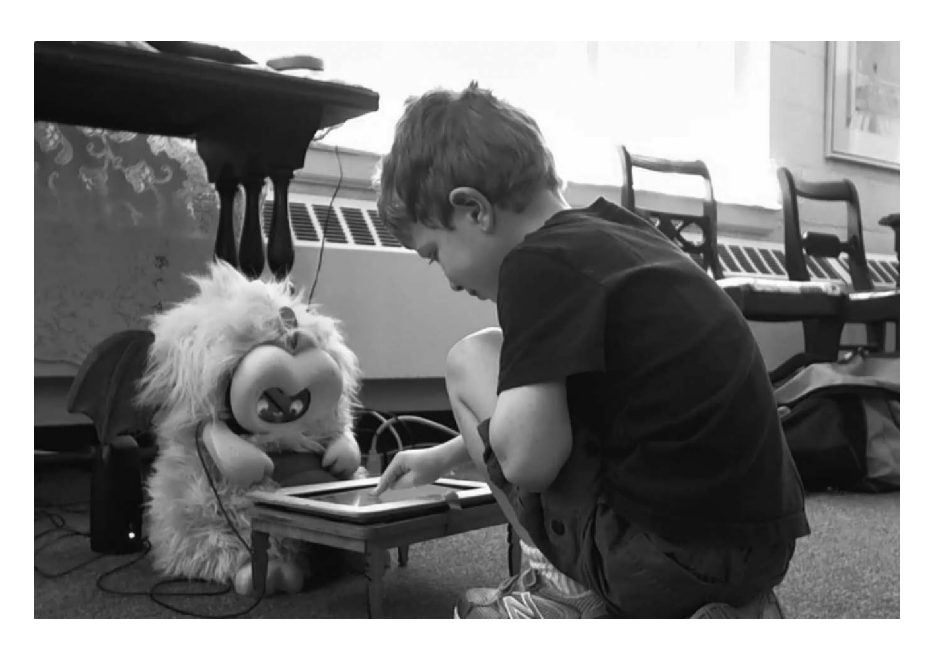
Figure 13.1d A boy plays a storytelling game with the Dragonbot robot on a shared game table surface. Personal Robots Group.