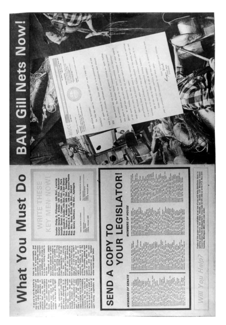
FIGURE 4. Working closely with state government, sport fishing groups aggressively campaigned to prohibit the coregonid fisheries from using certain types of harvesting gear.