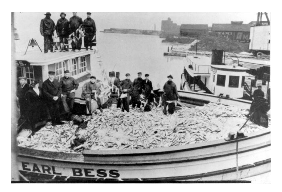
FIGURE 2. The Great Lakes fish tug Earl Bess with a large haul of lake herring from Lake Erie in November 1918.

and 1920s. By the close of World War One, the problems of this managerial context led to stress on the chub population of Lake Michigan, and declines in the stocks of Lakes Huron and Ontario.<sup>43</sup>