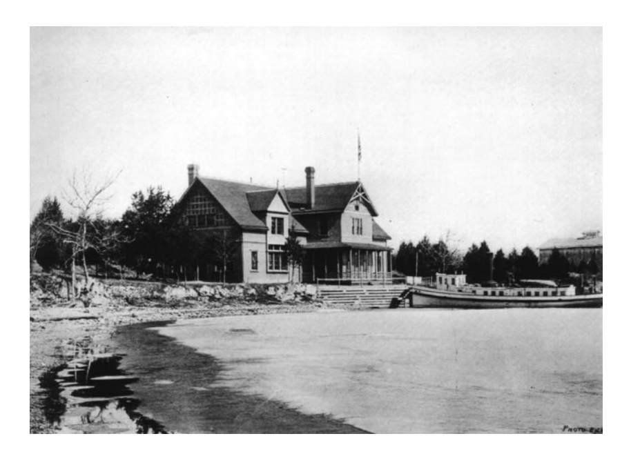
FIGURE 1. The US Fish Commission's Put-in-Bay, Ohio fish hatchery on Lake Erie, c. 1896. Although the commercial fishing community questioned the effectiveness of Putin-Bay's whitefish propagation programme, it characterised the facility in The Fishing Gazette (January 25, 1894, vol. xi, no. 4) as 'the largest and best equipped fish hatchery in the world'. Such hyperbole, along with the size and architectural adornment of this facility, was emblematic of the optimism that accompanied early artificial propagation programmes.

Commission assumed the use of the State of Ohio's hatchery at Sandusky on western Lake Erie in 1888 and substantially enlarged its whitefish propagation activities in this region when it commenced hatchery operations at Put-in-Bay, Ohio in the early 1890s (Figure 1). The period of whitefish hatchery expansion concluded in 1896 with the construction of whitefish hatchery facilities at Cape Vincent, New York (at the eastern end of Lake Ontario) in 1896.<sup>15</sup>