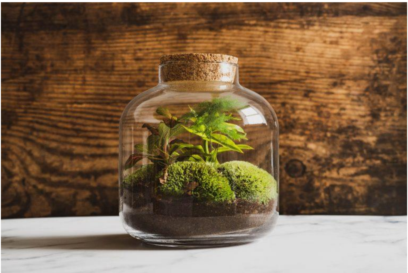
The image has been cropped.