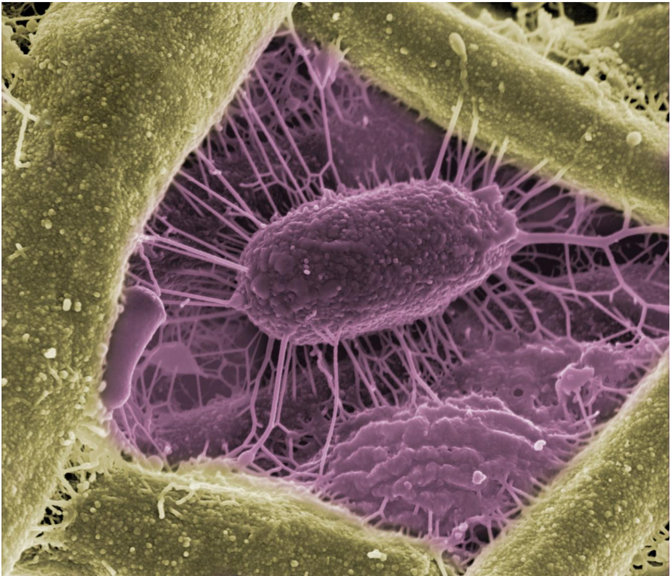
(Left) A microbe among Arabidopsis plant roots. Courtesy of Pacific Northwest National Laboratory . CC BY-NC-SA 2.0 . The image has been cropped. (Right) The exterior of Biosphere-2. Photo by CGP Grey . CC BY 2.0 .

Women, slaves, and the colonized subsequently fell into the same vegetal or animal taxonomies, categorized as dull and without feeling. Anthropologist Eduardo Viveiros de Castro describes this trend as the colonization of anthropocentric reasoning. 18 In time, European scientists looked to the plant world for inspiration and metaphors. They created a “tree of life,” a systematic way to exclude more humans and species as castaways from the escalator of progress. As social scientists fixed their understanding of “nature” into metaphors for living in the world, ideologies emerged to match them. 19 Darwin’s proselytizers viewed species as being in competition with each other for scarce resources, a conceptual turn that influenced business and political leaders to see “survival of the fittest” as a motto for enterprise and diplomacy. 20