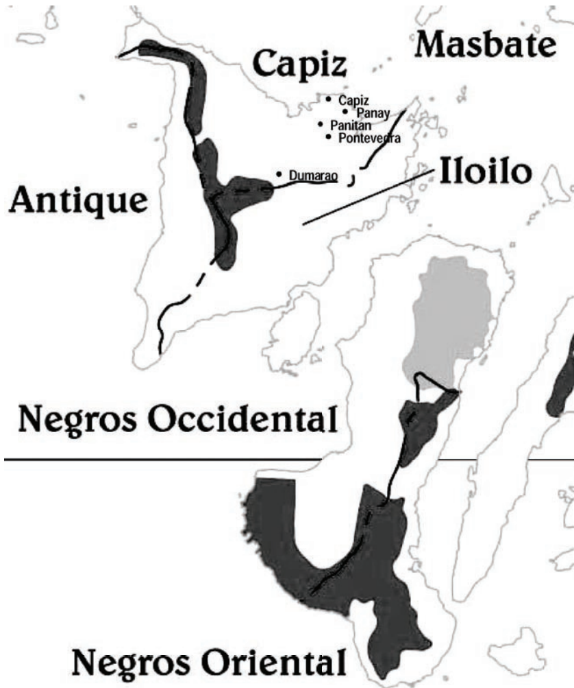
Map 2. Western Visayas showing the remaining forests (shaded areas), c.1900