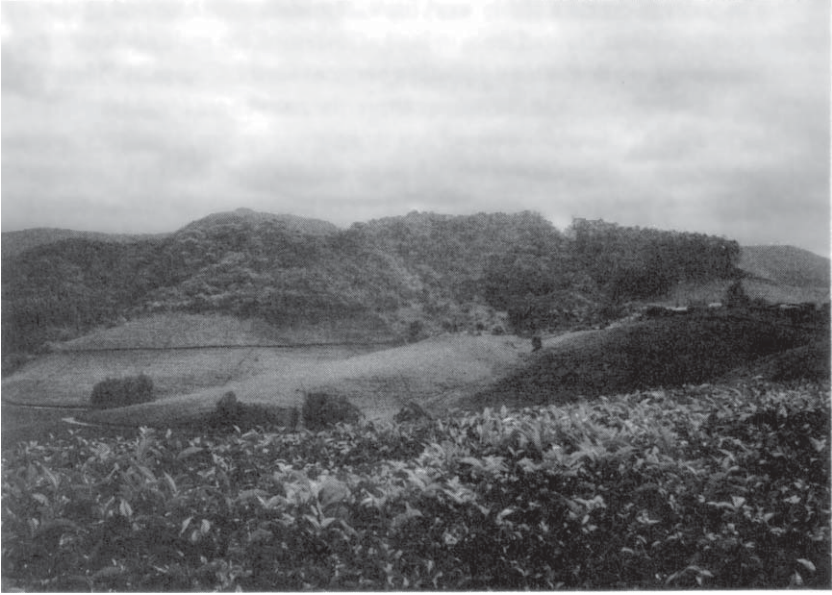
FIGURE 2. A tea plantation in the Honde Valley

approaching the Valley from the western direction, i.e., the Zimbabwean plateau and the Nyanga mountains. A sudden, at times vertical drop, of up to 1000 meters and dramatic climatic change when entering the Valley, as well as its location along the border with Mozambique, underline this notion.