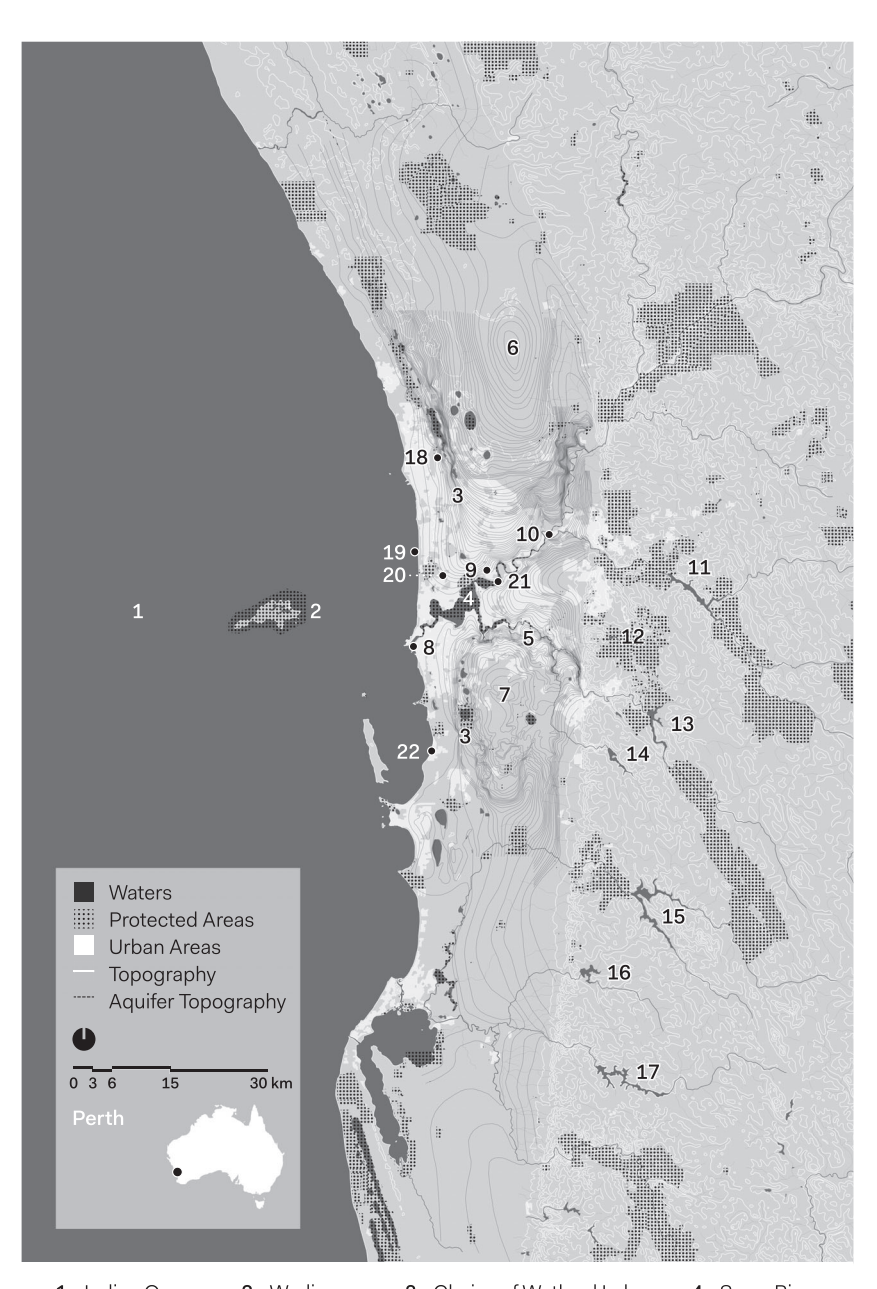
1 Indian Ocean 2 Wadjemup 3 Chains of Wetland Lakes 4 Swan River 5 Canning River 6 Gnangara Aquifer Mound 7 Jandakot Aquifer Mound 8 Fremantle 9 City of Perth 10 Guildford 11 Mundaring Weir 12 Victoria Reservoir 13 Canning Dam 14 Wungong Reservoir 15 Serpentine Dam 16 North Dandalup Dam 17 South Dandalup Dam 18 Groundwater Replenishment 19 City Beach Sewerage Outfall 20 Shenton Park Treatment Works 21 Old Burswood Sewerage Filter Beds 22 Kwinana Desalination Plant