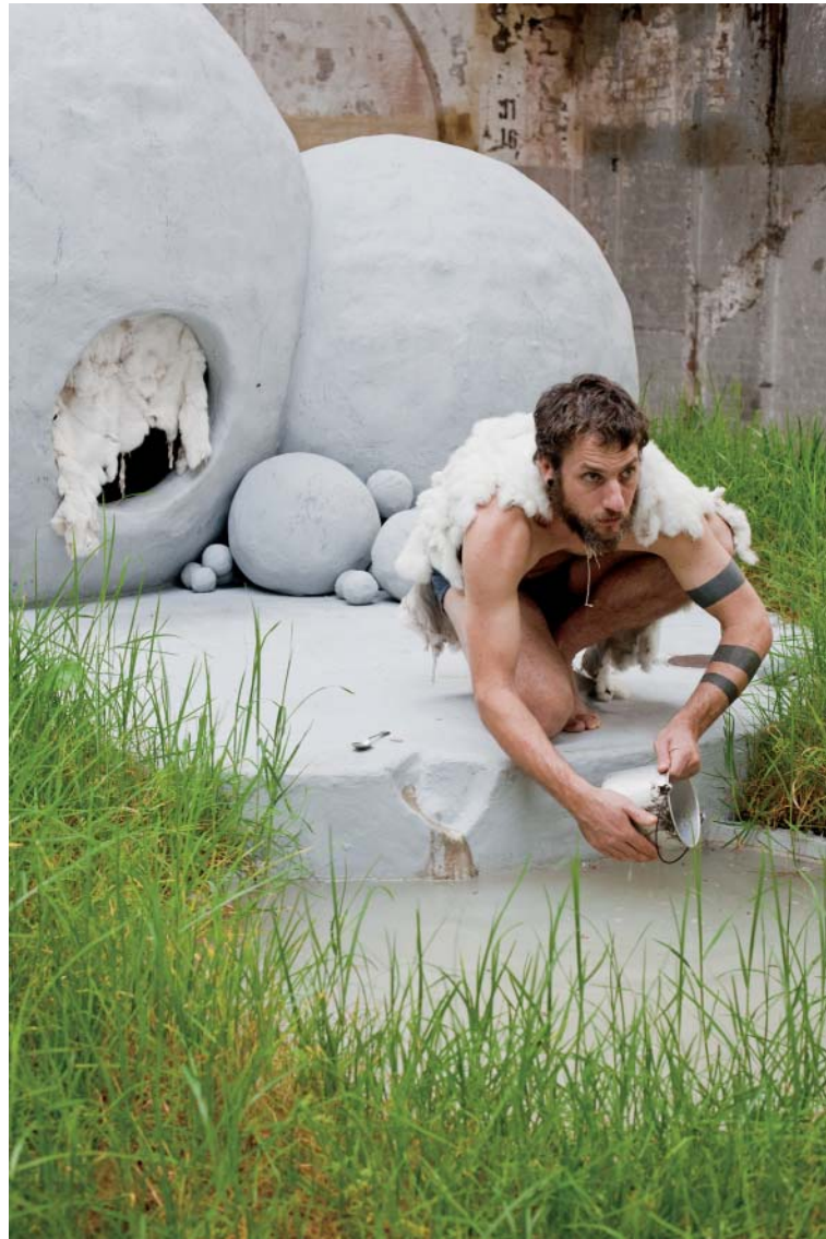
Figure 7. Hayden Fowler, Anthropocene (2011). Mixed-media installation, 5 × 6.5 × 6.5 m. Exhibited at “Awfully Wonderful: Science Fiction in Contemporary Art,” curated by Lizzie Muller and Bec Dean, Performance Space at Carriageworks, Sydney, Australia, April 15 – May 14, 2011.

species extinctions. It is not clear if at one time this environment was part of a city, a new urban habitat, or something else not made by humans at all. Despite its depleted state, this corner of a future world is currently living. It is neither romantic nor nostalgic, but it is breathing, alive. It is disturbed and remade by the lost bodies of a new kind of cohabitation. Fowler and his island rats are survivors, but without bees to pollinate the grass and rain to fill the pond, their small green eco-sanctuary may soon fester. Already some children have thrown sticks at the island inhabitants. Fowler shows that animals can indeed adapt to new machinic environments, but that the environments themselves also need to adapt. 53 Anthropocene is an ethical pointer toward a future