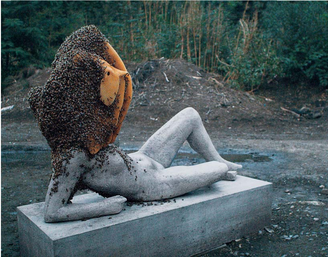
Figure 1. Pierre Huyghe, Untilled (2011–12). Living entities and inanimate things, made and not made. Courtesy the artist; Marian Goodman Gallery; Esther Schipper, Berlin.

In the original installation at Kassel, Untilled ( Liegender Frauenakt ) was part of a series of interventions that occupied the compost area in the Karlsaue Park. There the bees performed pollination duties for an intoxicating garden of deadly and psychotropic plants planted and curated by Huyghe. In the Centre Pompidou the visible garden is absent; the bees forage for nectar and pollen by traveling down a small tube that connects the aesthetic space with the raw streets of Paris outside. In this sense, Untilled ( Liegender Frauenakt ) is both a sculpture and a social landscape. The multispecies and sympathetic structure of the sculpture becomes a site for an ever-increasing cycle of living interactions. It travels across time and space. Eventually, the concrete will leach and break down, the speed of disintegration increased by processes of carbonation. Whether or not they are aware of it, the bees have been tasked with the role of artists. Their actions will determine the longevity of their adopted home. If they allow carbonation to occur, they risk their infrastructure dissolving; but if they coat the sculpture with wax, the entire environment could overheat. The primary manipulation of matter has shifted from the hands of Modigliani, to manufacturing by Weber, then Huyghe, and now a collective of bees. Together the bees and concrete are a vital sympathetic system, and as viewers