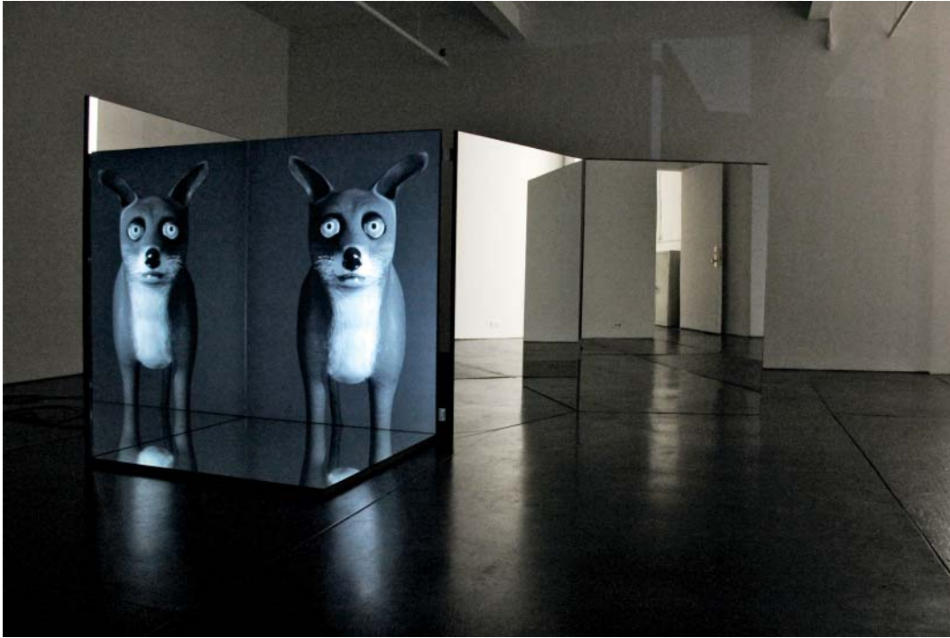
Figure 3. Ann Lislegaard, Time Machine (2011). Unfolded mirror box, HD video projection, 3-D animation with sound, 5:26 mins. Exhibited Nineteenth Biennale of Sydney (2014) at Carriageworks, Sydney. Reproduced courtesy the artist and Murray Guy Gallery, New York.

extinction. Time Machine is both an environment that houses a machinic animal body and a space that challenges the material constraints of time. The outer boundary of the work is a three-sided mirrored cubicle large enough to house a wild animal. Within its dark and unfolding space a glitchy, reflective, animated fox attempts to recount a recent journey to the future. If this were one fox telling one story then perhaps we could see it as mechanical: a trapped and anthropomorphized fox in imitation of a human. But the box, its reflections, and the continual stuttering unintelligibility of the improbable narrative point toward a different kind of body—one that questions how viewers and artworks are oriented in space and time.