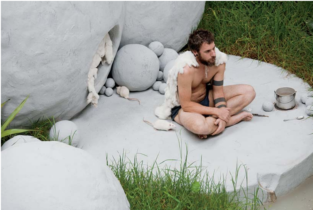
Figure 8. Hayden Fowler, Anthropocene (2011). Mixed-media installation, 5 × 6.5 × 6.5 m. Exhibited at “Awfully Wonderful: Science Fiction in Contemporary Art,” curated by Lizzie Muller and Bec Dean, Performance Space at Carriageworks, Sydney, Australia, April 15 – May 14, 2011.

culture where it is not enough to think of evolution and extinction in terms of relationships between animals and environments. 54