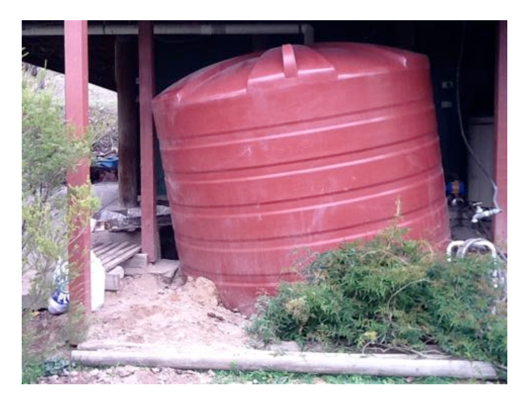
Figure 6. Wombat burrow under the water tank at Micalong Creek.

At first she was quite enchanted by the idea of cohabiting at such close quarters with a wombat, and she didn't really expect it to stay. That was over four years ago now. She's grown accustomed to its gruntings and scrapings and bumpings in the night, and assumedly the wombat's not too phased by living with her smells and noises either. It ignores her small dog's efforts to bail it up and watches as the dog retreats to the safety of the verandah. Wombats love to dig, always renovating and extending their subterranean homes. So the holes under her house just keep getting bigger and bigger. Last week she arrived to find the wombat had undermined her new water tank, upending it and pressing it hard against one of the structural posts. She had to completely empty it to prevent further damage. Precious water lost. This is what the farmers mean by "dangerous trouble makers." "I'd shoot it if it was under my house" her neighbour tells her. She ponders the space of shared contact of burrow, house, human and wombat. She could take action to evict it, but can't. Wombats have an inheritance too. This Ngunnawal country is also wombat country. It has been for millennia.