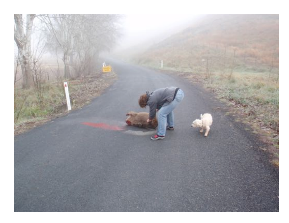
Figure 9. Dead wombat on the road to Wee Jasper.

Yet another grisly early morning discovery. It's a regular event. Because the blood's so red on the road, she wonders how long it's been since the wombat was run over. Her dog sniffs the body then backs off. It's very stiff. After dragging the dead wombat off the road, she girds herself and checks to see if there's a live joey. She can feel a lump. She's too squeamish to put her hand right inside the pouch, so she squeezes the joey to the entrance by pressing on the mother's abdomen. It's coming out. She can see and feel it now. It's hairless, still and cold. It must have frozen overnight. She returns to the car, feeling disappointed and relieved, shaky and sad. Her dog sniffs her hands.