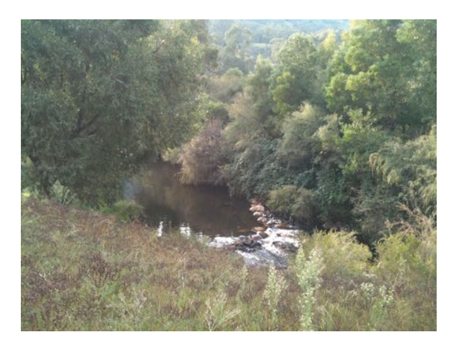
Figure 10. Watching Micalong Creek from the verandah.