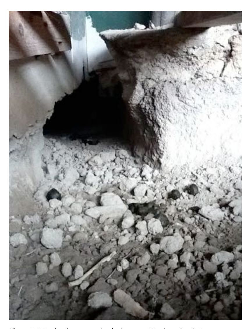
Figure 5. Wombat burrow under the house at Micalong Creek.

It was after an unusually wet spring that the wombat set up residence under her house. The ranger's theory was that its creek-side burrow was probably washed away in last year's record-breaking flood. The wombat has no truck with the violence of property, with its gridded landscape and no trespassing signs. It moves to a different pattern and finding nice dry soil under her house, starts to dig. Urged on by the traces of colonialism resonant in the earth, paws move faster, burrows expand and foundations quiver. She catches a slight movement in the soles of her feet and feels the precariousness of other creatures, like herself, whose belonging in this place is not assured.