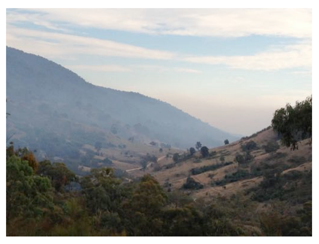
Figure 1. Wee Jasper Valley.

She drives down the valley past the paddocks and fences, sheep and cattle, past the 1080 poison signs warning of baiting for dingoes and wild dogs, and the kangaroo and wombat road kill. She is on her way to her home in the conservation reserve at the end of the valley. Her exhaust gases mix with a soft breeze carrying smells of gums and manure. At her place she lets the dogs out of the car and they rush off to harass the water dragons along the creek. As she enters her house she's greeted by the kookaburra and magpies who frequent her verandah. She