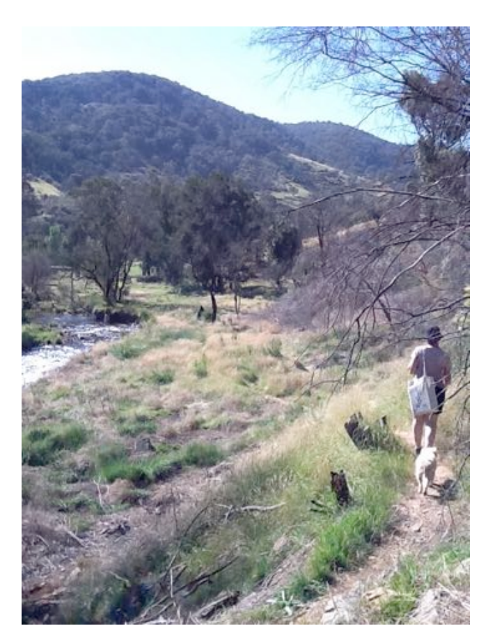
Figures 7 and 8. Walking the tracks beside Micalong Creek.