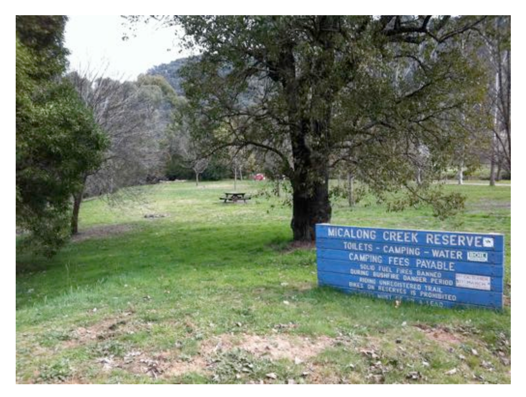
Figure 2. Micalong Creek Conservation Reserve.

unpacks the car, careful not to tread in the piles of wombat poo. A sparrow catches her eye and she wonders what to make of the mess of inheritance.