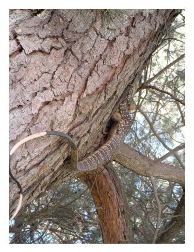
Figure 3. Goanna up the tree at Micalong Creek.

The summer is extremely hot—climate change is biting, people say. She refrains from swimming in the creek as the water snakes have given her a fright, and instead she follows her dogs and sits under the dense shade of a fir tree. There's a goanna half way up the tree, and king parrots take up the lower branches. All sit quietly enveloped by the heat. A sort of "we" opens up. 12 Will the Anthropocene draw us together or wrench us apart she wonders?