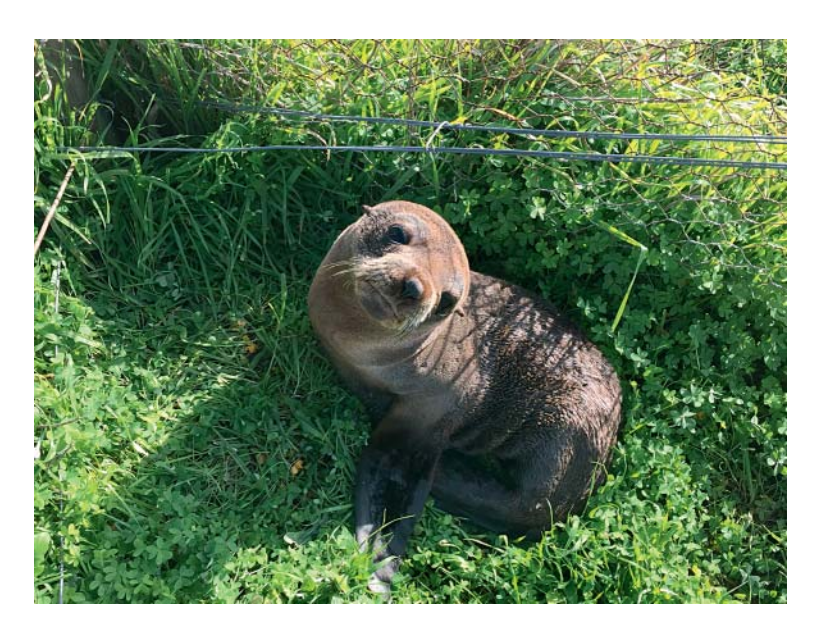
Figure 1. A young seal on an Australian cattle farm.

questions of belonging, but do they qualify as political? Do they merit ethical attention, and if so, what would be the basis and criteria of such an ethics?