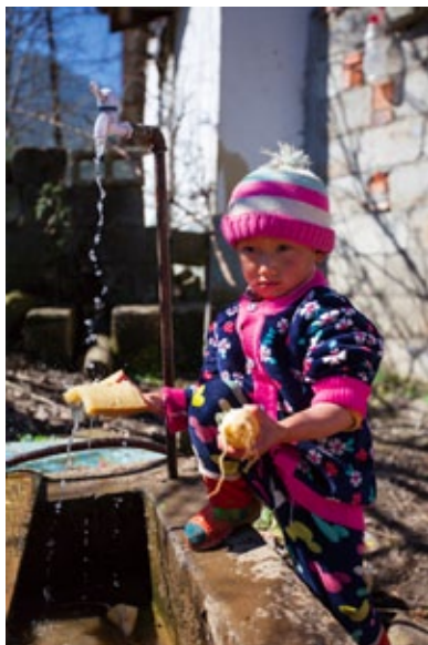
Figure 22: A small child helps her family clean and prepare food for the coming winter.