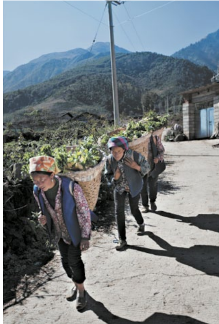
Figure 28: Women undertake much of the labor in most Yi villages in the Daliang Mountains.

Jenny Chio refers to “doing rural tourism” (农家乐) in China as “peasant family happiness.” 3 In accordance with this idea, locals seek to create the right conditions for a possible attractive tourist destination by maintaining or discovering aesthetically alluring settings and landscapes, and by renovating their buildings to look quaint and local. The most common types of businesses in rural tourism are family-run guesthouses and restaurants. Such enterprises can allow village residents the opportunity to pursue their own life goals and aspirations alongside the growing tourism economy.