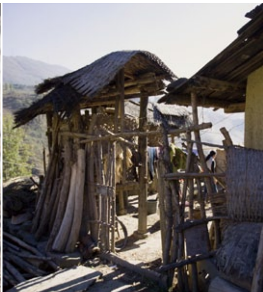
Figure 23: A home for the descendants of Yi slaves. Slave holding remained a part of Yi society until 1956.

In the new government-built Yi villages that we visited during the research trip, the transitions experienced by individual communities were quite varied and depended largely on the new villages' accessibility and their contact with the modern world. The most isolated villages, as well as particularly vulnerable groups within them, had the fewest opportunities to improve their livelihoods. Many were unaware of the government benefits to which they are entitled, which include state subsidies for the construction of new houses, as well as daily stipends for impoverished families to satisfy basic needs, such as clean water, food, transportation, and education.