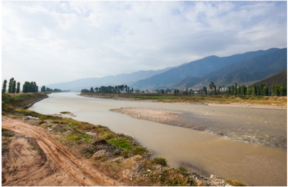
Figure 13: The Anning River with the Daliang Mountains stand- ing in the distance

Throughout much of its long history, Yi culture has more or less developed in isolation from the outside world, creating its unique characteristics and shaping the landscapes of the Daliang Mountains. As our research group studied the villages there, we realized that most people did not understand how predominant their culture has been in the region and many of them—especially those belonging to the younger generations—are looking to leave the old and “backward” villages behind to live in modern cities. They care little for their ethnic identity and instead want to become—or at least live—like the Han people, China’s ethnic majority. Many say they never want to return to their home village. This recent and rapid phenomenon and other changes brought on by rural development have made it increasingly difficult for the Yi to maintain their unique culture.