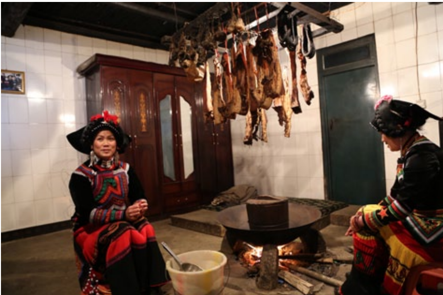
Figure 17: Women dressed in traditional Yi clothing prepare rice at the fireplace.