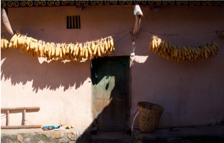
Figure 7: An old house in a traditional Yi village that has been newly decorated as part of the “new socialist countryside” project. Corn hangs outside its walls to dry.

In 2006, China’s eleventh Five-Year Plan, dubbed by party officials in Beijing as “building a new socialist countryside” (社会主义新农村), foregrounded the need for democratic administration, increased productivity, and more civilized villages, livelihoods, and social atmospheres in rural China. It also proposed extending agricultural chains, which would allow farmers to benefit from processing, preserving, storing, and transporting their own produce. This was followed by a new national “targeted poverty alleviation” (精准扶贫) project, launched in 2015 by China’s central government and led by President Xi Jinping. With the aim of eliminating poverty by 2020, the government has since dedicated huge sums of money to improving rural infrastructure and living standards. Ten key elements underpin the project’s aims: building village roads (村级道路畅通), ensuring safe drinking water (饮水安全), supplying electricity (电力保障), restoring dilapidated housing (危房改造), increasing income (特色产业增收), promoting rural tourism (乡村旅游扶贫), education (教育), health and family planning (卫生和计划生育), cultural development (文化建设), and constructing an information network for poor villages (贫困村信息化). To lift people out of poverty, the government has worked together with organizations and private donors to invest billions of yuan towards creating models of change through the development of sectors like tourism, housing, mobility, and education.