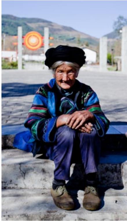
Figure 2: A Yi woman wearing traditional dress sits in a public square in one of the new Yi villages built by the Chinese government.

replete with colorful songs, dances, and clothing, as well as clean water, pure air, and expansive views. It is these strong ancient links between beautiful mountain landscapes and unique—now rare—minority customs that together form the primary attraction to tourists. However, during my research team's fieldwork in the area, we were deeply struck by the number and scale of industrial developments already transforming these traditional landscapes. The contrast between the beautiful natural environments of Liangshan and the unexpected evidence of damage caused by larger-scale human activities was startling. The demolition of forests and other habitats had significantly harmed local landscapes and ecosystems, resulting in drought, desertification, and water contamination, among other problems.