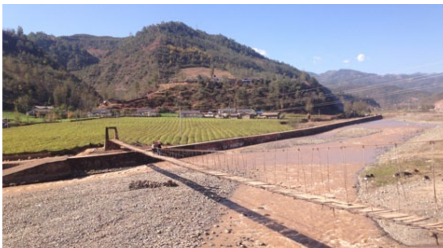
Figure 4: The Anning River is the largest river in the Liangshan area and the Western Sichuan Plateau. It is normally dry throughout the year.

crowning the peak of Sichuan's most famous tourist area. The richness of environmental resources makes Puge famous for forestry, mining, and animal husbandry. Meigu (美姑) County was the third area of our trip, as well as the most difficult to reach, as it lies deep in the mountains of the Dafengding Nature Reserve (大封顶自然保护区), an important panda habitat that can only be accessed for a few months each summer before it becomes cut off by heavy snow. The landscapes within our research area are therefore complex and diverse, including high mountains, deep valleys, basins, and hills, all interlaced with each other and sheltering not only the secrets of traditional Yi settlements, but also more unexpected modern developments.