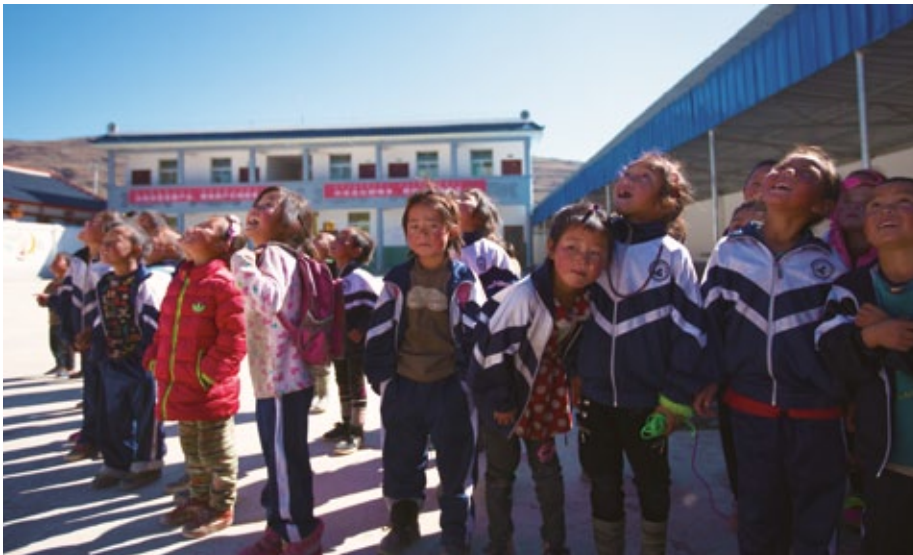
Figure 25: At an altitude of 4,000 meters, children in a mountain village stare curiously at a drone flying overhead.

velopment policies. This issue is compounded by the fact that many of the community's young, educated, or ambitious members migrate out of villages, leaving behind few opportunities for the establishment of democratic administrations. The troubling result of these processes is that while the rich continue to become richer and more powerful, the condition of China's rural poor has only gotten worse.