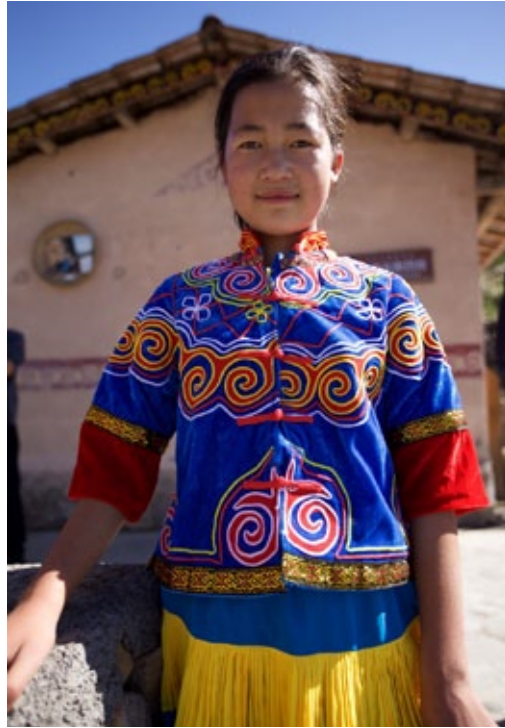
Figure 30: A schoolgirl wearing her "new" outfit, which is designed in traditional Yi style

protecting local nature, this too is done mostly for the purpose of attracting more tourists, who may themselves cause further environmental harm. In the midst of the changes to landscapes, cultures, and social structures brought on by the rapid development of the Chinese countryside, such inevitable environmental deterioration has been, and will continue to be, the most disquieting trend.