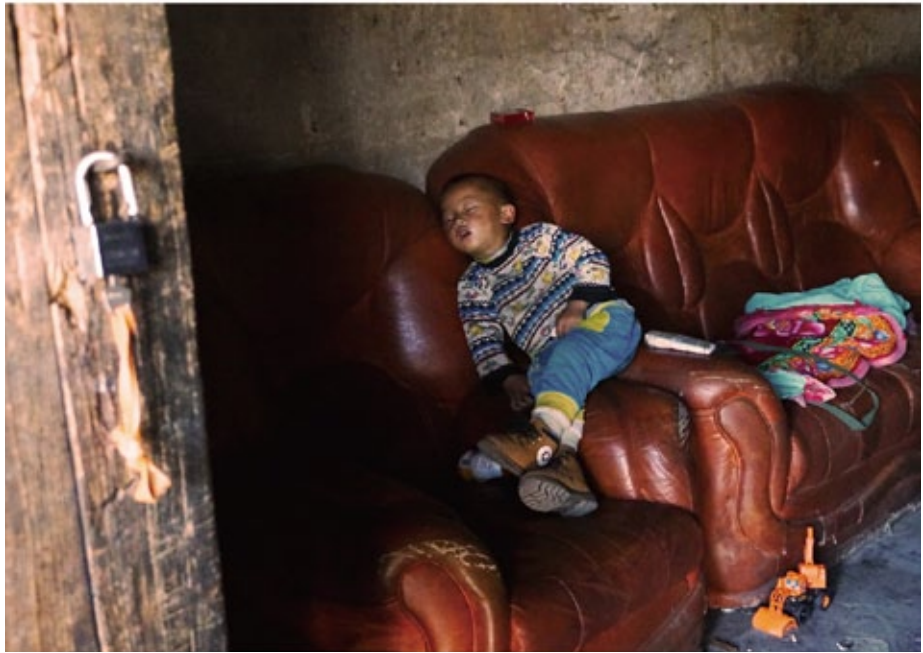
Figure 27: The rapid economic development during the last four decades has brought with it many serious social problems. One of these is the “left-behind children” (留守儿童).

Most people migrating out of old villages have to rent farmland from locals in order to continue cultivating, or switch to other businesses to earn a living. Immigrants said they found it difficult to integrate into local communities: local people often viewed them as “outsiders” and harbored fears that newcomers would drain resources once belonging exclusively to them.