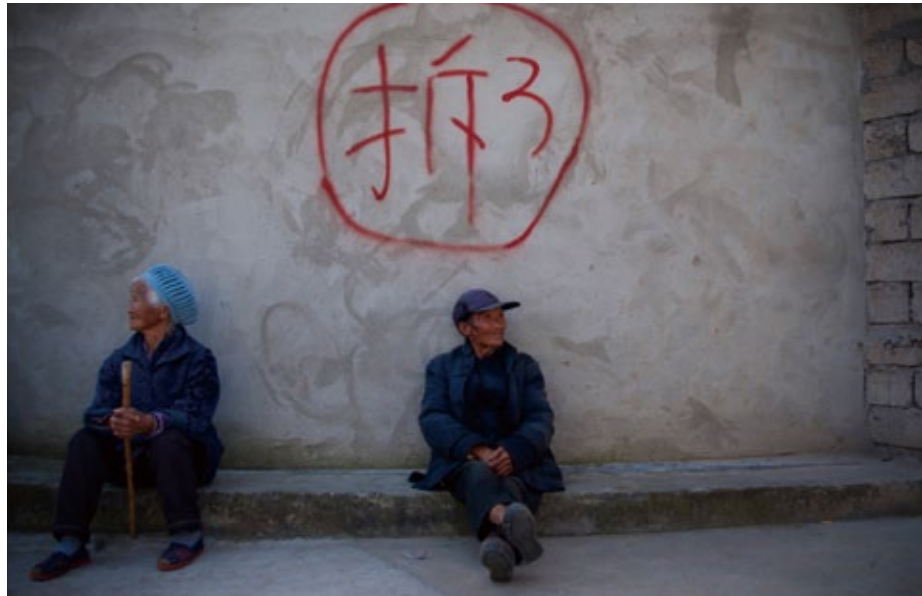
Figure 6: Two elderly villagers sit in front of their home, which has been marked with a demolition (拆) notice. Under the government's rural development project, many old homes have been destroyed in order to build new ones in their place.

To understand recent changes to Liangshan's landscape, it is important to have a sense of the history of economic transformation in China. China's history as an advanced agricultural civilization stretches back thousands of years. Long considered one of the world's largest and most progressive economies, it faced several periods of stagnation and decline between the sixteenth and twentieth centuries. Forty years ago, in a political shift away from Soviet Union-based social control and policy, China embarked on a new era of economic reform—one that has significantly transformed rural agriculture, settlements, and cultures. Motivated by the top-down policies of reformists within the Communist Party of China and pushed forward by Deng Xiaoping, this famous venture consisted of two principal components: industrialization and urbanization. The first two stages of the "reform and opening up" policy resulted in 20 years of developments involving more open ventures with foreign investment and the breaking up of long-established agricultural collectives. The reforms extended from several example cities (such as Shenzhen, Zhuhai, and Xiamen) outwards to almost the entire country. Upon realizing that its policies would never be truly successful without the joint development of urban and rural areas, the government issued new strategies to eliminate poverty and to help develop rural economies.