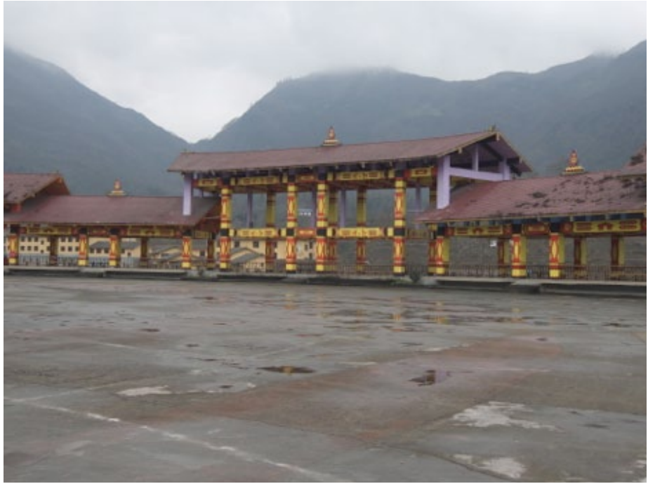
Figure 15: This “new” Yi village was constructed as part of the Chinese government’s “new socialist country- side” project.

such as the male patriarch or grandparents, could sit near the fire. For safety reasons, however, the homes in the new villages are not only made of concrete but also lack a fireplace. This style of home design has therefore wreaked havoc on Yi family life and has been widely criticized. During our interviews with residents of the new Yi villages, people complained about the new houses, which they feel have removed the core area of daily life in Yi households. The houses in the new villages—which are centralized in valleys or along highways in order to direct Yi livelihoods away from traditional mountain cultivation towards factory work or small-business ownership—are meant to represent a shift away from such ancient traditions towards new, modern lifestyles. Such drastic changes to social life have meant that although the Yi are offered the opportunity to buy inexpensive homes in new villages, many lose the sense of belonging they once had when they do so. The government has ignored such criticisms and continues to promote the new Yi villages as a model for ethnic-minority villages around the country.