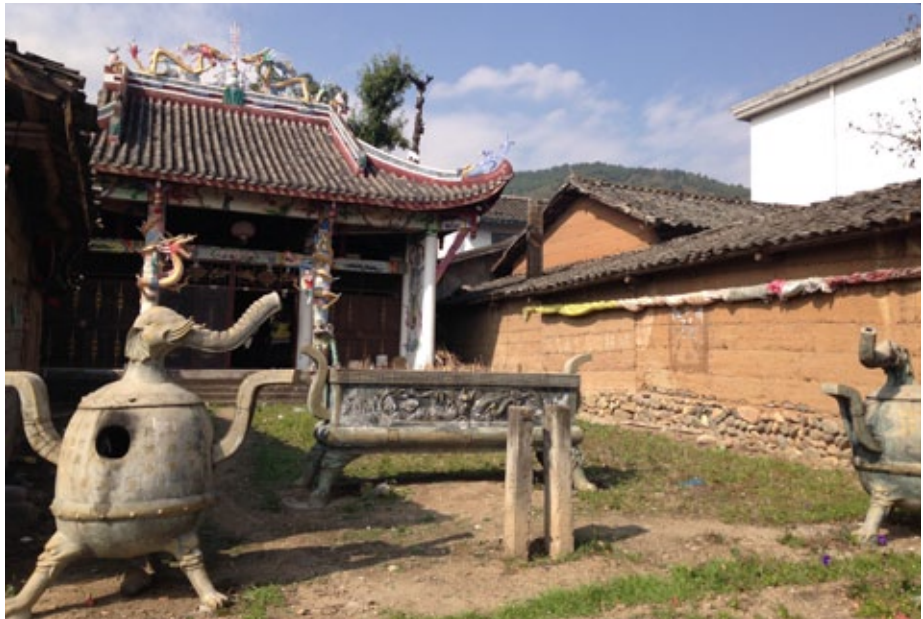
Figure 18: An empty temple standing in a Yi village

The change brought on by rural development has also affected religious practices and values that Yi communities have traditionally taken very seriously. 2 The regions that Yi people originally settled in were idyllic, with beautiful scenery, pleasant climates, and abundant natural resources, allowing for the development of rich cultures and lifestyles that were in harmony with nature.