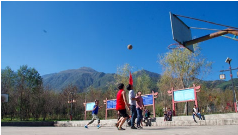
Figure 24: Many young Yi study and work outside of their home village, only returning every December for the celebration of the Yi New Year.