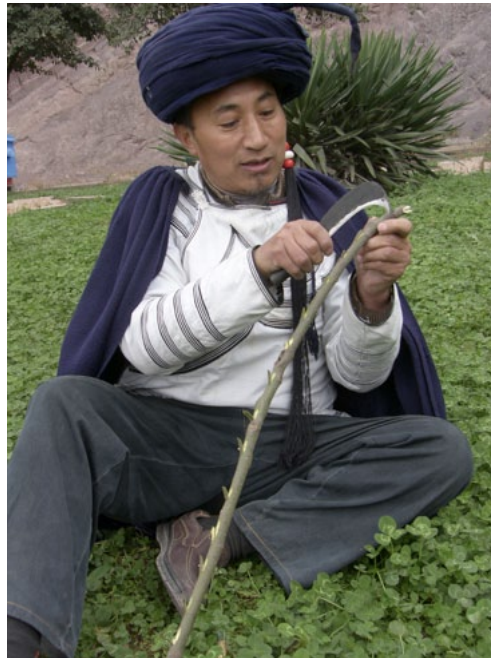
Figure 19: A bimo cutting a branch in preparation for a traditional Yi ritual.

Despite the sense that some traditions are rapidly disappearing, ritual performances still play a major role in Yi daily life and are used for healing, exorcisms, invoking