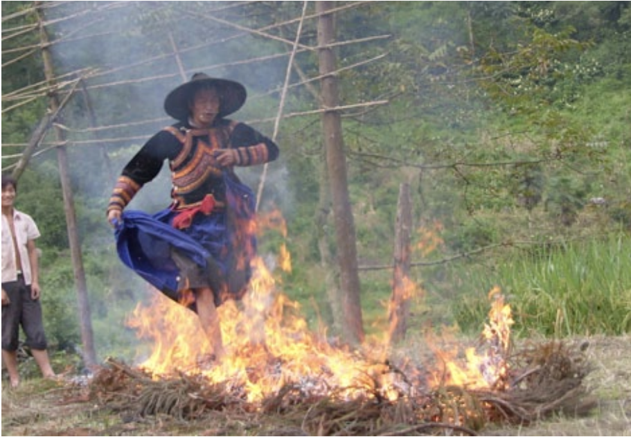
Figure 21: A bimo performing a religious rite by walking through a “sea of fire”