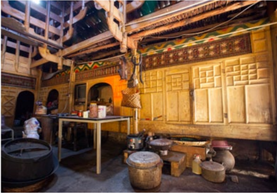
Figure 14: The interior of a traditional Yi wooden house © Fei Tian, 2016

The Chinese state's "new socialist countryside" policy, however, has challenged such living arrangements. As part of this initiative, the government has constructed numerous brand new villages on unused land, or relocated existing villages to nearby areas. Under this massive national policy, several model projects have been set up in ethnic minority areas in the hope of promoting "new socialist villages" throughout the countryside. One of the latest examples is the "New Yi Villages" (彝族新寨) project. These large, government-built residential areas are intended to house Yi families who previously lived scattered across mountains or valleys. Everything within these villages is new: new buildings, new livelihoods, and new social relationships—in short, completely new lives for their residents.