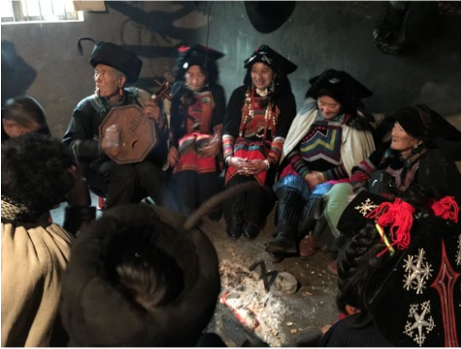
Figure 16: The fireplace in the center of the living room is literally the center of traditional Yi life: a space for cooking, socializing, and making music.