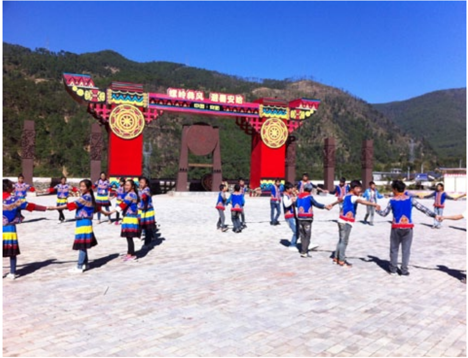
Figure 29: Villagers perform songs and dances in traditional Yi cloth- ing to attract tourist audiences.

this can provide Yi people with a means of improving their livelihoods in their home villages, perhaps more will remain in the countryside, instead of seeking work elsewhere. Furthermore, as the cultural practices of ethnic minority communities attract more tourists and business to China's rural regions, tourism might become one of the most important ways of safeguarding Yi culture. The national and local governments have continued to support Yi communities in their efforts to develop their regional economies, and have even launched some national parks, natural reserves, and wetlands projects in order to develop tourism in Liangshan.