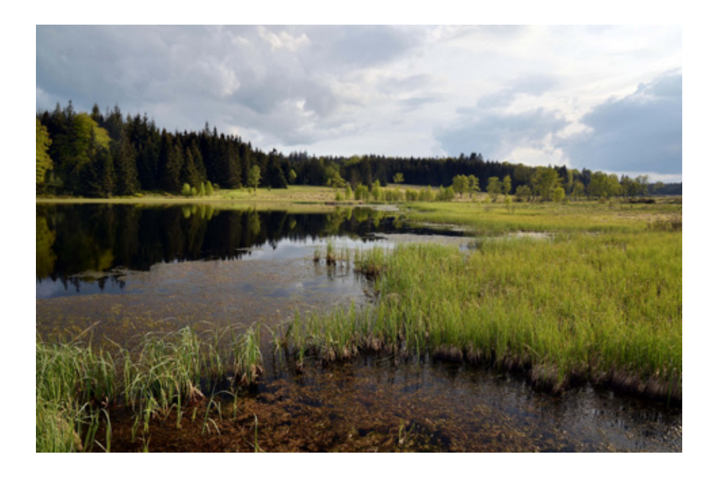
Figure 1: Schwarzbach pond and peat bog (Kuchelscheid, Belgium).

According to Smith and Zeder (2013) niche construction behavior can be traced as far back as the early hominids, but substantial change in human behavior occurred at the beginning of the Holocene (ca. 11,000–9000 BP). At this point in human history, at different locations across the globe, a major shift occurred in humans' adaptation of the surrounding ecosystem: the domestication of plants and animals. Just as we altered our environment to accommodate them, these domesticates substantially modified their ecosystem in turn—e.g., by introducing new arable species and exploiting an as vet untouched animal resource—and so we have been able to record this shift in subsistence and niche construction behavior within the framework of the social sciences. Niche construction can be divided into two categories: inceptive and counteractive (Kluiving et al. 2015). Inceptive niche construction refers to the initial modification of an environment, as might happen when a species migrates to a region for the first time or adopts new behaviors. Six thousand years ago in the western Netherlands people reacted to the threat of the rising sea level by raising the ground surface level with reed bushes, or moving to higher and drier places. Counteractive niche construction occurs as an adaptive response to an environment that has already been altered. The effects of deforestation on river sedimentation processes and early water management