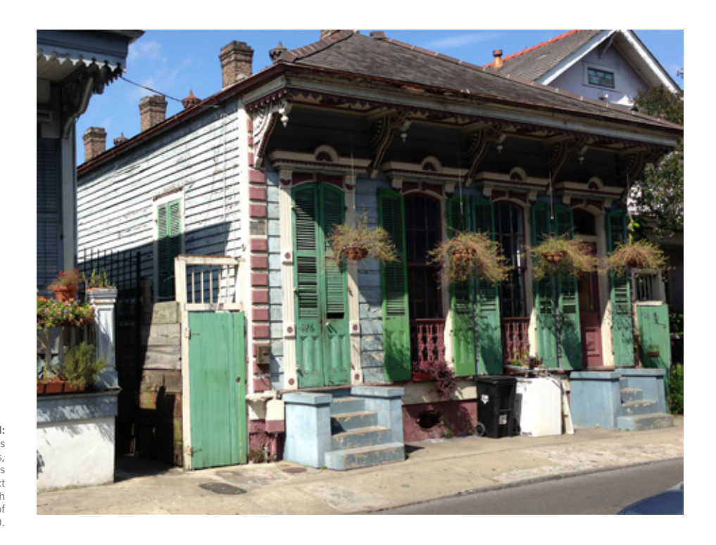
Figure 1: Our homes, like this one in New Orleans, often provide pests with the perfect environment in which to flourish.

grounds that human actions are propelled by intentions, whereas those of machine tools or microbes are not. To address this concern, Andrew Pickering (1993) suggests that we turn our attention to the moments when human agency confronts the "contours of nonhuman agency." He conceptualizes this process as a dialectic of resistance and accommodation, "the struggle between the human and material realms in which each is interactively restructured with respect to the other."