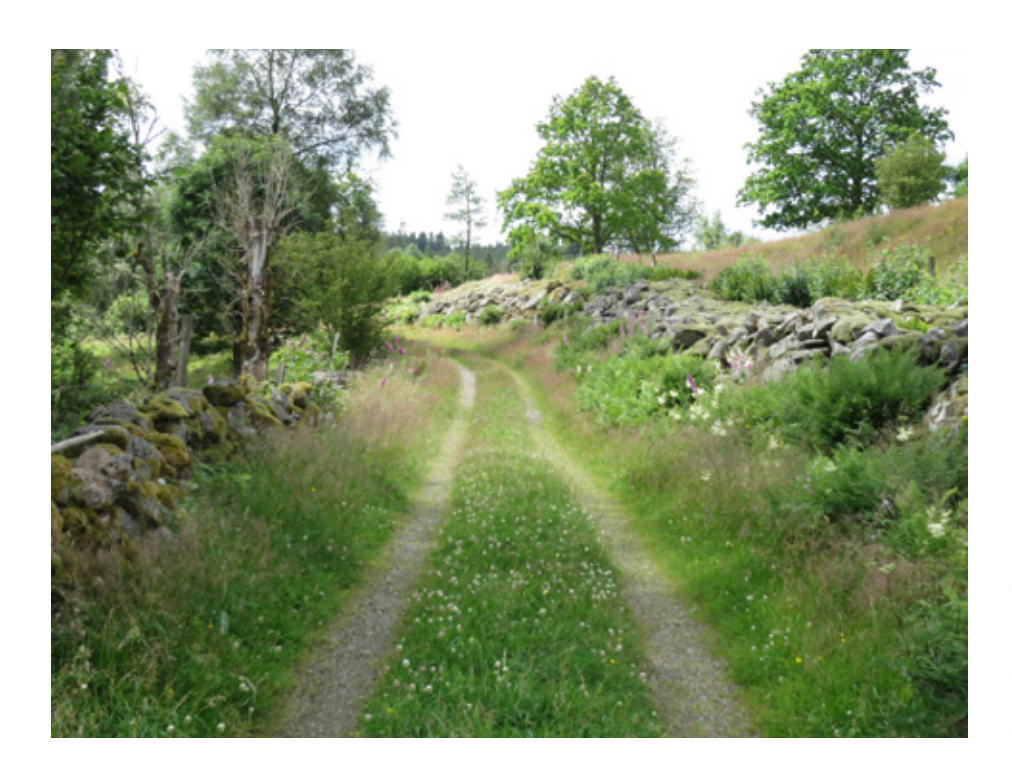
Figure 1: A present-day view of remnants of the infield system. The photo shows a former cattle path leading out from a farm through the infields to the outlying land in Yttra Berg, Halland province, Sweden.

creasingly made from wool from domesticated sheep, replacing earlier material from cattle and wild animals. Over time, as the management systems improved, the size and form of these tools changed, for example the length of blades on scythes. Today, we can still see evidence of the temporal sequence of meadow management (which likely developed quite early): some areas continue to use old-fashioned methods to make and harvest hay, such as spring raking (the removal of dead leaves and grass), after-harvest grazing by livestock (which also ensures nutrients are cycled back into the meadow), and pollarding.