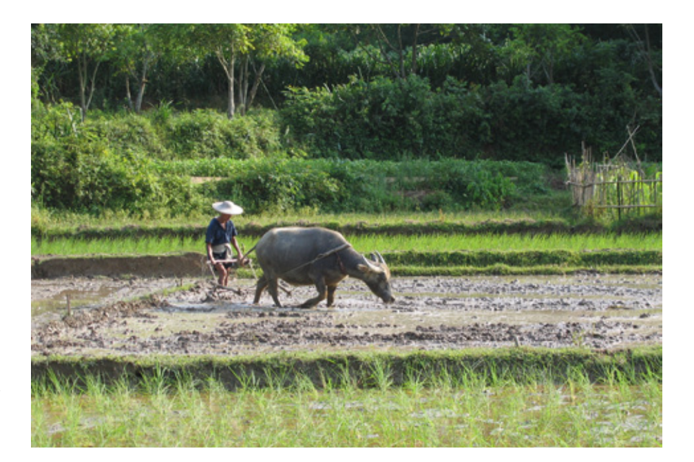
Figure 2: Water buffalo plowing in preparation for rice transplanting, Dianbai, Guangdong, China.

represents the first substitution of nonhuman biomass energy for human biological energy—used in engineering ecosystems and to digest food—farmers learned to supplement the energy of human labor with domestic livestock, wind, and hydropower. Industrial societies scaled up further with populations growing rapidly, sustained by expanding trade in food and other resources across Earth. These societies increased their use of fossilized biomass (coal, oil, natural gas) and non-biomass forms of energy—such as nuclear and solar power—to supplement and ultimately eliminate human energy in engineering ecosystems, the social allocation of food and resources, and even in communicating with one another.