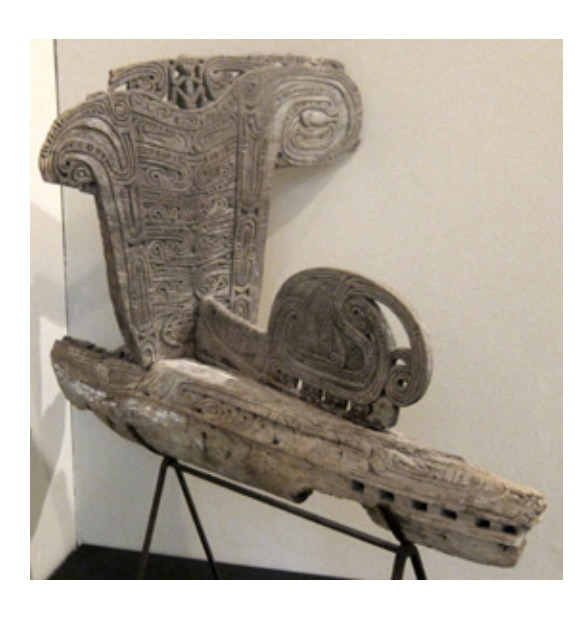
Figure 2: Canoe prow from Papua New Guinea, probably the Trobriand Islands.

modern societies than it was for the indigenous population of Papua New Guinea described by Gell. Just as the beautiful, richly decorated prows of the Trobriand Islands canoes fascinated and even dazzled their Polynesian spectators, winning them over in commercial transactions (one of Gell's most famous examples, see fig. 2), it is not uncommon for us today to be similarly captivated by a work of art, allowing it to influence our thoughts and feelings. The piercing gaze of one of