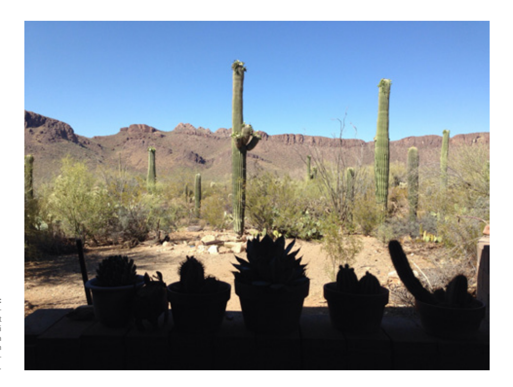
Figure 2: Creating indoor environments that reflect the outdoors—cacti viewed from inside a house in the Sonoran desert, Arizona.

its code, but we can only understand DNA's function by considering it whole, in action at multiple scales. Lewontin contends that organisms, influenced in their development by their surroundings, in turn change and even create the environments they live in.