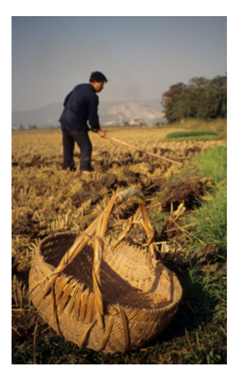
Figure 1: Manuring and preparing soils for wheat planting, Xueyan, Jiangsu, China.

While many species are social (consider honeybees, for example), the extraordinary sociality of behaviorally modern humans marks us as Earth's first "ultrasocial" species. Humans have unrivaled capacities for learning from others and for transmitting this social learning—as cultural inheritances-both within and across generations. This makes it possible for human cultural inheritances to accumulate and evolve over time. Moreover, the very nature of human social life is itself structured largely by social learning, often requiring socially learned relationships with non-kin individuals for survival. This dependence on social learning means that the behaviors of human individuals, groups, and entire societies are incredibly variable-with different strategies for ecosystem engineering and ex-