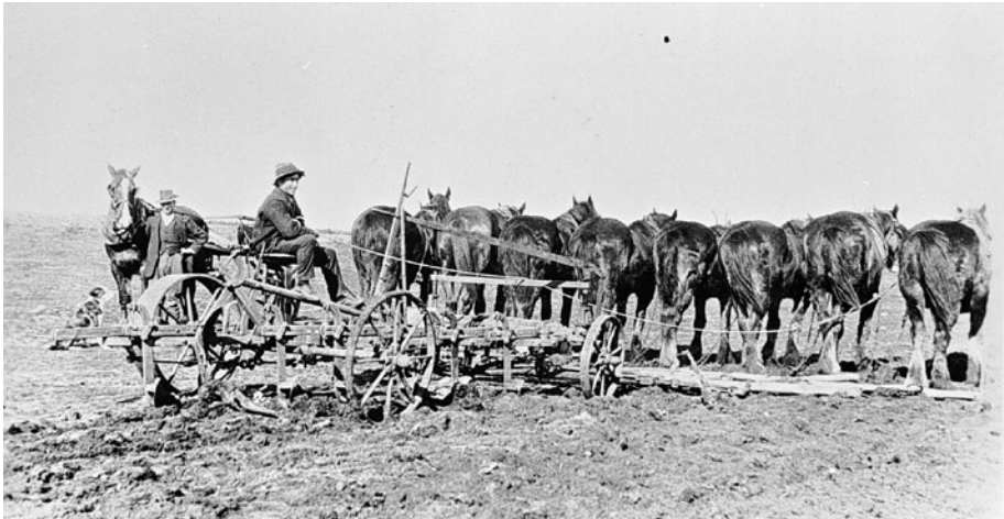
Figure 4: Ploughing with a stump-jump plough

they grew amidst a crop of wheat, suggests. In time the mallee root would be used as a metaphor for the men and women of the Mallee: “tough, resilient, drought resistant and able to spring forth with new growth when times are good.” 6