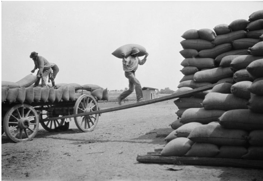
Figure 5: The Boyd's wagon at Nyarrin

big study in the story of Australian development.” 9 Boyd’s farmers look comfortable and relaxed with their machines and their animals. Mostly the horses are photographed from behind, reinforcing the power of their bodies and the skill of the men who drove them. The images naturalised and celebrated the relationship between men, land, and machine and the transformational work they enacted. As mechanisation entered the Mallee, the power of the tractor became an extension of the man at its wheel.