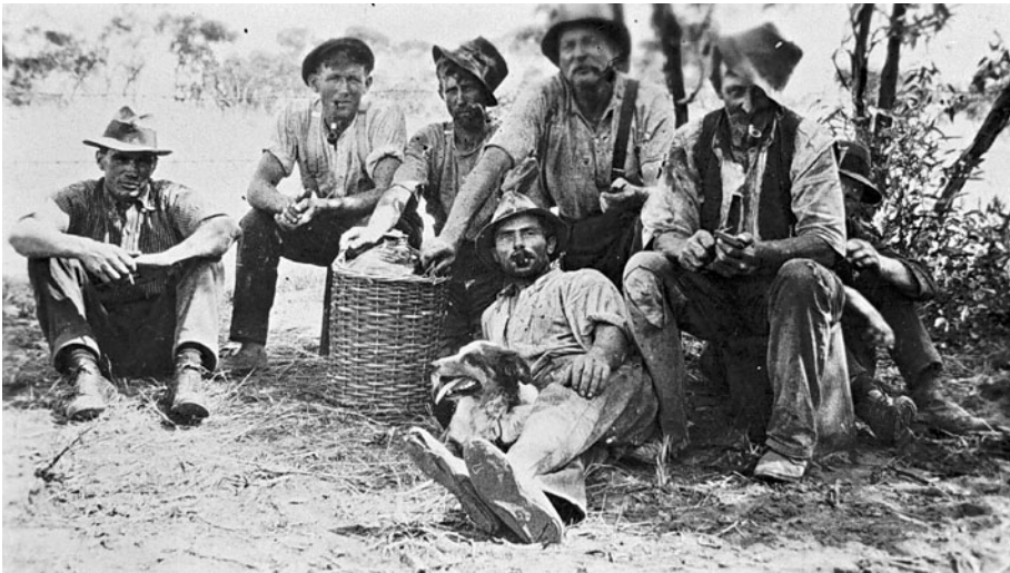
Figure 6: Harvest home

The physical strength of the men in Boyd's images conveys more than just the nature of their labour; it suggests their capability to work this land, their readiness to confront its challenges.