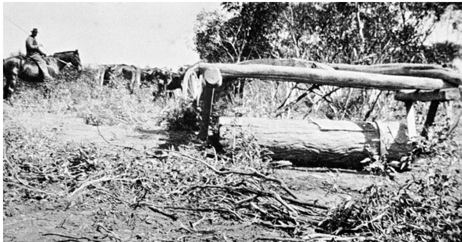
Figure 3: Bill Boyd senior "rolling" the mallee

activity of settlement and mastery. But such control was transitory. The distinctive nature of the mallee tree made clearing difficult and protracted. Roots that were not cleared, or "grubbed," would continue to sprout. This too was the work of men and boys, as another image of Boyd's father and younger brother at work slashing mallee roots as