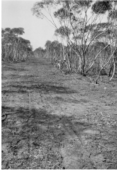
Figure 2: Mallee scrub with cleared track 1921.

Clearing was one of the key activities of Mallee settlers. Figure 2 depicts a newly grubbed road through the mallee scrub, with Bill's bike leant against a tree to provide a sense of scale. The initial work of clearing this scrub, or "rolling down the mallee," is depicted in figure 3. Bill's father used a team of bullocks and a Mallee roller to flatten the mallee bush. The foregrounded machinery, constructed from a tree stump, is crude, but it was devastating in its power. From a vantage point of power and mastery, Bill Boyd senior surveys the trees, now reduced to sticks on the ground. The Mallee would be subdued, and stockwhip in hand, the bullocks controlled. The work of clearing is repeatedly referred to in descriptions of Mallee men; it was a defining