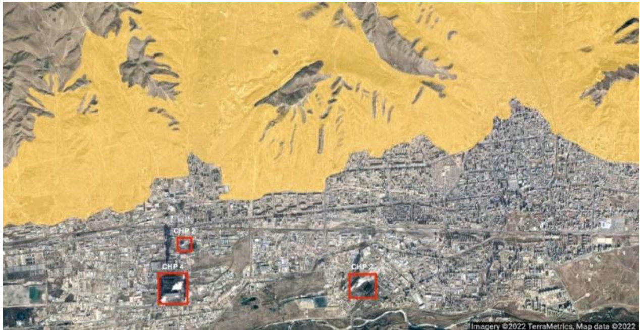
A topography map from above Ulaanbaatar with highlighted ger districts and three locations of the power plants (CHP).

However, in the medium term, the country still seems hooked on coal. Inside Mongolia, low-income residents have no other option but to burn coal. At the same time, the Mongolian People's Party and foreign companies have heavily invested in coal and are reluctant to change course. Board members of the power plants actively lobby and obtain lucrative contracts, while left-wing politicians continuously fail to endorse past renewable projects. Consequently, the government plans to develop six new coal plants, including one in the capital, over the next ten years.