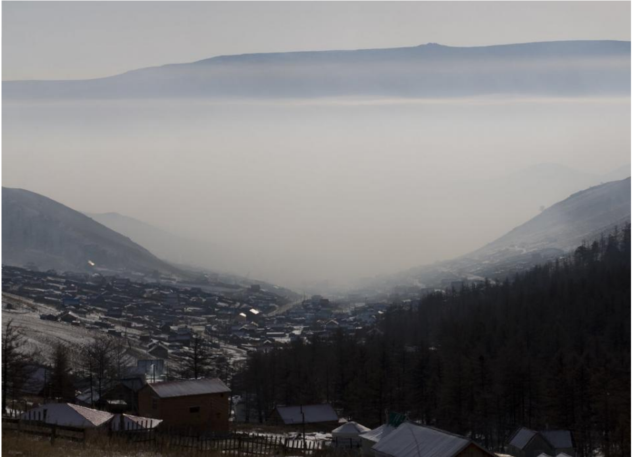
A view from a ger district on the outskirts of Ulaanbaatar.

Accessed via Flickr on 1 September 2022. Click here to view source.