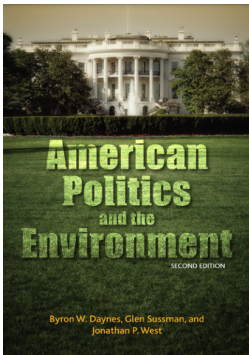
American Politics and the Environment . Cover.