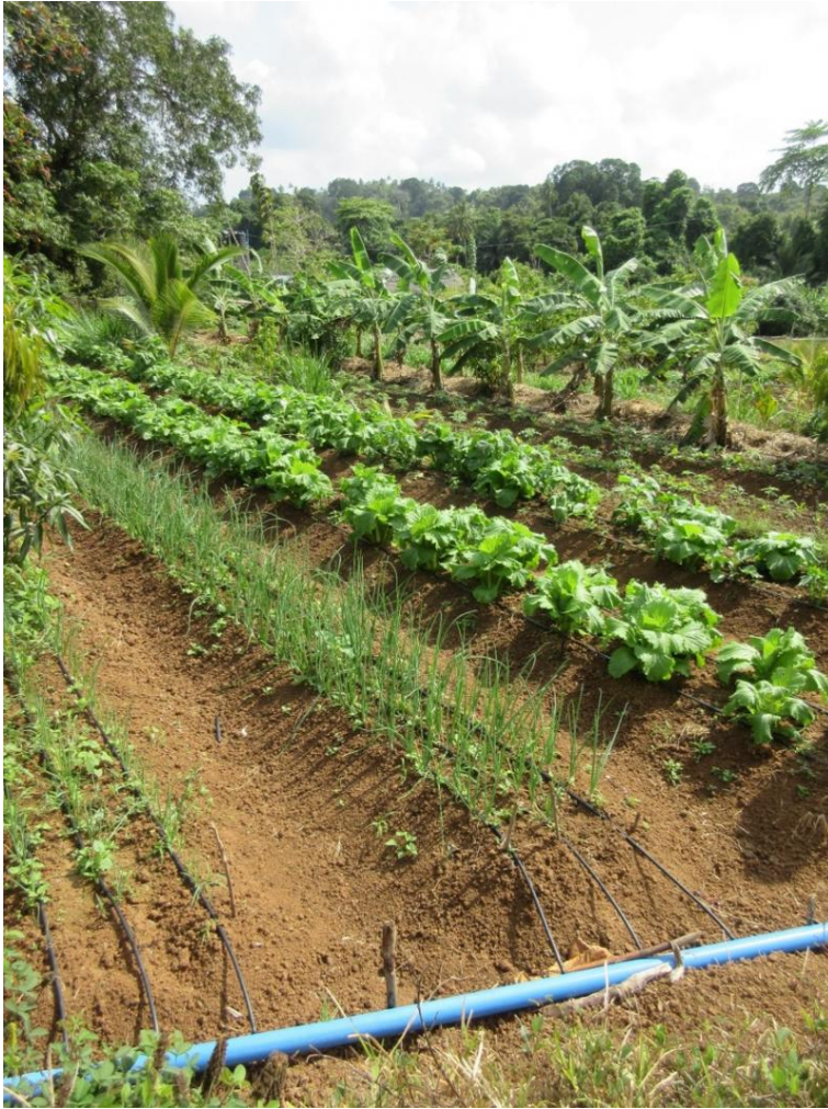
Vegetable and tree crops on Amour's property as a result of experimentation with animal excrement and other innovative techniques (2019).