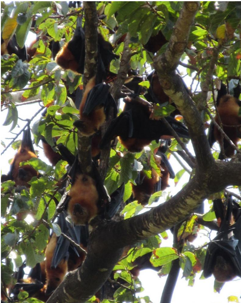
Pemba flying foxes ( Pteropus voeltzkowi ), a macro-bat (2018).

More than 30 local farmers began to make a manure mixed from the excrement of cows and chickens. When applied, it added nitrogen to plots totalling more than 25 hectares. If applied judiciously, urea also increased the rate of organic decomposition which enriched soils. Dried cow dung and a compost of mixed green leaves, dried leaves, ash, and water further facilitated success. From these strategies, Amour's business ledgers indicate increased yields of vegetables and legumes. He then coordinated a participatory agricultural project to elaborate on experimentation and to distribute knowledge from their collaboration to other farmers on the island and to politicians. Amour called the endeavor a "farmer field school." Meanwhile, the group opened a community shop to sell their fertilizers and to convey relevant strategies. As Amour put it, "farmers' problems lie well beyond the government, and so too do solutions."