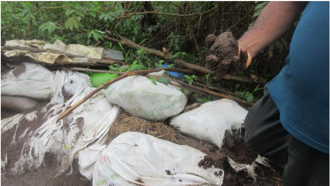
Cow and chicken excrement to be used as fertilizer on Amour's farm (2018).