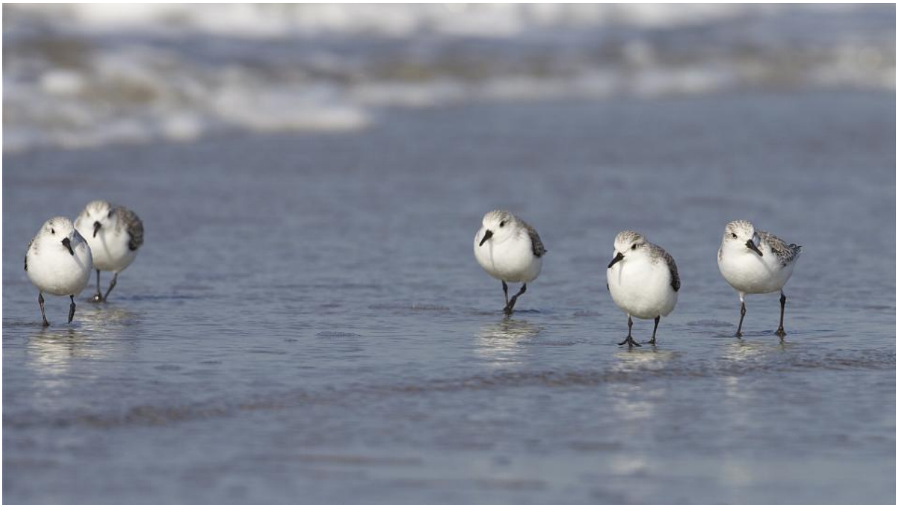
Five Sanderlings ( Calidris alba )

The sanderling, then, is bound to disappear, as was always its fate. In speaking about loss in the context of a bird who continually loses the ground beneath its feet and the marks it makes on the soil, this is a particularly resonant poem for the Anthropocene—a time in which we stand to lose so much, not least sandpipers, a family that includes a number of birds on the IUCN red list of threatened species. Still, the internal rhyme of the poem's final two lines conveys a sense that although short lived, the sanderling's fight for existence was not entirely misguided: it hints that there has been harmony, beauty, and a sense of belonging in its being.