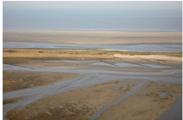
Photograph by Bas Kers, 2006.

This work is licensed under a Creative Commons Attribution-NonCommercial-ShareAlike 2.0 Generic License .