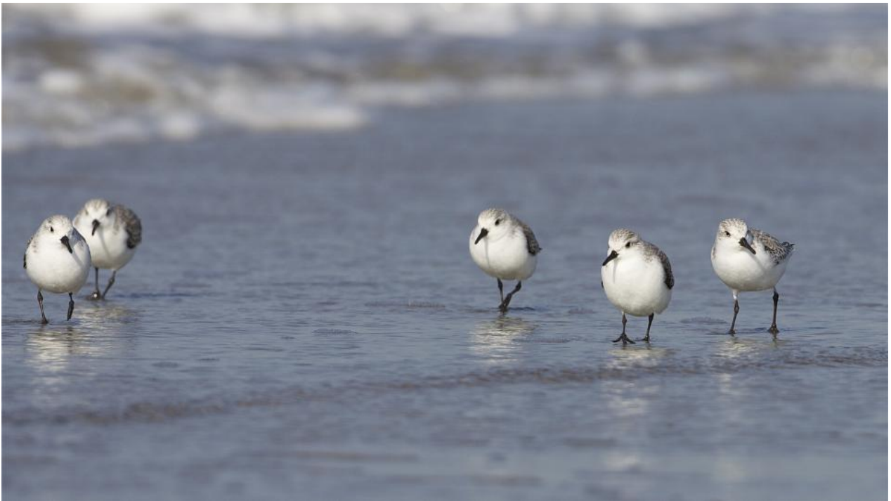
Five Sanderlings ( Calidris alba )

The sanderling, then, is bound to disappear, as was always its fate. In speaking about loss in the context of a bird who continually loses the ground beneath its feet and the marks it makes on the soil, this is a particularly resonant poem for the Anthropocene—a time in which we stand to lose so much, not least sandpipers, a family that includes a number of birds on the IUCN red list of threatened species. Still, the internal rhyme of the poem's final two lines conveys a sense that although short lived, the sanderling's fight for existence was not entirely misguided: it hints that there has been harmony, beauty, and a sense of belonging in its being.