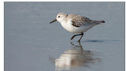
Sanderling ( Calidris alba )

This work is licensed under a Creative Commons Attribution-NonCommercial 2.0 Generic License .