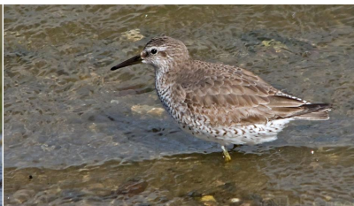
Red knot ( Calidris canutus )

This work is licensed under a Creative Commons Attribution-NonCommercial-NoDerivs 2.0 Generic License .