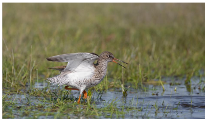
Common Redshank ( Tringa Totanus )

The Wadden Sea is a unique site, and one that raises particular questions about conservation, partly due to its significance for migrating birds. For much of the year, the Wadden Sea lacks many of the species it is protected for. It is a site in sequential waiting: for the redshank ( Tringa totanus ) to breed in springtime, the red knot ( Calidris canutus ) to feed in autumn, and the sanderling ( Calidris alba ) to overwinter. The Wadden Sea's physical constitution reflects its changing population: it too shifts shape with each coming ebb and tide, as sand and silt are removed from one place and deposited elsewhere, and its islands migrate slowly eastwards. Today, the Wadden Sea's changing nature is exacerbated by rising sea levels and changes in the behavior and distribution of species as a result of climate change.