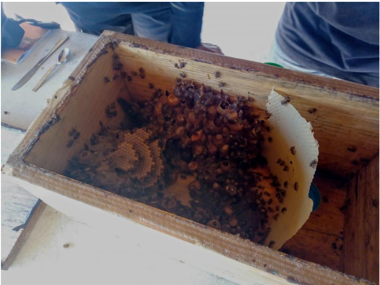
Interior of xunáan kab hives, showing formation of brood comb.

The history of xunáan kab is tied to the regional landscape, both socially and ecologically. Pre-Colombian Maya communities held the xunáan kab bee in esteem for millennia, integrating the small insects into their mythology and understanding of cosmic order, and relying on their honey as a nutritious food staple. The shape of the hive itself—tapered stacks of horizontal brood comb, separated by small pillars of wax and resin—resemble pyramids with broad bases; one of the local beekeepers I speak with mentions the bees themselves inspired the construction of the Classic Maya pyramids. There is some irony to the fact that the Mayan city and “Wonder of the World” Chichen Itza should receive so many annual visitors, when perhaps the world's oldest extant pyramid-building culture resides only kilometers away in an apiary only kilometers away.