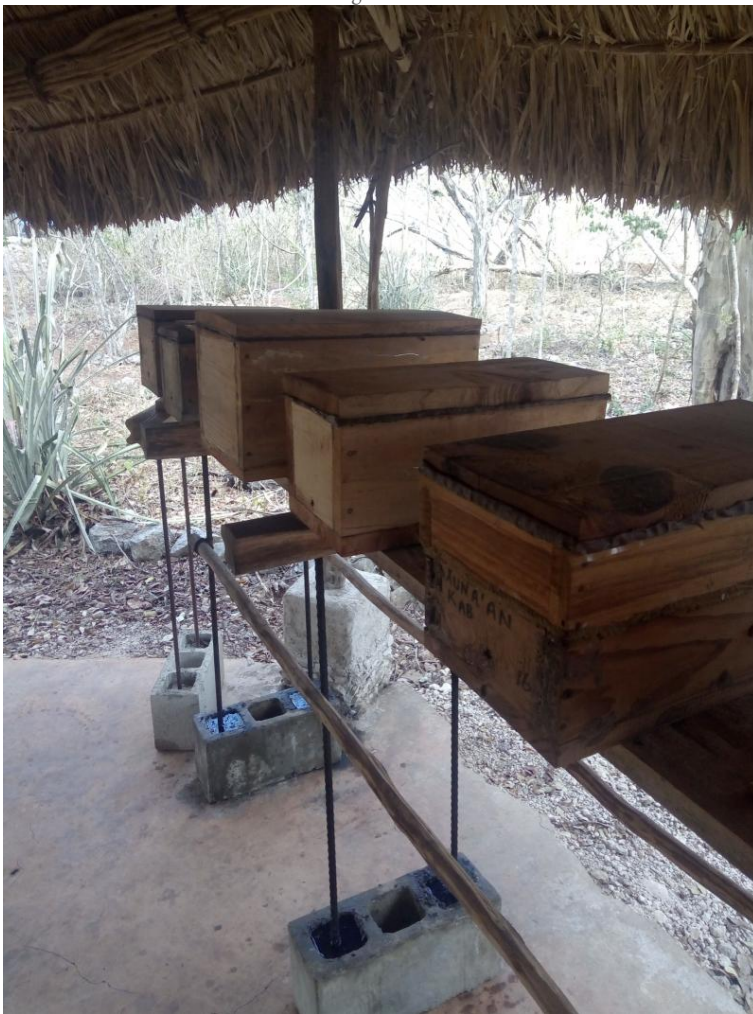
Stingless bee apiary of Zutut'ha community, Yucatan.

Xunáan kab ( Melipona beecheii ) is a stingless, honey-producing bee native to the Yucatan peninsula. The traditional Maya practice of keeping these bees is now in decline after weathering decades of deforestation, industrialized agriculture, touristic development, and the introduction of competitor species. Based on a period of fieldwork with an alternative beekeeping collective in the forests of central Yucatan, this entry discusses bees as embodiments of social and ecological histories.