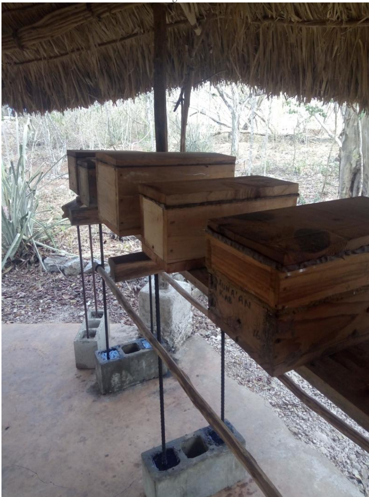
Stingless bee apiary of Zutut'ha community, Yucatan.

Xunáan kab ( Melipona beecheii ) is a stingless, honey-producing bee native to the Yucatan peninsula. The traditional Maya practice of keeping these bees is now in decline after weathering decades of deforestation, industrialized agriculture, touristic development, and the introduction of competitor species. Based on a period of fieldwork with an alternative beekeeping collective in the forests of central Yucatan, this entry discusses bees as embodiments of social and ecological histories.