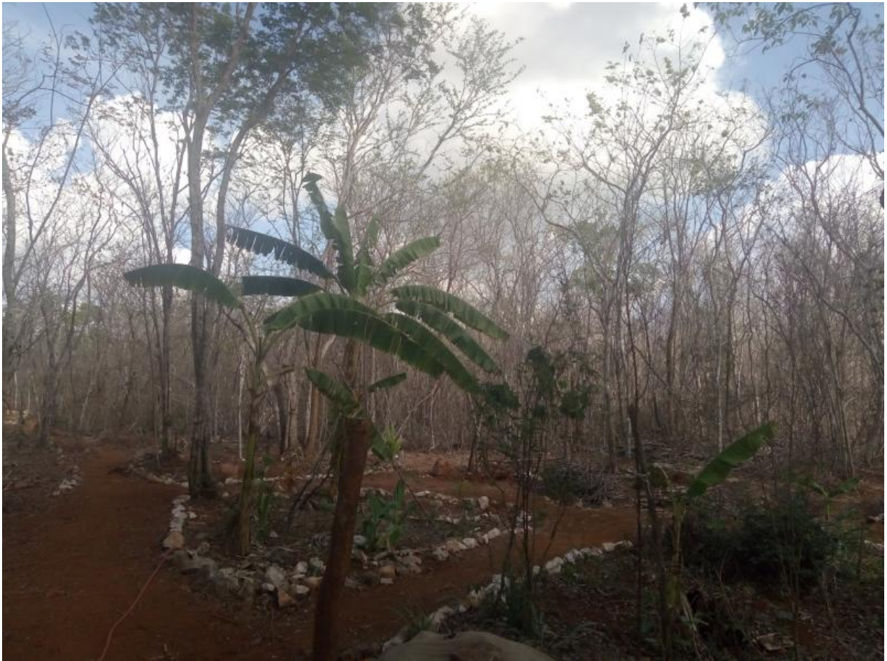
Garden plots in central Yucatan in dry season.

The story of ecological destruction and colonization in Yucatan has been narrated through the lives of nonhuman species before. Yet the species that get to tell these stories are often the ones that make the biggest impact, with easily distinguishable introduction events or punctuated bursts of ecological disturbance. One of these is henequen , a kind of agave that became highly valuable for its use as a fiber. In the late 1800s, much of the old-growth forest of the central peninsula was cleared to make way for vast monocultures of the plant. The boom (and subsequent bust) of “King Henequen” continues to dominate the version of regional history that most tourists to the region encounter, with plantation tours and Merida’s neoclassical architecture the most conspicuous memorials to Yucatan’s “golden age.”