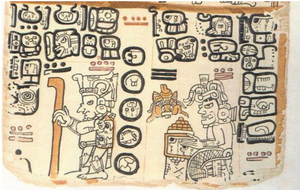
A selection from page 108 of a copy of the Madrid Codex, depicting the cultivation of native bees [bottom right].

Yet as newcomers to the region, aside from the practice of meliponicultura , the success of Zutut'ha community's beekeeping operation and their broader mission to produce food in ways that minimize harm to the local environment hinge on their relationships with local experts. Adopting meliponicultura connects the collective to their Maya neighbors through a shared history of practice, including sharing hives to allow beekeepers to propagate new colonies and trading tips about pest control.