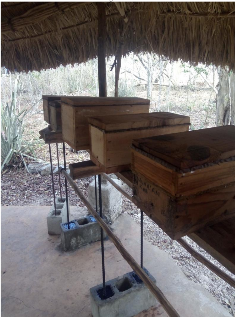
Stingless bee apiary of Zutut'ha community, Yucatan.

Xunáan kab ( Melipona beecheii ) is a stingless, honey-producing bee native to the Yucatan peninsula. The traditional Maya practice of keeping these bees is now in decline after weathering decades of deforestation, industrialized agriculture, touristic development, and the introduction of competitor species. Based on a period of fieldwork with an alternative beekeeping collective in the forests of central Yucatan, this entry discusses bees as embodiments of social and ecological histories.