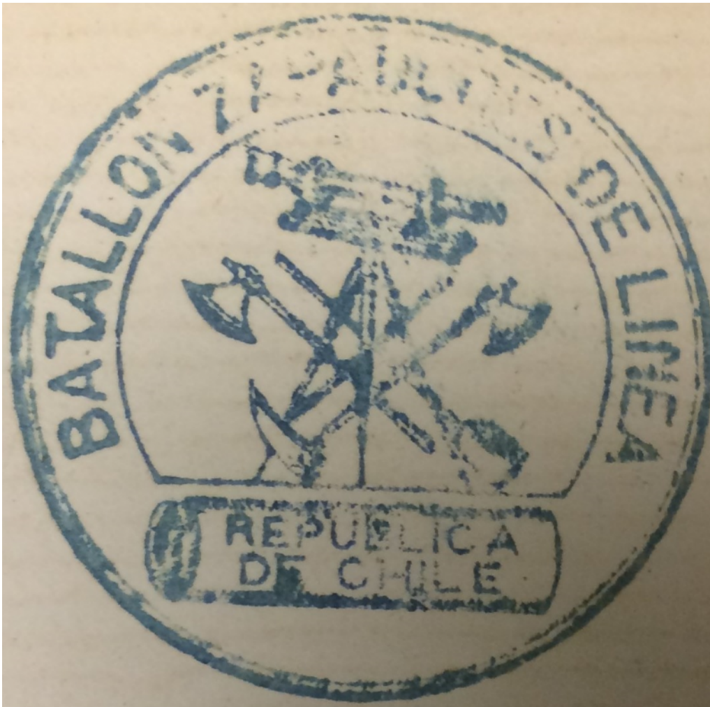
Engineer battalion water print, 1879.