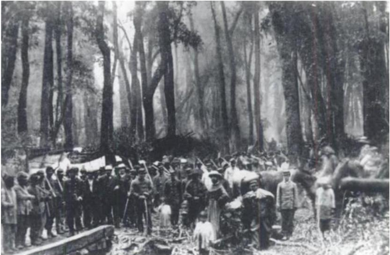
Chilean troops during the occupation of the Araucanía. Note the forest in the background.

It is advisable for the development of agriculture, industry, and commerce and to the best service of the military operations in the Arauco provinces, Bío-Bío and the Colonization Territory, the organization of an engineer battalion to be in charge preferably of the opening, repairmen, and conservation of public roads, bridges, telegraphs, barracks, hospitals, fortifications, and other public works to be done.