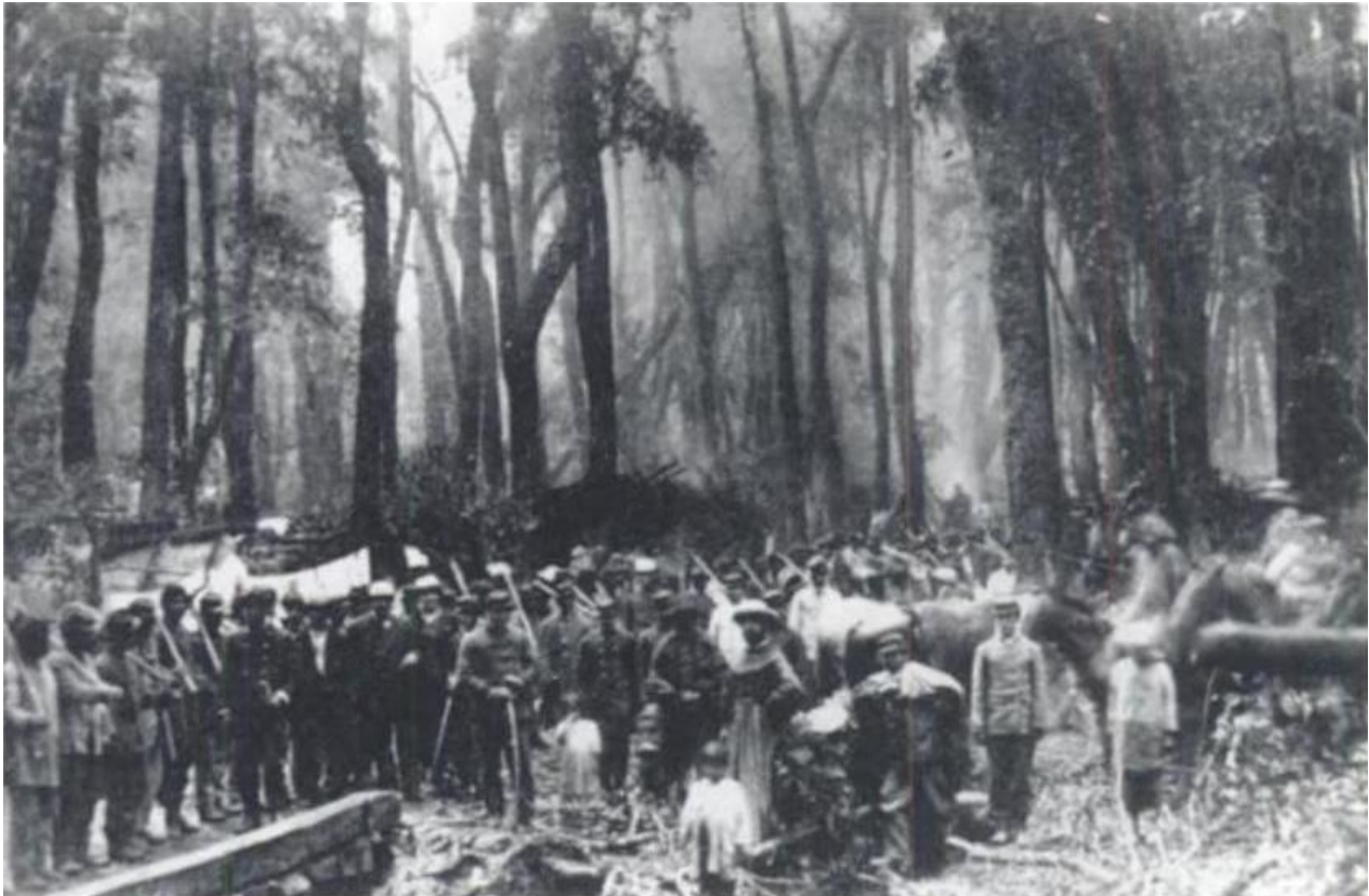
Chilean troops during the occupation of the Araucanía. Note the forest in the background.

It is advisable for the development of agriculture, industry, and commerce and to the best service of the military operations in the Arauco provinces, Bío-Bío and the Colonization Territory, the organization of an engineer battalion to be in charge preferably of the opening, repairmen, and conservation of public roads, bridges, telegraphs, barracks, hospitals, fortifications, and other public works to be done.