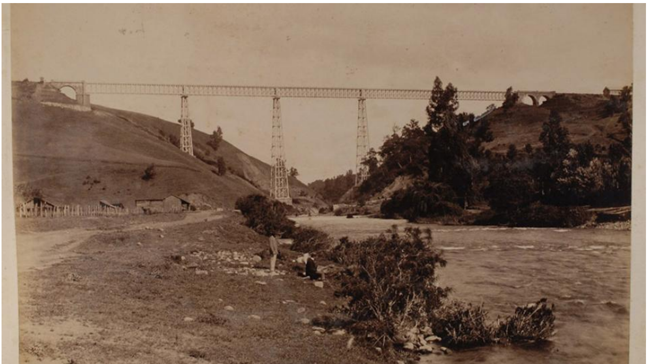
The Malleco Viaduct in 1890, with a length of 408 meters and a height of 102 meters.

What we need more in the Araucania are good communication networks. Open the Cholchol road, repair the roads of Contulmo, Vega Larga, the Malleco line, and the Collipulli to Mulchén line. It should be done by the engineers before next winter, beginning soon. Then we will have done more for the conquest and domination of the Araucania, than what we would have done through many years of war and combat.