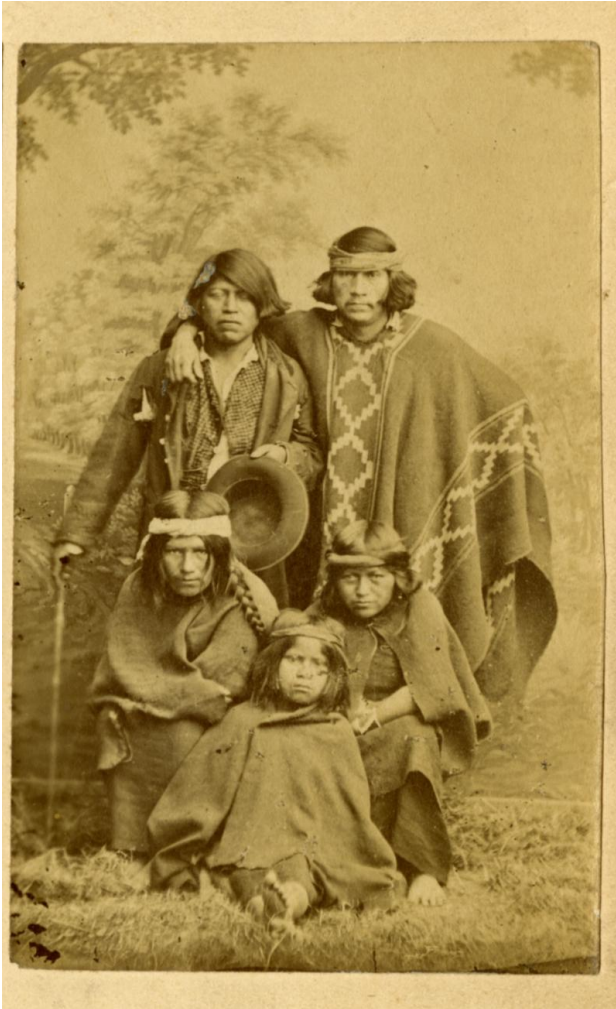
Mapuche family, 1890.