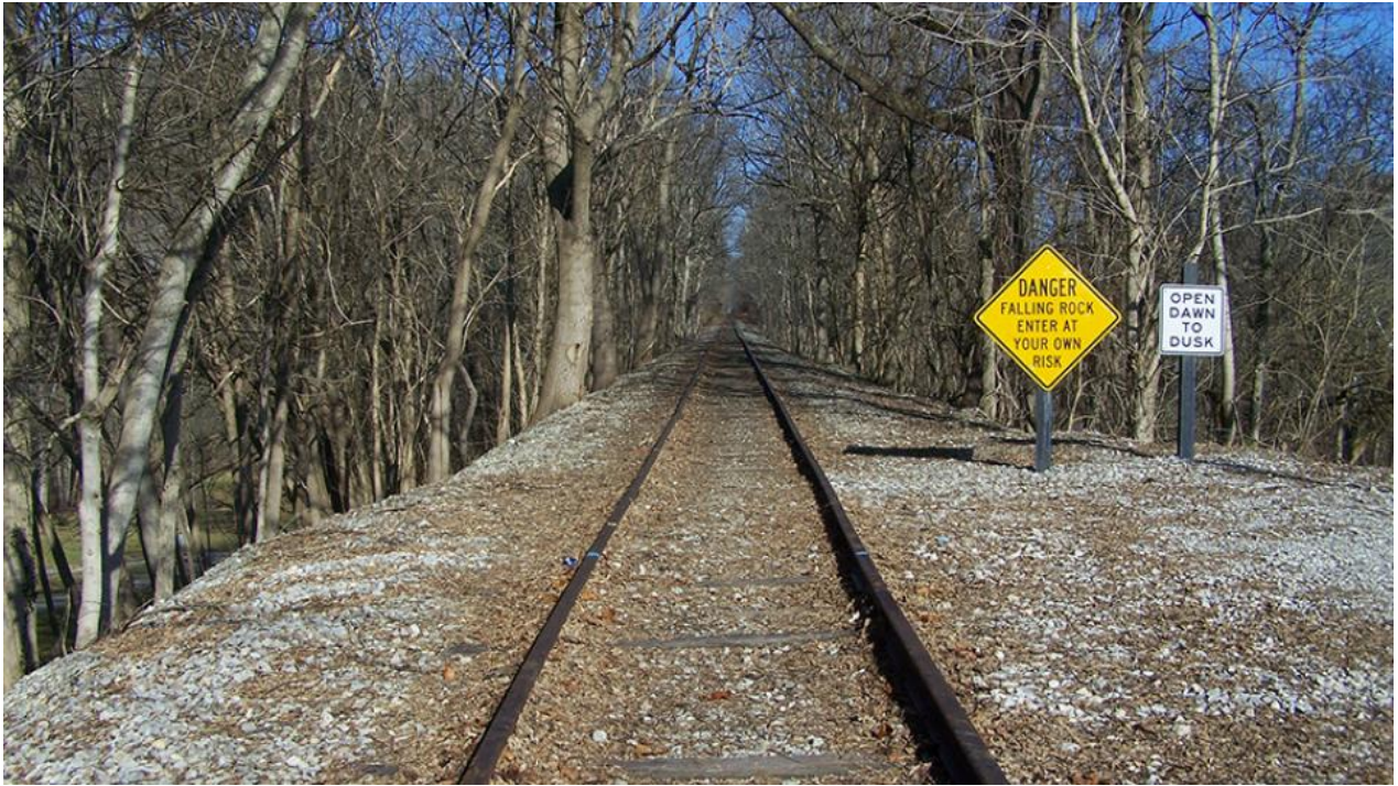
Photograph of the Madison, Indianapolis & Lafayette Railroad incline looking north.

between the base of the bluffs and the north side of the town, and empties into the Ohio immediately west of Madison. Branches of the creek, like Dugan Hollow, drain adjacent hills.