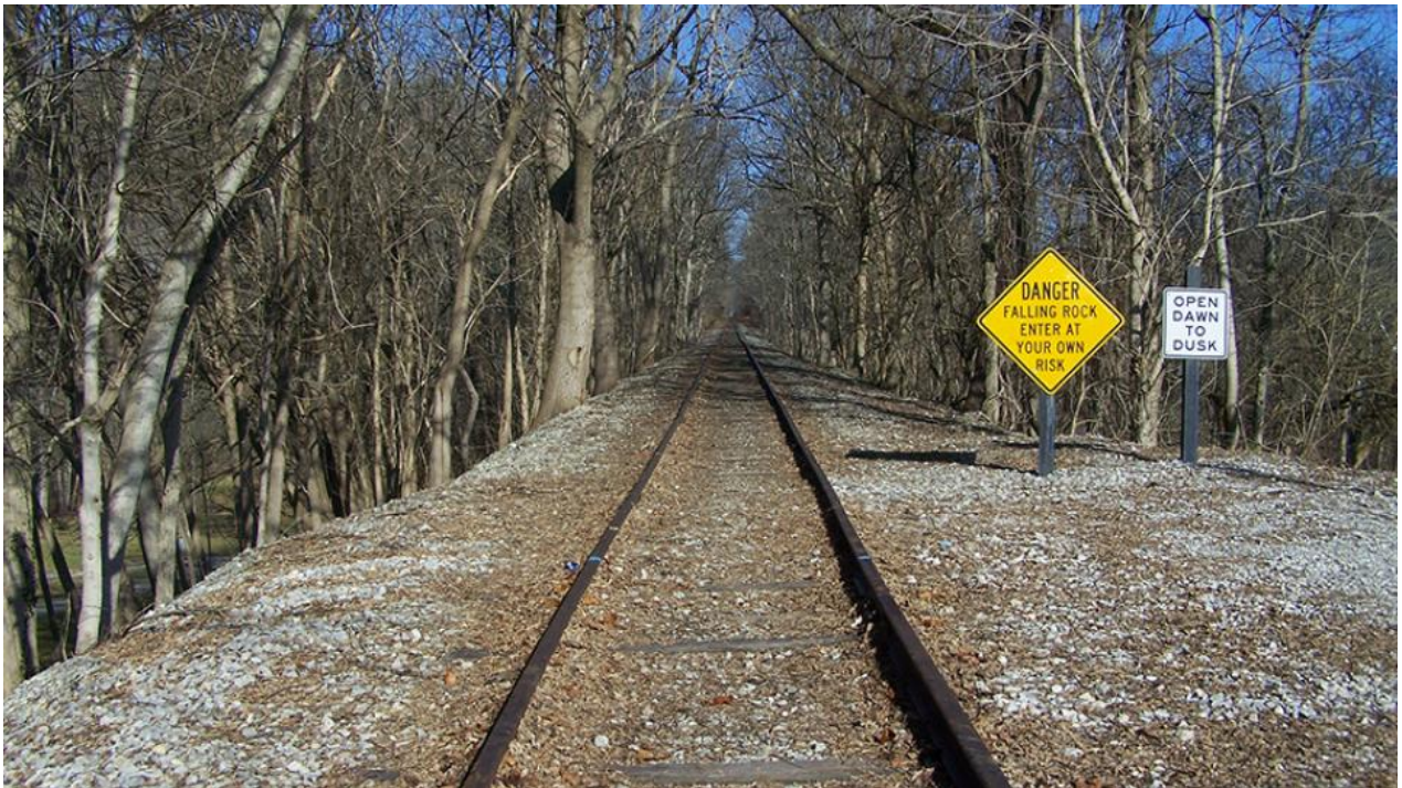
Photograph of the Madison, Indianapolis & Lafayette Railroad incline looking north.

between the base of the bluffs and the north side of the town, and empties into the Ohio immediately west of Madison. Branches of the creek, like Dugan Hollow, drain adjacent hills.