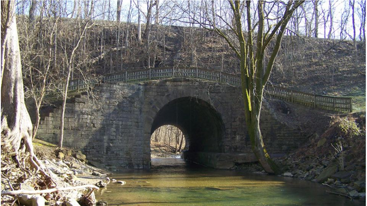
Photograph of the culvert carrying Crooked Creek beneath the Madison, Indianapolis & Lafayette Railroad. The devastation of the Crooked Creek Flood was intensified when the culvert became clogged with debris. The historic culvert was destroyed in the flood.