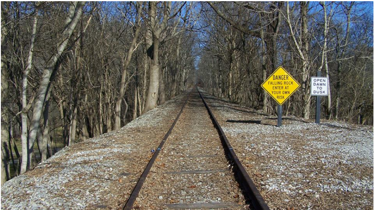
Photograph of the Madison, Indianapolis & Lafayette Railroad incline looking north.

between the base of the bluffs and the north side of the town, and empties into the Ohio immediately west of Madison. Branches of the creek, like Dugan Hollow, drain adjacent hills.