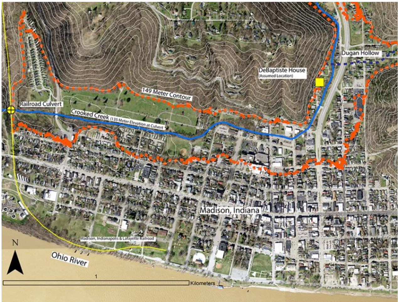
Map of Madison, Indiana showing the location of the railroad culvert and the DeBaptiste property. The white lines represent 10-meter contours and demonstrate how Madison was built on a riverside plateau adjacent to substantial bluffs. The dashed red line represents the 149 m contour line, which is the elevation of the DeBaptiste property and the elevation floodwaters would need to reach to affect buildings on the property. (Click to enlarge image)