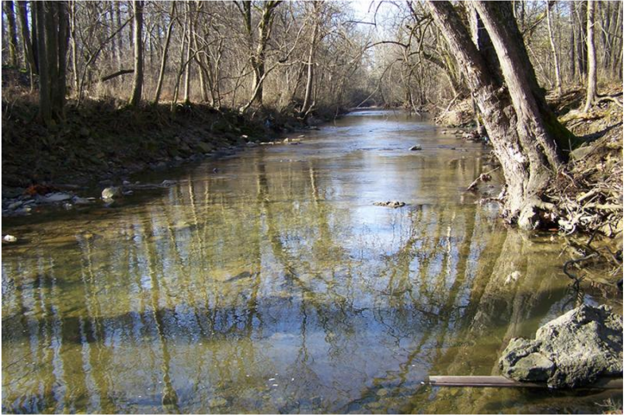
Photograph of Crooked Creek at its location on the north boundary of Madison, Indiana (looking east).