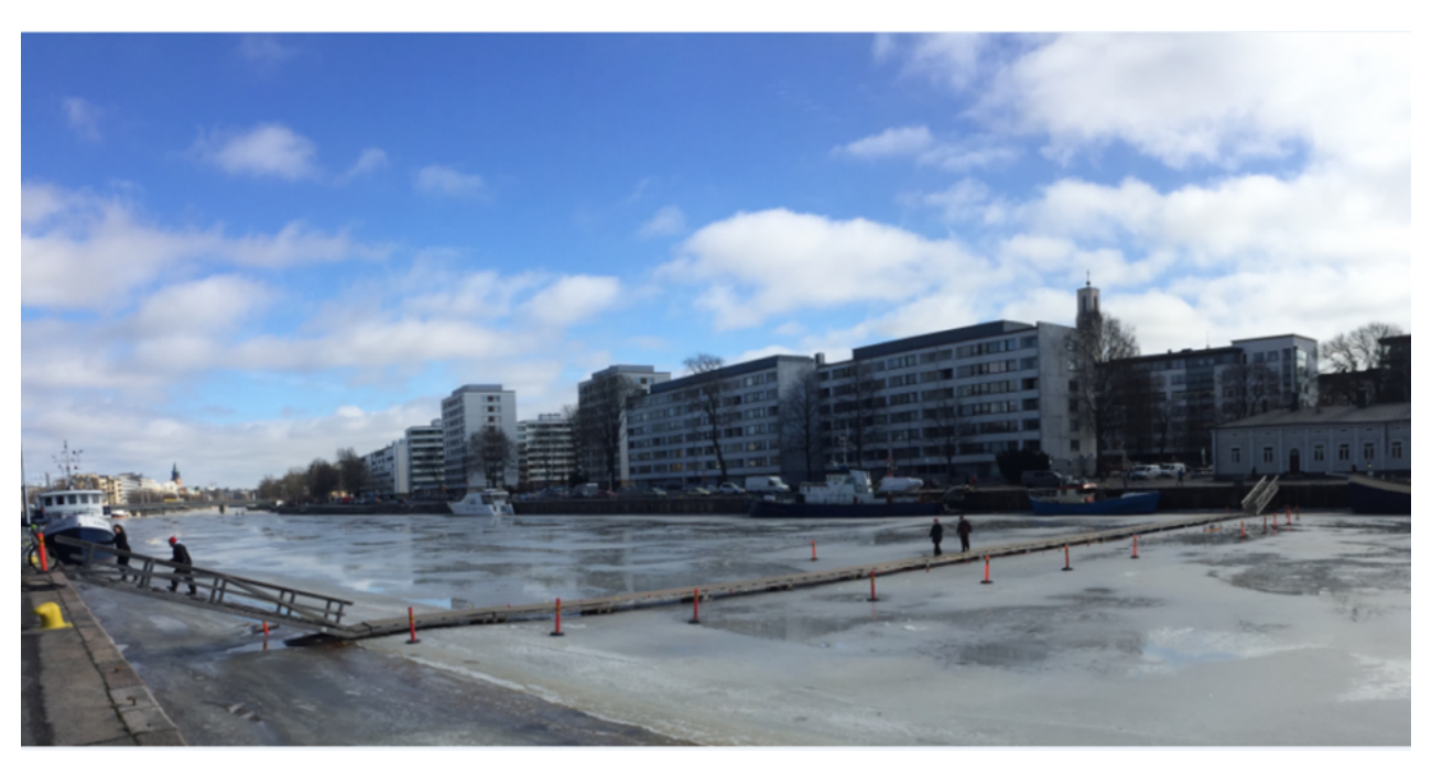
Gangways across the rivers are frequently used in Turku when they are possible. This photo is from 2018.

On Tuesday 24 March 1903, the Aura River in Turku was declared ice-free, which was three weeks earlier than usual. Two local newspapers, Åbo Tidning and Åbo Underrättelser, labeled it as the earliest breakup in the memory of the oldest man. At that time, there were no official records of the breakups; however, the newspapers' statements were not entirely wrong. A breakup chronology constructed in 2019 shows that the breakup in 1903 was the fifth time since 1749 that the river was declared ice-free in March. Hence, the timing of the event was exceptional and so was the breakup itself.