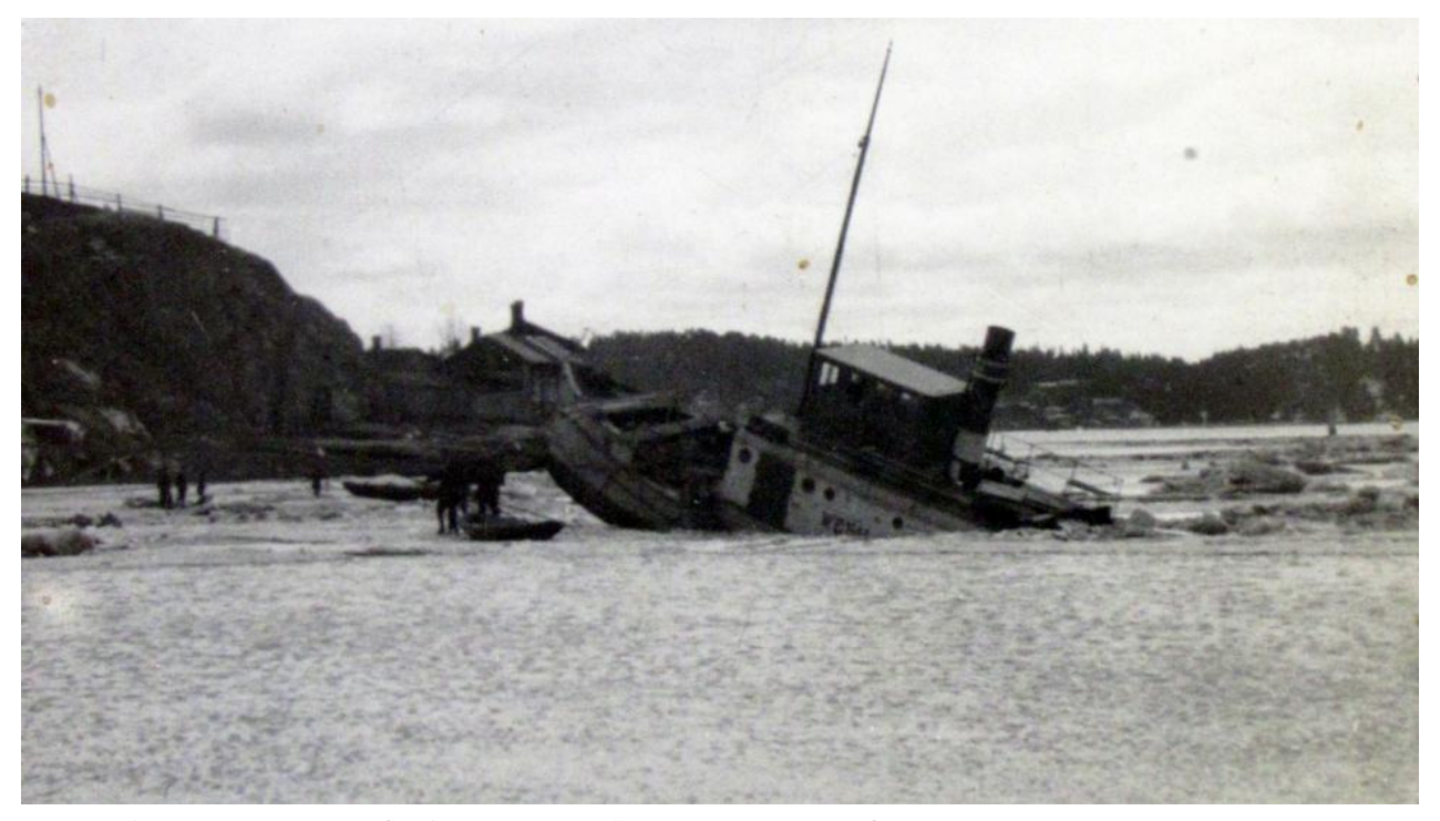
In the breakup in 1903, the ice-jam flood swept Wehmaa all the way to the mouth of the Aura River.

ferry crashed into Salo , a 30-meter-long steamer, which in turn crashed into Balder and Hebe , which were the same length. The ice also smashed into Carl von Linné , a 45-meter-long steamer, causing it to turn 90 degrees and, while being dragged by the bollards to which it was moored, Carl von Linné crashed into Necken , a 32-meter-long steamer. Thereafter, the ice-flood hit Wehmaa —a 22-meter-long steamer—moored with five chains, all of which broke. With the pressure of the ice, the ship listed, causing it to take in water. The ice flood carried the ship circa one kilometer to the estuary, where it came to a halt, half-sunken, at a 45-degree angle, not far from the passenger ferry, which had been dragged with the ice for almost two kilometers. The river lay quiet one hour after the ice jam at Aura Bridge broke. The ferry was towed back the following day, whereas Wehmaa —whose hull, against all odds, remained intact—was towed on 27 March. Fortunately, the breakup occurred when the city was sound asleep, which is why there were no casualties. For the citizens who depended on the ferry to get across the river, its absence probably generated some nuisance in the morning on 24 March. Besides the minor damages caused to private households, and the destroyed moorings and quays that were maintained by the city, most of the costs fell on the ship owners.