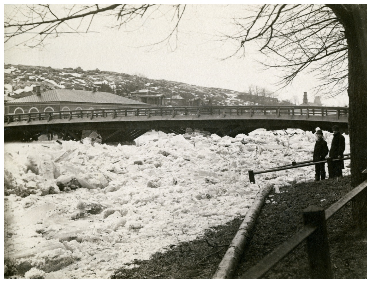
This photo from 1882 shows what it probably looked like in 1903 as the ice threatened the bridge.

On the evening of 23 March 1903, it started pouring, causing the water level in the river to rise swiftly. As the river expanded, the ice sheet broke, and at 4 a.m., it started moving from the upper reaches towards the Aura Bridge, taking with it everything in its path, such as private wooden landings, fences, and timber stored on the embankments. An hour later, pushing forward into the narrowest part of the river, the ice jam forced ice blocks up and over the quays. According to Uusi Aura , a local newspaper, the water level rose to about two fathoms (3.65 meters) above normal, and as the ice threatened the Aura Bridge, the fire department and the city engineer closely monitored the situation. At about 6 a.m., while most of the citizens were sound asleep, the ice jam at Aura Bridge broke.