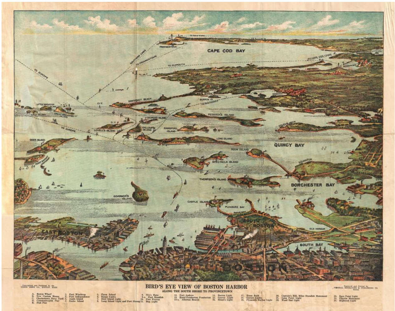
An 1899 bird's-eye view of Boston Harbor. Notice the smokestacks suggesting the industrial uses of many of the harbor islands.