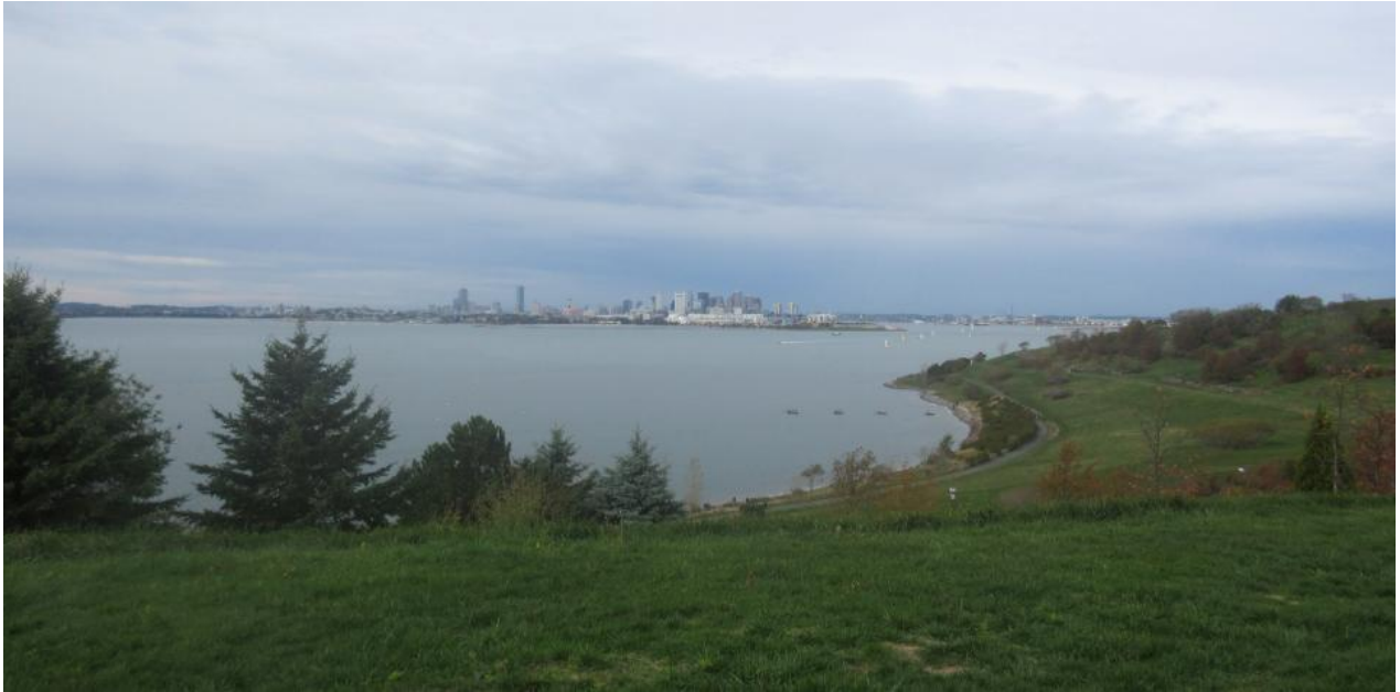
The Boston skyline seen from Spectacle Island, 2016.