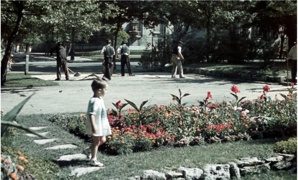
City Park in 1941 in the vicinity of Stefánia road.