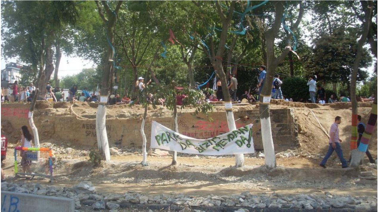
The location of the bulldozed trees on May 27, 2013, at Gezi Park.