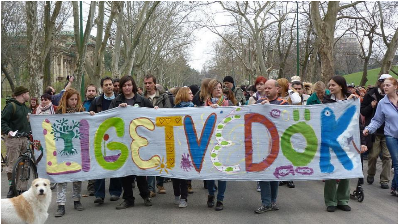
Protests against the Liget project in March 2016.

Photograph by Elekes Andor, 28 March 2016.