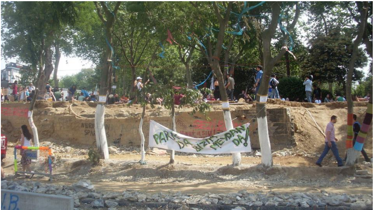
The location of the bulldozed trees on May 27, 2013, at Gezi Park.