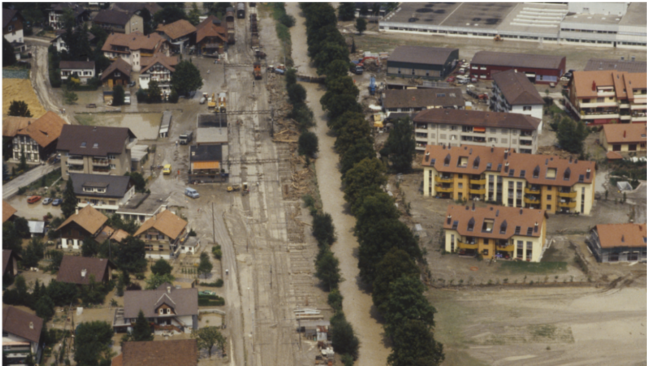
Flooded settlement in Toffen after the event of 29 July 1990.