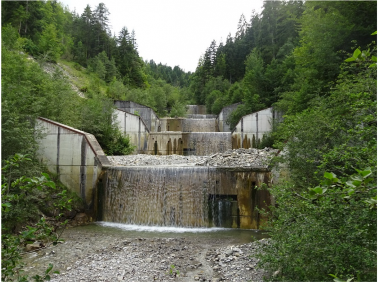
Torrent check dams in the gorge of the Gürbe River.

in Wattenwil, August 2017.