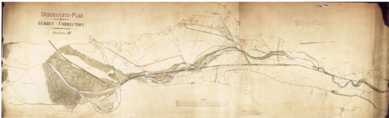
Plan of the natural course of the Gürbe River and the planned channel in Wattenwil, 1881.

Courtesy of Staatsarchiv des Kantons Bern, StAB AA V 123.