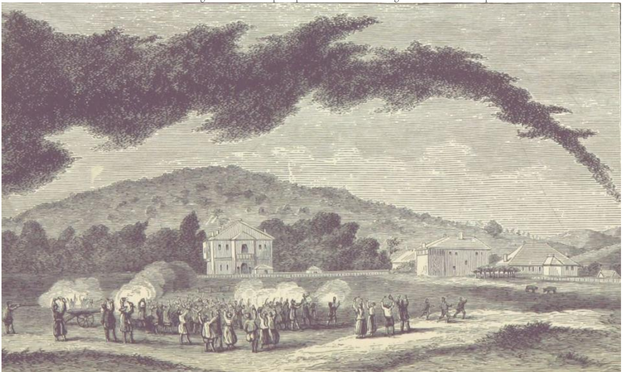
Drawing of a swarm of locusts, 1875.

Borders concern much more than territorial lines and are constantly being reconfigured according to continual interactions between various agents. Boundaries between countries, species, or individuals often reflect local perspectives, influencing the recognition and control of plant pests. The study of the Moroccan locust ( Locustotaurus maroccanus ) surge, which occurred in the Iberian Peninsula between 1898 and 1905, allows us to discuss the relevance of considering those different perceptions to understanding the effectiveness of past measures.