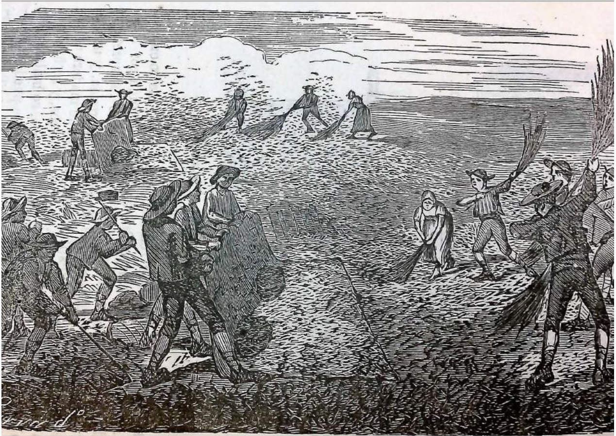
Nineteenth-century depiction of mechanical methods for locust control.

locusts' incidence between 1898 and 1905 suggests a self-regulating process linked with a natural fluctuation in relative abundance. Control measures were purely palliative. Ineffective anti-locust campaigns in Portugal were not related to unsuccessful Spanish campaigns. Neighboring populations erroneously perceived an undesirable border, which divided the territory, preventing the success of Portuguese campaigns against locusts.