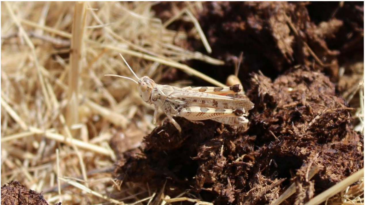
A Doclostaurus maroccanus in Southern Portugal (Castro Verde), July 2015.