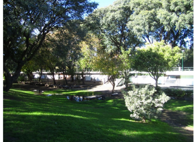
Present-day view of the breakwater from the same location, June 2014. The breakwater has been renovated and reopened to the public recently.

This work is used by permission of the copyright holder.