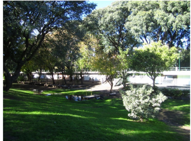
Present-day view of the breakwater from the same location, June 2014. The breakwater has been renovated and reopened to the public recently.

This work is used by permission of the copyright holder.