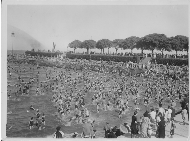
A view of the Balneario Municipal when it still functioned as a swimming area in January 1936.

Municipal or the public swimming area. Opened to the public in 1918, this breakwater originally jugged out into the Río de la Plata, and steps leading down into the water gave Porteños—the name for citizens of Buenos Aires—a welcome respite from intense summer heat. Avenida Costanera Sur, which now goes by the name Avenida Dr. Tristán Achával Rodríguez, ran parallel to the water's edge and was lined with restaurants and cafes. Throughout much of the twentieth century, since the construction of this space in 1918, Porteños cherished that contact with the river and the social interaction the space provided.