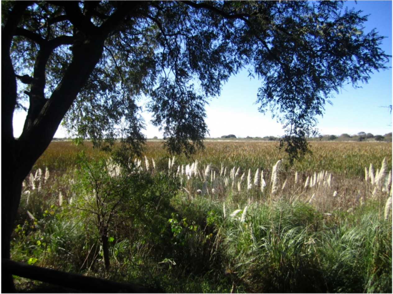
A view of the interior marshland of the Reserva Ecológica, June 2014.