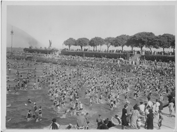
A view of the Balneario Municipal when it still functioned as a swimming area in January 1936.

Municipal or the public swimming area. Opened to the public in 1918, this breakwater originally jugged out into the Río de la Plata, and steps leading down into the water gave Porteños—the name for citizens of Buenos Aires—a welcome respite from intense summer heat. Avenida Costanera Sur, which now goes by the name Avenida Dr. Tristán Achával Rodríguez, ran parallel to the water’s edge and was lined with restaurants and cafes. Throughout much of the twentieth century, since the construction of this space in 1918, Porteños cherished that contact with the river and the social interaction the space provided.