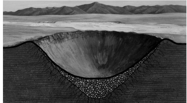
Artist's drawing of what the cross section of a nuclear explosion might look like, ca 1966.

Courtesy of the U.S. Department of Energy, HD.10.158. Accessed on 12 March 2019. Click here to view Flickr source.