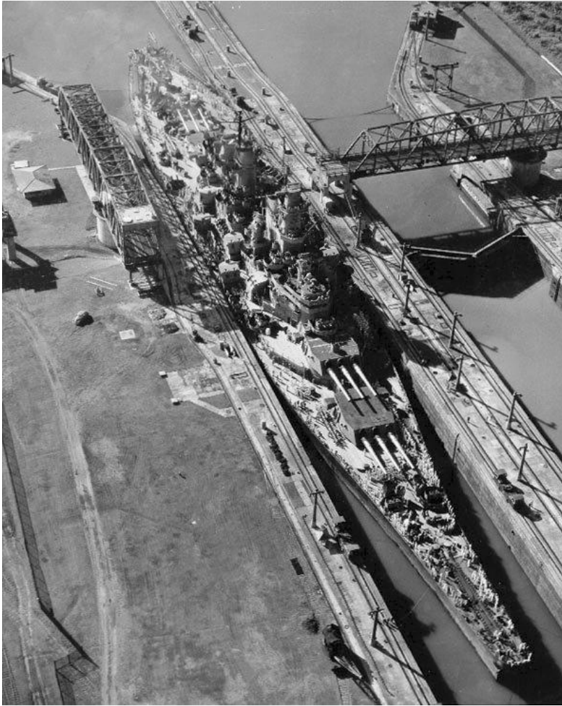
The USS Missouri making its way through the Miraflores locks, 13 October 1945.