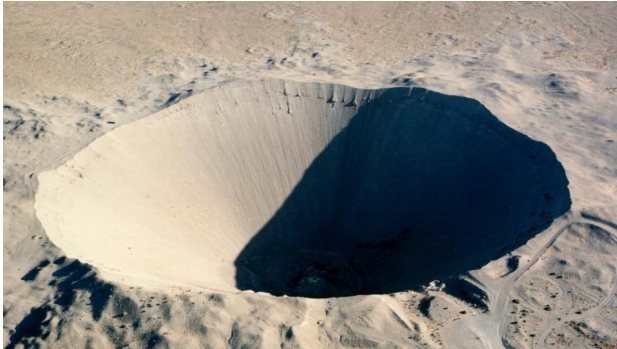
The Sedan Crater at the Nevada Test Site, n.d.

suggesting, “The banks of a nuclearly excavated canal would be natural angles of repose and therefore would be stable.” The more nuclear tests the AEC conducted, however, the more slope stability seemed to be the bane of the technology. The 1962 Danny Boy Test reinforced this concern. Danny Boy’s slopes were as steep as 45 degrees near the top of the crater and had resulted from only a 0.4 kt blast. The AEC suggested that 5 to 10 Mt devices were necessary to cut through the rocky continental divide of the Isthmus. There was a distinct potential that exponentially larger blasts might spawn exponentially steeper slopes as well.