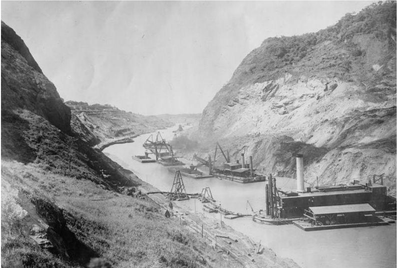
Photo of the dredges removing material from the Cucaracha slide in the Culebra Cut, ca. 1913.

Courtesy of Library of Congress, Prints & Photographs Division, LC-DIG-ggbain-17283. Accessed on 12 March 2019. Click here to view source.