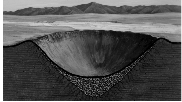
Artist’s drawing of what the cross section of a nuclear explosion might look like, ca 1966.

Courtesy of the U.S. Department of Energy, HD.10.158. Accessed on 12 March 2019. Click here to view Flickr source.