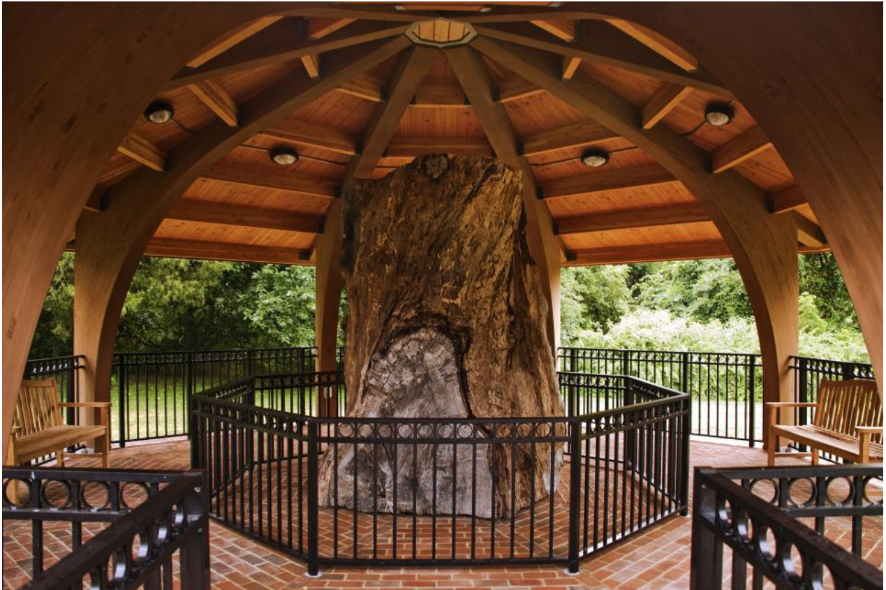
The remains of the Wye Oak in 2009.

To this day, the quantification and listing of national champion trees remains popular in the United States. There is something distinctively American—and masculinist—about the practice: bigger means better, biggest wins first prize, and the winner gets a photo shoot. British and European dendrophiles, and Canadian old-growth activists, have recently borrowed the practice of “champion tree” registries, but only Americans conduct a full-fledged competition. This tradition benefits from intranational rivalries between the 50 states.