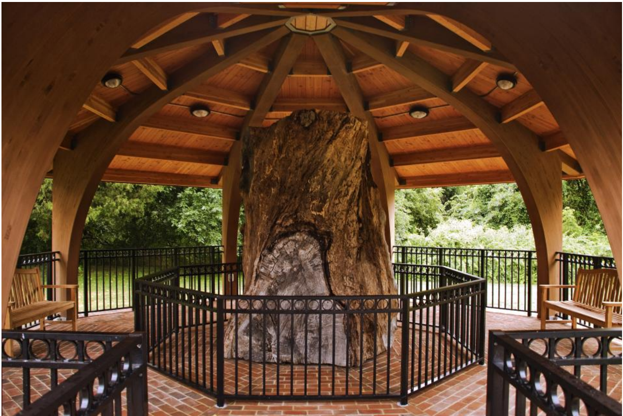
The remains of the Wye Oak in 2009.

To this day, the quantification and listing of national champion trees remains popular in the United States. There is something distinctively American—and masculinist—about the practice: bigger means better, biggest wins first prize, and the winner gets a photo shoot. British and European dendrophiles, and Canadian old-growth activists, have recently borrowed the practice of “champion tree” registries, but only Americans conduct a full-fledged competition. This tradition benefits from intranational rivalries between the 50 states.