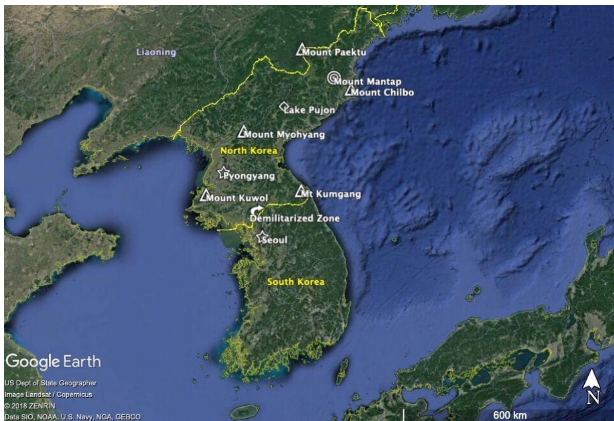
Fig. 5. Map showing locations of North Korea's six national parks (denoted by triangles or squares) and Mount Mantap, the location of the 3 September 2017 nuclear test (near top center). Mount Paektu (top center), a sacred site for many Koreans, sits only 114 km northwest of Mount Mantap.