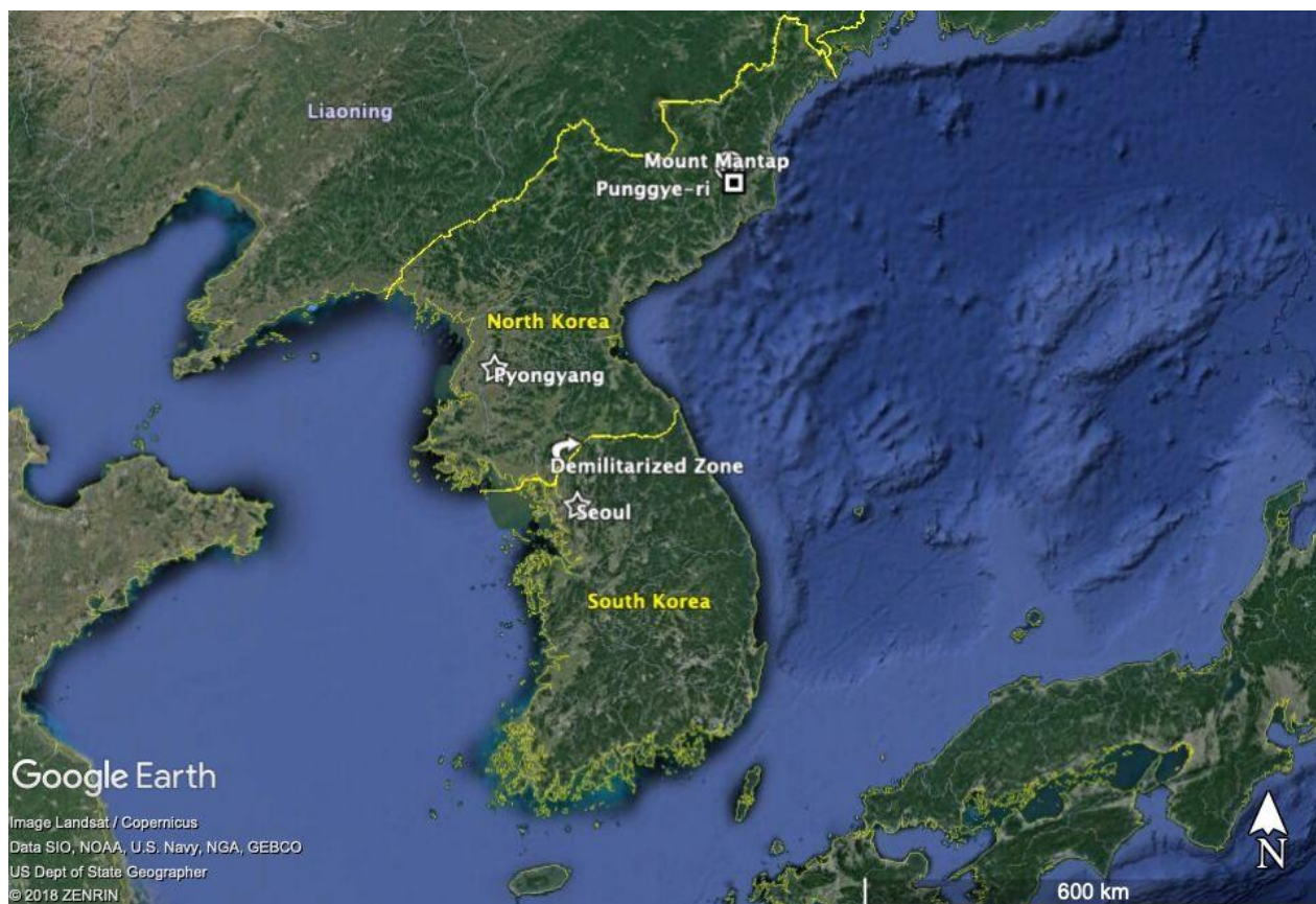
Fig. 1. The Korean Peninsula with Mount Mantap and the Punggye-ri Nuclear Testing Site identified near the top center. Stars denote the capital cities of both Koreas. The yellow line marked by an arrow in the center of the image marks the Demilitarized Zone.