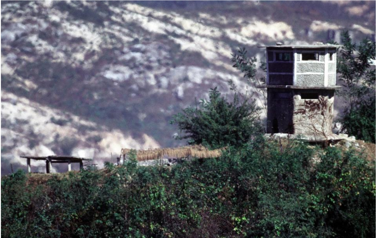
Fig. 6. A North Korean observation post in the Demilitarized Zone.

Photograph by Jeffrey Allen, 20 October 1998.