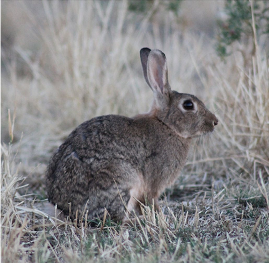
European rabbit, Oryctolagus cuniculus

National parks rely on human conceptions of nature. While these spaces are used for a variety of activities—education, tourism, research—the appeal and significance of these activities is contingent on them happening in “natural” environments. For Australia in particular, management authorities position national parks as spaces that are essential to the conservation of our unique flora and fauna as they offer physical protection for native species as well as management programs to ensure their continuation. In light of this, native species are seen to belong in national parks, while pests, “invasives,” and alien species are seen as posing a threat to biodiversity and the naturalness of these spaces, and therefore do not belong. Today rabbits have been declared as pests in all states and territories across Australia and it is a legislative requirement that all public and private landowners take action to manage population numbers on their land.