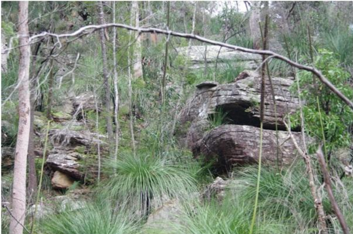
The rocky sclerophyll landscape in Ku-ring-gai Chase National Park

Management documents often position rabbits as not belonging in Australian national parks as they challenge human ideas of “nature” and can pose a threat to the conservation of native species. In Ku-ring-gai Chase the management of rabbits is unquestionably concerned with their removal and destruction, through rabbit control measures, such as baiting, trapping, shooting, habitat destruction, and the release of biological control measures including rabbit haemorrhagic disease virus (RHDV).