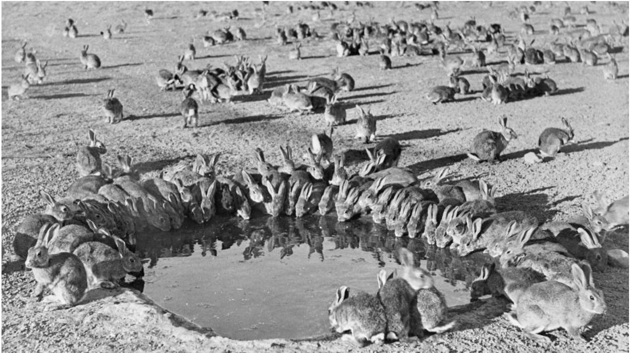
Rabbits in plague proportions in 1938

The fringe areas, where the park meets the urban, are constantly being maintained in ways that unintentionally attract rabbits. Processes such as gardening, turning up fresh dirt, mowing lawns, and planting vegetables and herbs draw rabbits to these spaces and provide them with ample food. As the availability of food impacts on the breeding cycles of rabbits, these human practices not only ensure that rabbits survive, but also that the populations of rabbits around Ku-ring-gai Chase can breed continuously throughout the year.