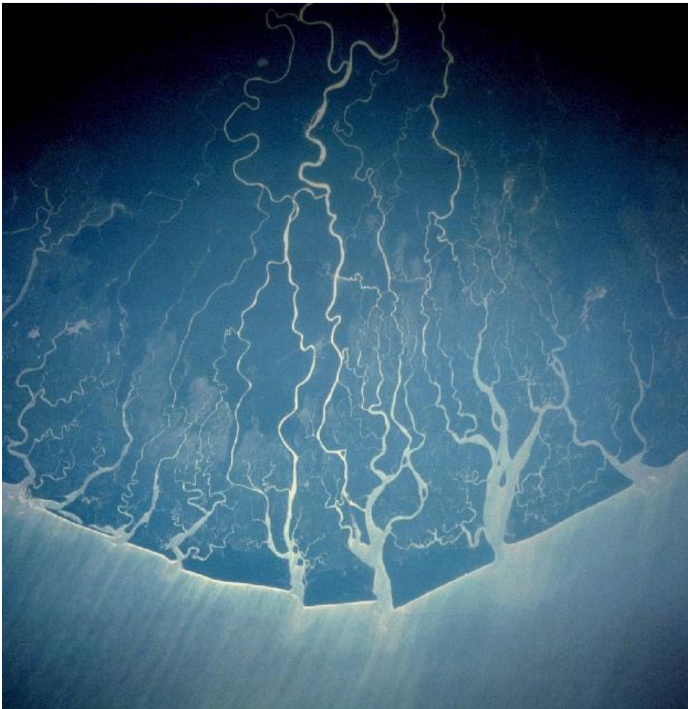
Satellite image of the Niger Delta

This photo has been produced by NASA. Click here to view Flickr source.