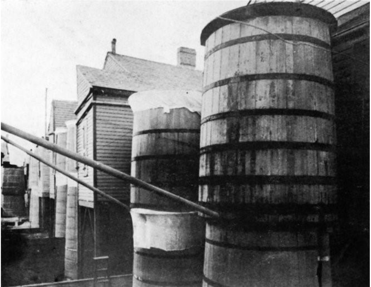
Water cisterns covered with cheesecloth to control mosquito breeding, New Orleans

From Rupert Boyce. Yellow Fever Prophylaxis in New Orleans, 1905 . London: Williams & Norgate, 1906. Click here to view Wikimedia source.