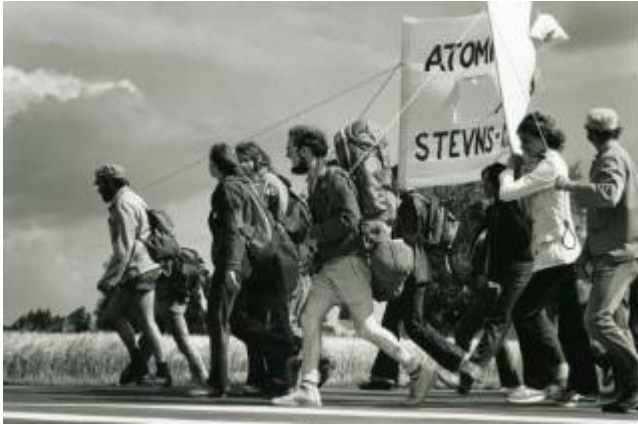
March from Stevns to Copenhagen, 26 and 27 August 1978. Energimuseet, Denmark

This photograph belongs to Energimuseet, Denmark, and can be found here on Europeana.