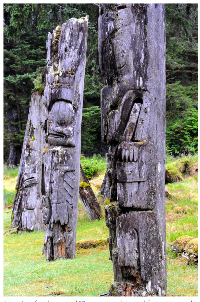
The ruins of ten houses and 32 mortuary poles carved from western red cedar ( Thuja plicata ) remain on the site of SGang Gwaay in Gwaii Haanas. In the 1930s and 1950s, fifteen poles were taken from the site and moved to museums on the mainland.

in SGang Gwaay Llnagaay (Anthony Island), Haida Gwaii, BC, Canada, in July 2011.