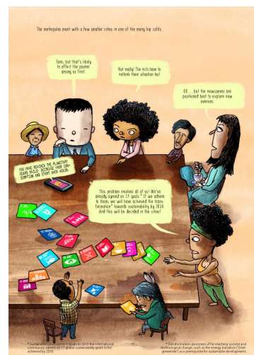
Page 11: The Urban Planet: How Cities Save Our Future

This work is used by permission of the copyright holder.