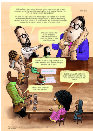
Page 10: The Urban Planet: How Cities Save Our Future

View the comic or download the PDF in English here or in Spanish here .