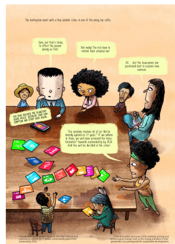
Page 11: The Urban Planet: How Cities Save Our Future

This work is used by permission of the copyright holder.