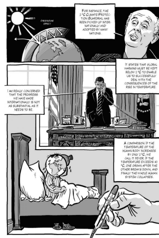
Page 19: The Great Transformation. Climate - Can We Beat the Heat? © Jacoby & Stuart

This work is used by permission of the copyright holder.