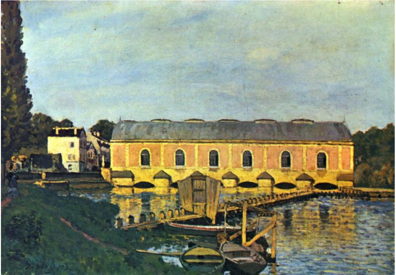
The 1859 Machine de Marly painted by Alfred Sisley in 1873

Painting by Alfred Sisley in 1873. The title in French: La Machine de Marly.